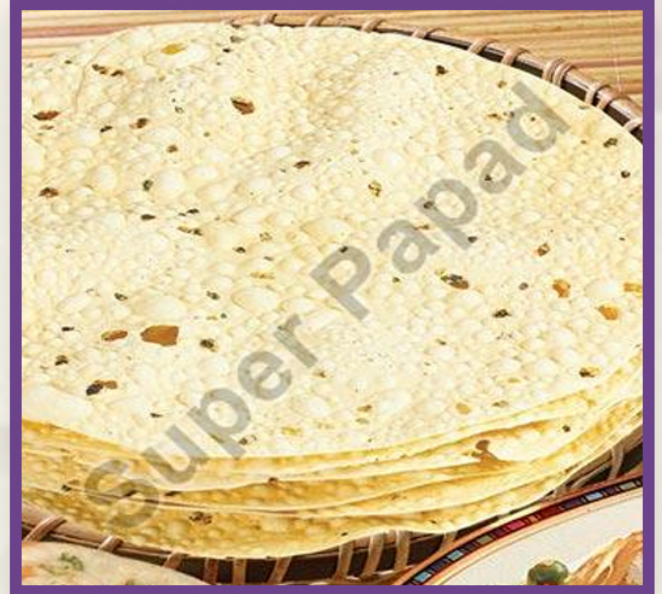
Cumin and Black Pepper Papad