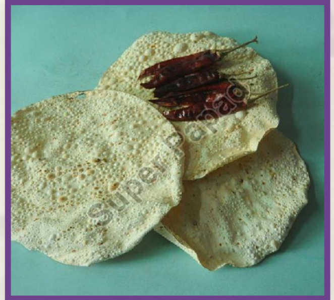
Red Chilli Papad