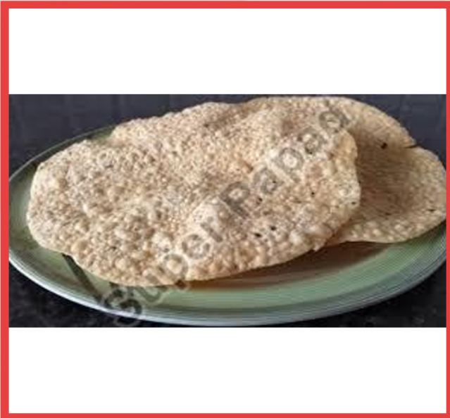
Moong Dal Papad