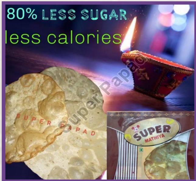
80% Less Sugar Mathiya