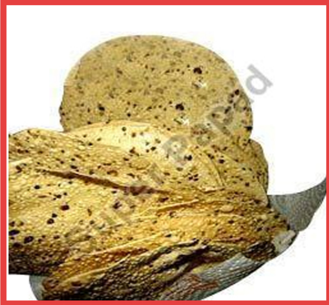
Black Pepper Papad