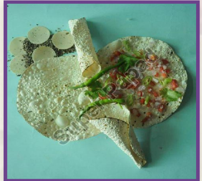
Green Chilli Papad