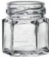
45 ML Hexa Jar

Height : 20 MM Cap : 40 MM Screw Packing : 224 Pcs