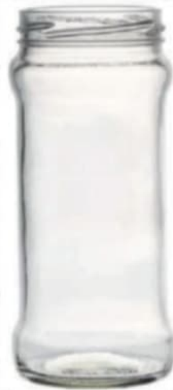
370 ML Olive Jar

Height : 120 MM Cap : 63 MM LUG Packing : 48 Pcs.