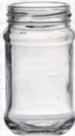
200 ML Fudkoor Jar

Height : 100 MM Cap : 53 MM LUG Packing : 96 Pcs.