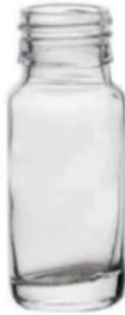
50 ML Round Honey Jar

Height : 72 MM Cap : 25 MM PP Packing : 356 Pcs.