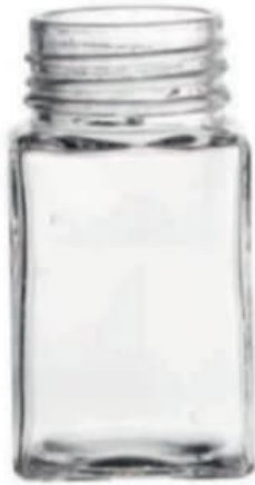
140 ML SQ Spice Jar

Height : 94 MM Cap : Screw Cap Packing : 96 Pcs.