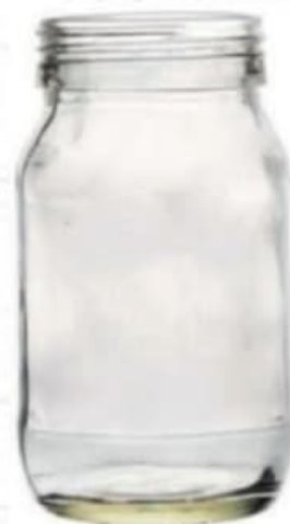
225 ML Ghee Jar

Height : 97 MM Cap : SPL Screw Cap Packing : 144 Pcs.