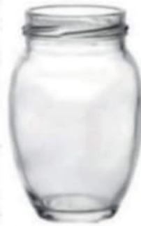
100 ML Matki Jar

Height : 54MM Cap : 43 MM Lug Cap Packing : 108 Pcs.