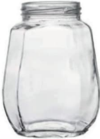
750 ML OCTA Jar

Height : 132 MM Cap : 63 MM Lug Cap Packing : 36 Pcs.