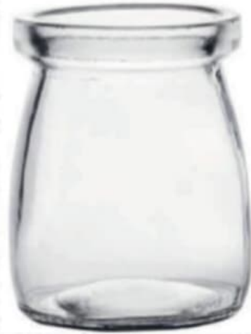
200 ML Yogurt Jar

Height : 70 MM Cap : PE LID Packing : 120 Pcs.