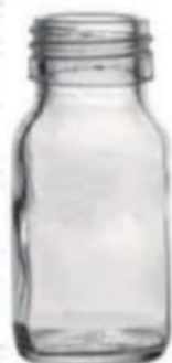
50 ML Ghee Jar

Height : 83 MM Cap : Screw Cap Packing : 244 Pcs.