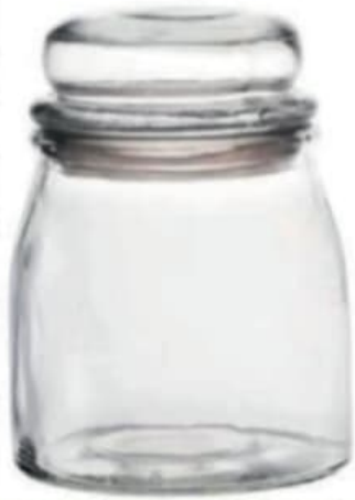
CC Candle Small Jar