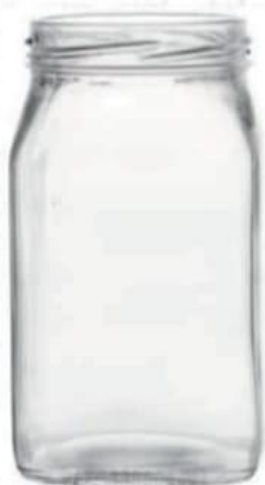
250 ML SQ Honey Jar

Height : 74 MM Cap : 36.60 MM Packing : 144 Pcs.