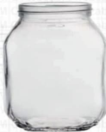
650 ML Choco Screw Jar

Height : 95 MM Cap : 77 MM Lug Cap Packing : 36 Pcs.