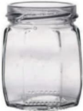
100 ML OCTA Jar

Height : 74 MM Cap : 53 MM Lug Cap Packing : 120 Pcs.