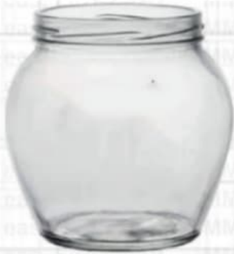
350 ML Matki Jar

Height : 100 MM Cap : 63 MM Lug Cap Packing : 54 Pcs.