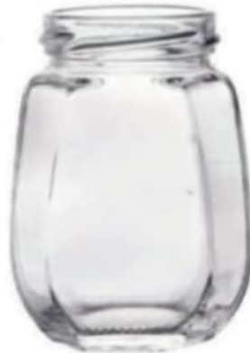
250 ML OCTA Jar

Height : 74 MM Cap : 53 MM Lug Cap Packing : 120 Pcs.