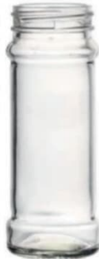
120 ML Condiment Jar

Height : 94 MM Cap : Screw Cap Packing : 96 Pcs.