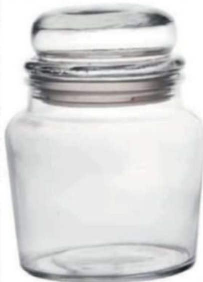
22 Oz Promo Jar