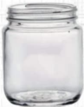
250 ML Round JD Jar

Height : 109 MM Cap : 53 MM Lug Cap Packing : 77 Pcs.