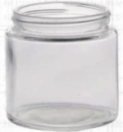
250 ML Screw Jar

Height : 60 MM Cap : Screw Cap Packing : 108 Pcs.