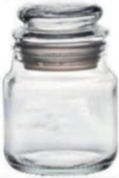
100 ML Yankee Jar