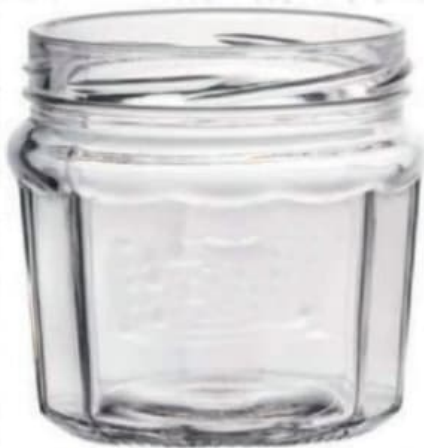
300 ML Gizaro Jar

Height : 93 MM Cap : 63 MM Screw Cap Packing : 48 Pcs.