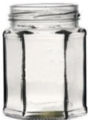
250 ML Hexa Screw Jar

Height : 65 MM Cap : 64 MM Lug Cap Packing : 60 Pcs