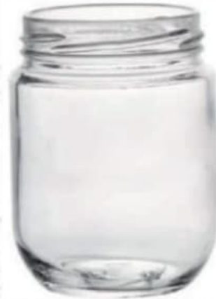
250 ML TT Jar

Height : 85 MM Cap : 63 MM Screw Cap Packing : 48 Pcs.