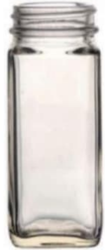
95 ML SQ Spice Jar

Height : 90 MM Cap : SPL Screw Packing : 120 Pcs.