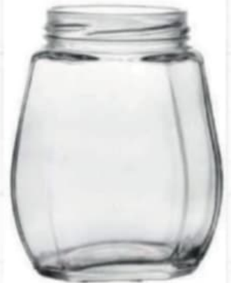
500 ML OCTA Jar

Height : 95 MM Cap : 53 MM Lug Cap Packing : 72 Pcs.