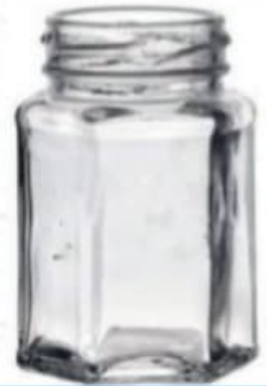
100 ML Hexa Jar

Height : 52 MM Cap : 43 MM Lug Cap Packing : 240 Pcs