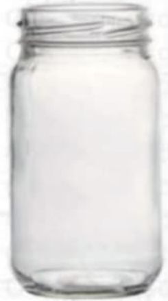
200 ML Round Jar

Height : 90 MM Cap : 53 MM Lug Cap Packing : 72 Pcs.