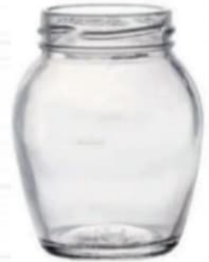
150 ML Matki Jar

Height : 80MM Cap : 43 MM Lug Cap Packing : 96 Pcs.