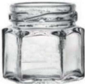
130 ML Hexa Jar

Height : 60 MM Cap : 43 MM Lug Cap Packing : 96 Pcs