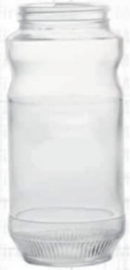
750 ML Fluted Jar

Height : 146 MM Cap : Special Cap Packing : 30 Pcs.