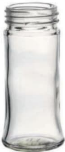
110 ML Georgio Jar

Height : 113 MM Cap : Screw Cap Packing : 120 Pcs.