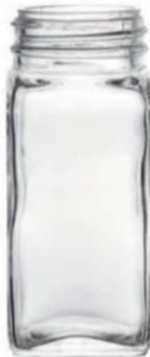
120 ML Spice Jar

Height : 108 MM Cap : 43 MM SPL Screw Packing : 120 Pcs.