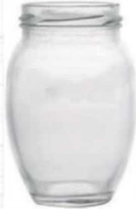
200 ML Filori Matki Jar

Height : 95MM Cap : 53 MM Lug Cap Packing : 72 Pcs.