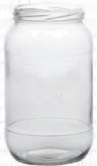
1000 ML New Round Jar

Height : 180 MM Cap : 82 MM Lug Cap Packing : 20 Pcs.