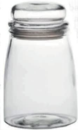
CC Candle Big Jar