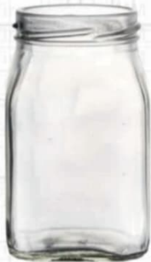
500 ML SQ Honey Jar

Height : 125 MM Cap : 63 MM LUG Packing : 60 Pcs.