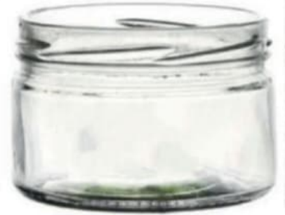
225 ML Salsa Jar

Height : 80 MM Cap : 63 MM Lug Cap Packing : 90 Pcs.