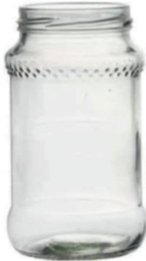
400 ML Dotted Jar

Height : 150 MM Cap : 63 MM LUG Packing : 48 Pcs.