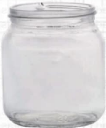
250 ML Choco Screw Jar

Height : 108 MM Cap : 63 MM Lug Cap Packing : 36 Pcs.