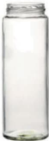
400 ML Bamboo Jar

Height : 144 MM Cap : 63 MM LUG Packing : 48 Pcs.