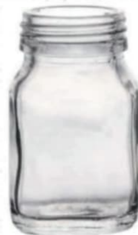
100 ML SQ Honey Jar

Height : 63 MM Cap : 31.5 MM PP Packing : 244 Pcs.