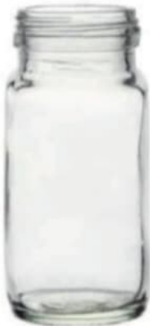
200 ML Round Honey Jar

Height : 88 MM Cap : 38 MM Screw Cap Packing : 96 Pcs.