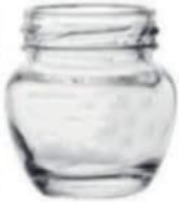
50 ML Matki Jar

Height : 54MM Cap : 43 MM Lug Cap Packing : 108 Pcs.