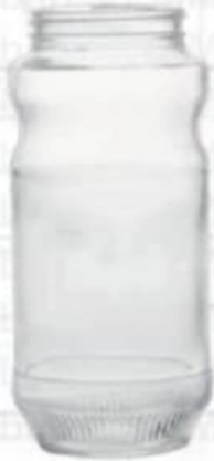
250 ML Fluted Jar

Height : 122 MM Cap : Special Cap Packing : 48 Pcs.