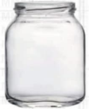
250 ML Choco Lug Jar

Height : 98 MM Cap : 53 MM Lug Cap Packing : 48 Pcs.