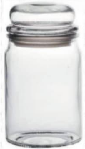
12 Oz MC Jar