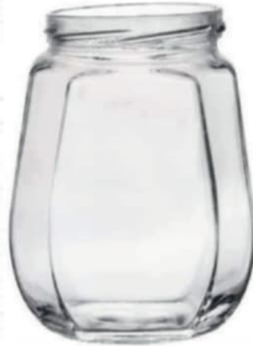
1000 ML OCTA Jar

Height : 132 MM Cap : 63 MM Lug Cap Packing : 36 Pcs.