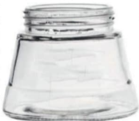
350 ML Corona Jar

Height : 87 MM Cap : Screw Cap Packing : 42 Pcs.