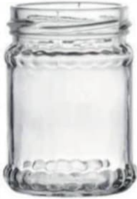
200 ML Narada Jar

Height : 75 MM Cap : 53 MM Screw Cap Packing : 72 Pcs.