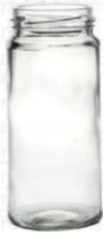
380 ML Fren Jar

Height : 185 MM Cap : 43 MM LUG Packing : 42 Pcs.