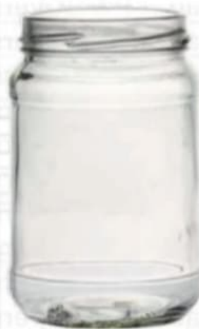
300 ML Round Jar

Height : 86 MM Cap : 63 MM Screw Packing : 48 Pcs.