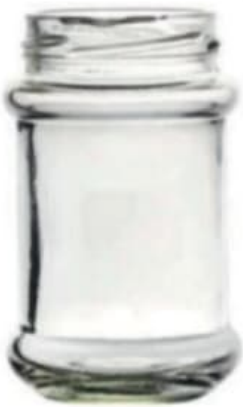
120 ML Fudkoor Jar

Height : 100 MM Cap : 53 MM LUG Packing : 96 Pcs.