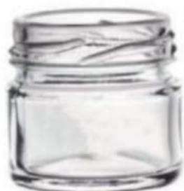
28 ML Jam Jar

Height : 37 MM Cap : 43 MM Lug Cap Packing : 300 Pcs.