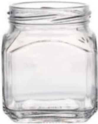
250 ML JD Jar

Height : 85 MM Cap : 63 MM Screw Cap Packing : 48 Pcs.