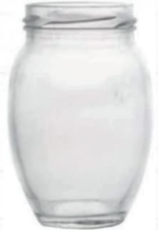
400 ML Filori Matki Jar

Height: 100MM Cap : 53 MM Lug Cap Packing 70 Pcs.