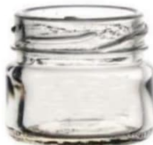
31 ML Jam Jar

Height : 37 MM Cap : 43 MM Lug Cap Packing : 300 Pcs.