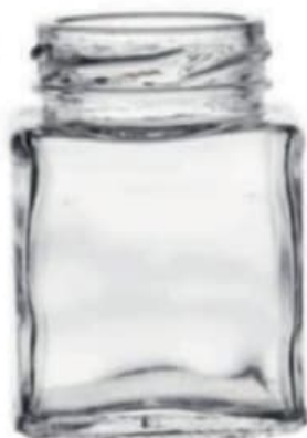
100 ML ITC Jar

Height : 48 MM Cap : 43 MM Lug Cap Packing : 126 Pcs.