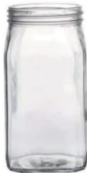
1000 ML SQ Honey Jar

Height : 125 MM Cap : 63 MM LUG Packing : 60 Pcs.