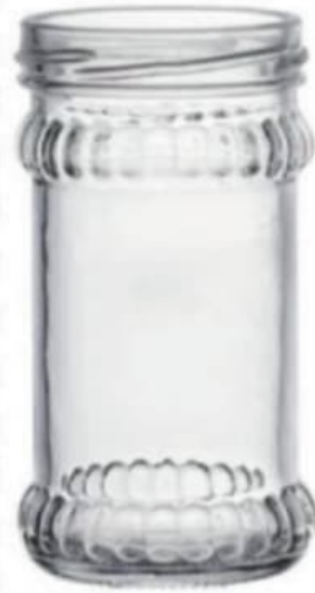
400 ML Narada Jar

Height : 75 MM Cap : 53 MM Screw Cap Packing : 72 Pcs.