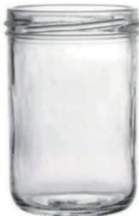
325 ML Taper Jar

Height : 85 MM Cap : 82 MM LUG Packing : 60 Pcs.