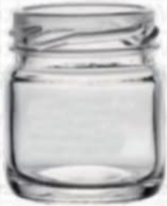
50 ML Round Jar

Height : 54 MM Cap : 43 MM Lug Cap Packing : 108 Pcs.