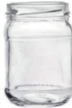
125 ML Jam Jar

Height : 40 MM Cap : 43 MM Lug Cap Packing : 256 Pcs.