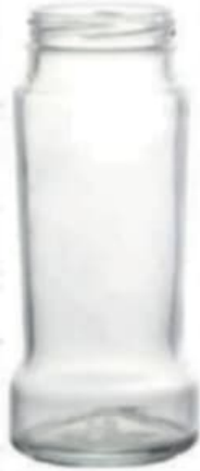
50 GM David off Coffee Jar

Height : 70 MM Cap : PE LID Packing : 120 Pcs.