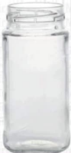
800 ML Nes Jar

Height : 148 MM Cap : Special Neck Packing : 24 Pcs.