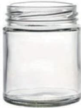
200 ML Salsa Jar

Height : 70 MM Cap : 53 MM Lug Cap Packing : 108 Pcs.