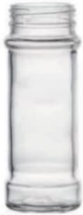
85 ML Spice Jar

Height : 120 MM Cap : 43 MM SPL Screw Packing : 120 Pcs.