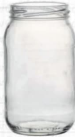
400 ML Round Jar

Height : 138 MM Cap : 70 MM Lug Cap Packing : 36 Pcs.