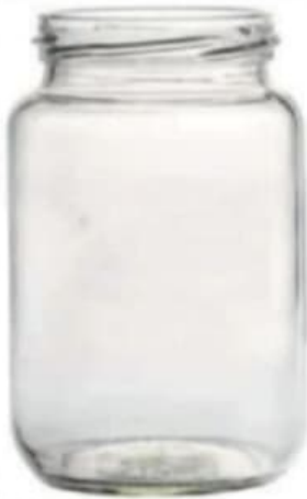
370 ML Maple Jar

Height : 120 MM Cap : 63 MM LUG Packing : 48 Pcs.