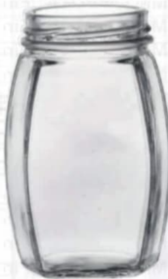
500 ML OCTA Honey Jar

Height : 105 MM Cap : 53 MM Lug Cap Packing : 72 Pcs.