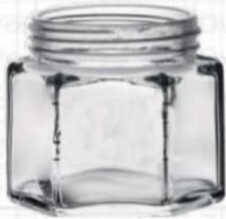
130 ML Screw Hexa Jar

Height : 60 MM Cap : 54 MM Lug Cap Packing : 72 Pcs