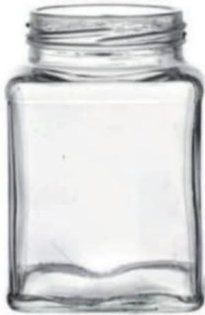
400 ML ITC Jar

Height : 110 MM Cap : 63 MM Lug Cap Packing : 48 Pcs.