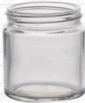
150 ML Screw Jar

Height : 70 MM Cap : Screw Cap Packing : 120 Pcs.