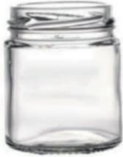
100 ML Salsa Jar

Height : 70 MM Cap : 53 MM Lug Cap Packing : 108 Pcs.