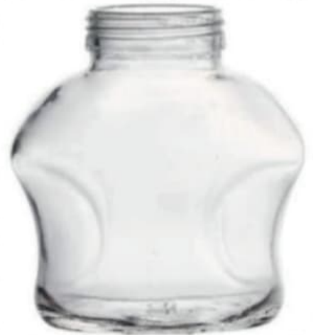
500 ML Human Jar

Height : 133 MM Cap : 63 MM LUG Packing : 48 Pcs.