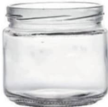
350 ML Salsa Jar

Height : 58 MM Cap : 82 MM Lug Cap Packing : 80 Pcs.