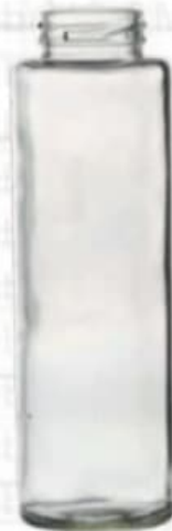
350 ML Bamboo Jar

Height : 132 MM Cap : 53 MM LUG Packing : 70 Pcs.