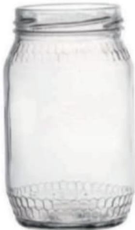
370 ML Fruit Jam Jar

Height : 80 MM Cap : 53 MM Lug Cap Packing : 108 Pcs.