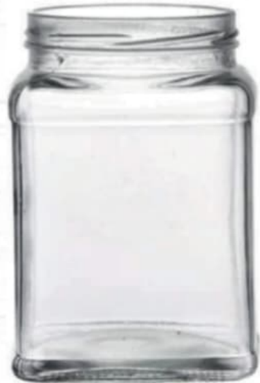
750 ML ITC Jar

Height : 110 MM Cap : 63 MM Lug Cap Packing : 48 Pcs.