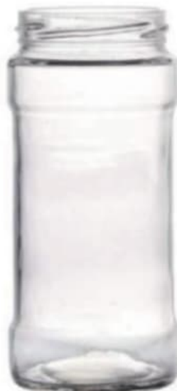
400 ML Pickle Jar

Height : 120 MM Cap : 63 MM Lug Cap Packing : 48 Pcs.