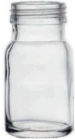
100 ML Round Honey Jar

Height : 84 MM Cap : 25 MM PP Packing : 244 Pcs.