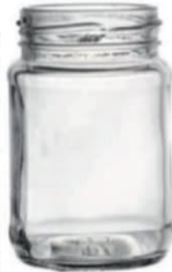
160 ML Round Jar

Height : 54 MM Cap : 43 MM Lug Cap Packing : 108 Pcs.