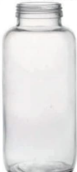
1000 ML Round Honey Jar

Height : 152 MM Cap : 54 MM Screw Cap Packing : 35 Pcs.