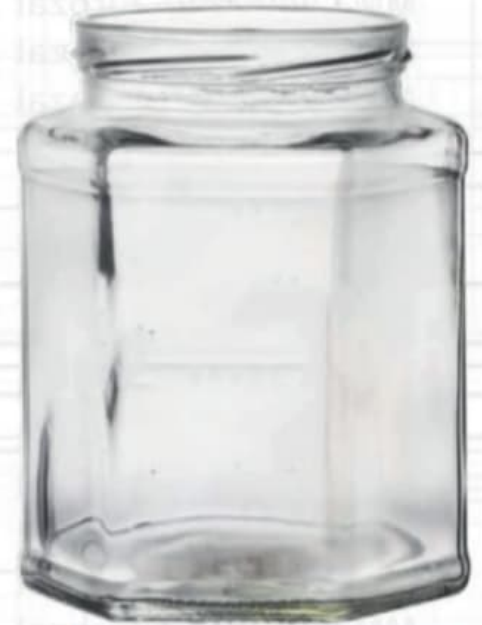
750 ML Hexa Jar

Height : 130 MM Cap : 63 MM Lug Cap Packing : 35 Pcs