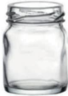
60 ML Jam Jar

Height : 40 MM Cap : 43 MM Lug Cap Packing : 256 Pcs.