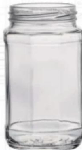
450 ML Chutney Jar

Height : 130 MM Cap : 63 MM Lug Cap Packing : 35 Pcs