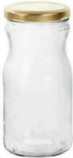
300 ML Fancy Jar

Height : 150 MM Cap : 63 MM LUG Packing : 48 Pcs.