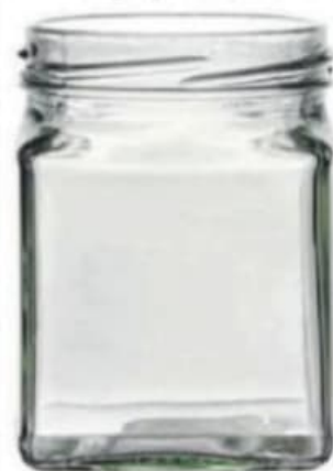
200 ML ITC Jar

Height : 68 MM Cap : 43 MM Lug Cap Packing : 108 Pcs.