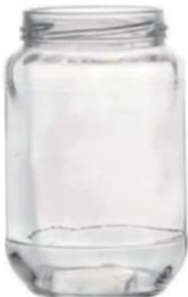
400 ML Kerala Pickle Jar

Height : 152 MM Cap : 63 MM Screw Packing : 48 Pcs.