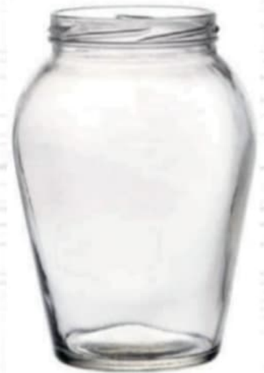
1000 ML Matki Jar

Height : 140MM Cap : 82 MM Lug Cap Packing : 24 Pcs.