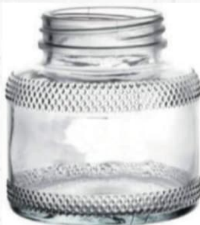
350 ML Diamond Jar

Height : 87 MM Cap : Screw Cap Packing : 42 Pcs.