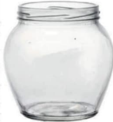
400 ML Matki Jar

Height : 100 MM Cap : 63 MM Lug Cap Packing : 54 Pcs.