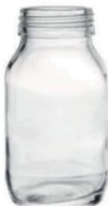
100 ML Ghee Jar

Height : 83 MM Cap : Screw Cap Packing : 244 Pcs.