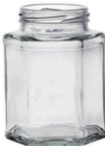
400 ML Hexa Jar

Height : 65 MM Cap : 64 MM Lug Cap Packing : 60 Pcs