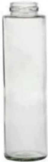
450 ML Bamboo Jar

Height : 213 MM Cap : 53 MM LUG Packing : 35 Pcs.