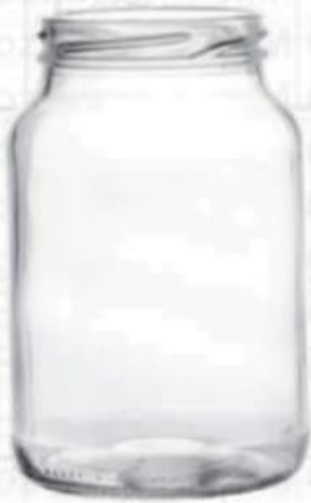
500 ML Global Jar

Height : 138 MM Cap : 70 MM Lug Cap Packing : 36 Pcs.