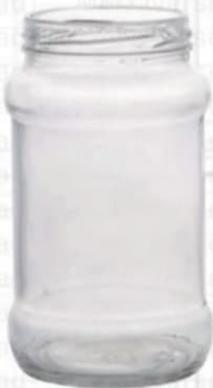
400 ML Fudkoor Jar

Height : 125 MM Cap : 63 MM LUG Packing : 72 Pcs.