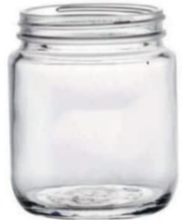
500 ML Round JD Jar

Height : 130 MM Cap : 63 MM Lug Cap Packing : 35 Pcs.