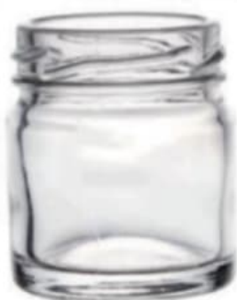
40 ML Jam Jar

Height : 40 MM Cap : 43 MM Lug Cap Packing : 280 Pcs.