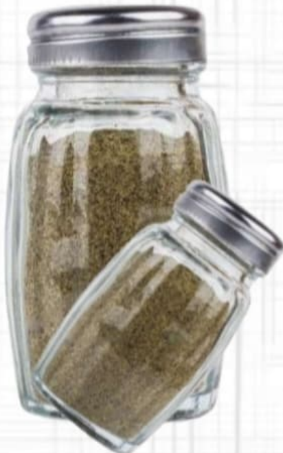
100 ML Block Jar

Height : 95 MM Cap : 38 MM Screw Cap Packing : 120 Pcs.