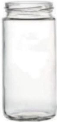
250 ML Bamboo Jar

Height : 132 MM Cap : 53 MM LUG Packing : 70 Pcs.