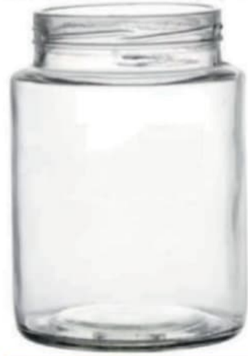
750 ML Salsa Jar

Height : 114 MM Cap : 63 MM Lug Cap Packing : 48 Pcs.