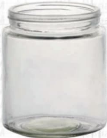
500 ML Screw Jar

Height : 78 MM Cap : Screw Cap Packing : 42 Pcs.