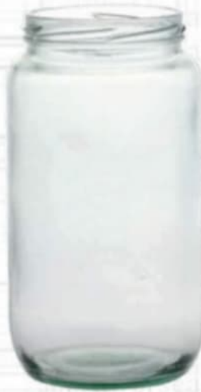
1000 ML Round Jar

Height : 148 MM Cap : 82 MM Lug Cap Packing : 24 Pcs.