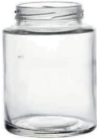
400 ML Salsa Jar

Height : 114 MM Cap : 63 MM Lug Cap Packing : 48 Pcs.