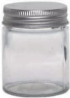
100 ML Screw Jar

Height : 70 MM Cap : Screw Cap Packing : 120 Pcs.