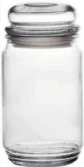
22 Oz MC Jar