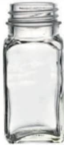
90 ML SQ Spice Jar

Height : 120 MM Cap : 43 MM SPL Screw Packing : 120 Pcs.