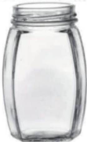
250 ML OCTA Honey Jar

Height : 110 MM Cap : 63 MM Lug Cap Packing : 48 Pcs.