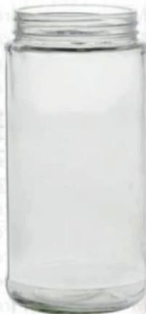
1000 ML Screw Jar

Height : 105 MM Cap : Screw Cap Packing : 30 Pcs.