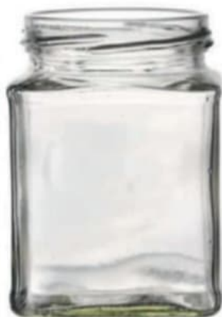
250 ML ITC Jar

Height : 84 MM Cap : 63 MM Lug Cap Packing : 72 Pcs.