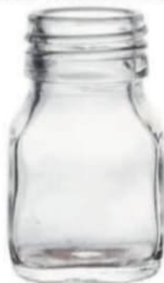
50 ML SQ Honey Jar

Height : 51 MM Cap : 25 MM STD Packing : 356 Pcs.