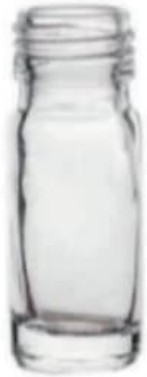
25 ML Round Honey Jar

Height : 72 MM Cap : 25 MM PP Packing : 356 Pcs.