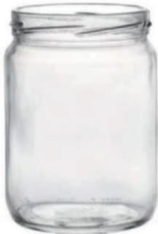
555 ML Round Jar

Height : 114 MM Cap : 83 MM Screw Packing : 30 Pcs.