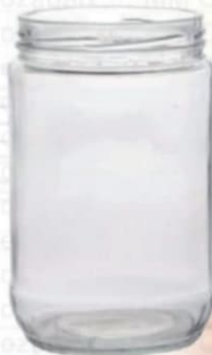
720 ML Round Jar

Height : 123 MM Cap : 82 MM Lug Cap Packing : 48 Pcs.