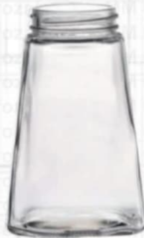
650 ML SBN Coffee Jar

Height : 95 MM Cap : Special Neck Packing : 48 Pcs.