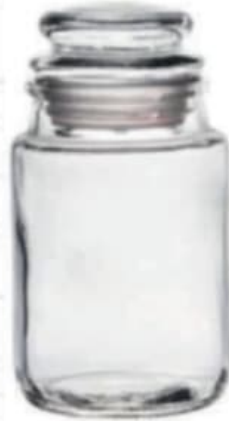
05 Oz WW Jar