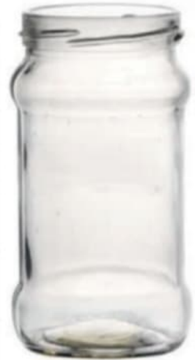
300 ML Fudkoor Jar

Height : 102 MM Cap : 53 MM LUG Packing : 96 Pcs.