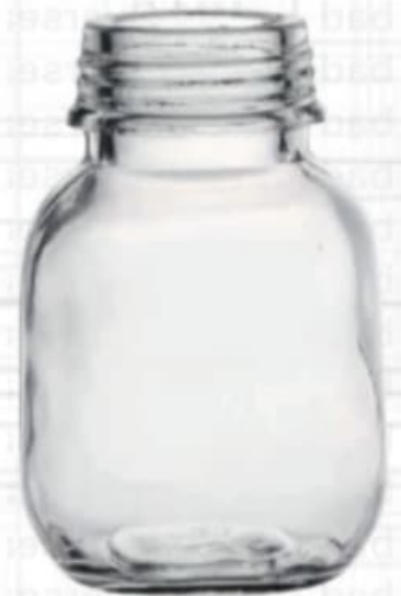
500 ML Block Jar

Height : 95 MM Cap : 38 MM Screw Cap Packing : 120 Pcs.