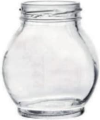
250 ML Matki Jar

Height : 95MM Cap : 53 MM Lug Cap Packing : 72 Pcs.