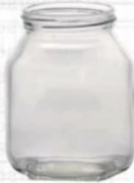
180 ML Choco Screw Jar

Height : 100 MM Cap : 53 MM Lug Cap Packing : 48 Pcs.