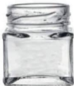
50 ML ITC Jar

Height : 48 MM Cap : 43 MM Lug Cap Packing : 126 Pcs.