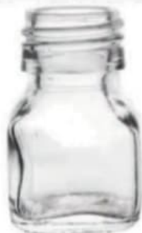
25 ML SQ Honey Jar

Height : 51 MM Cap : 25 MM STD Packing : 356 Pcs.