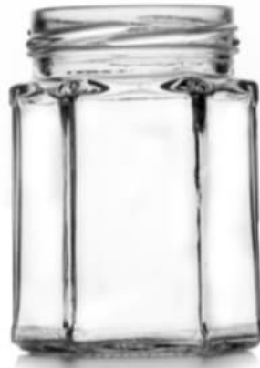
200 ML Hexa Jar

Height : 60 MM Cap : 54 MM Lug Cap Packing : 72 Pcs