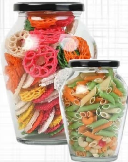
750 ML Matki Jar

Height : 140MM Cap : 82 MM Lug Cap Packing : 24 Pcs.