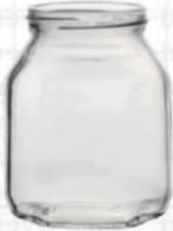
180 ML Choco Lug Jar

Height : 100 MM Cap : 53 MM Lug Cap Packing : 48 Pcs.