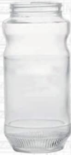
500 ML Fluted Jar

Height : 122 MM Cap : Special Cap Packing : 48 Pcs.