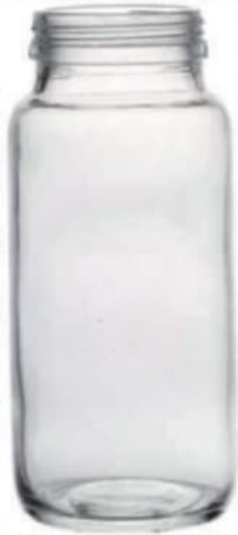
500 ML Round Honey Jar

Height : 152 MM Cap : 54 MM Screw Cap Packing : 35 Pcs.