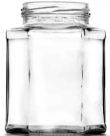
250 ML Hexa Jar

Height : 90 MM Cap : 63 MM Lug Cap Packing : 72 Pcs