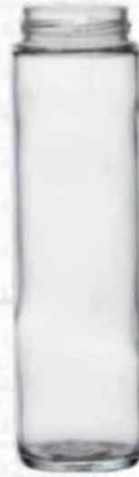
450 ML Bamboo Jar

Height : 213 MM Cap : 53 MM LUG Packing : 35 Pcs.