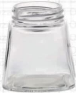
330 ML SBN Coffee Jar

Height : 95 MM Cap : Special Neck Packing : 48 Pcs.