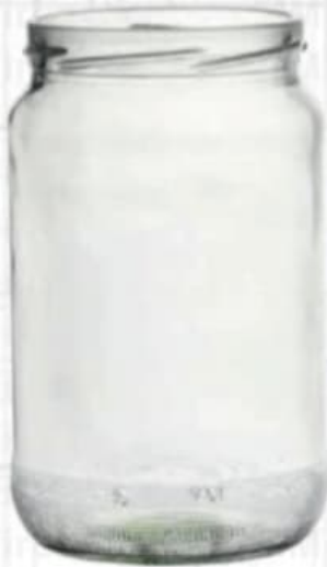
780 ML Round Jar

Height : 148 MM Cap : 82 MM Lug Cap Packing : 24 Pcs.