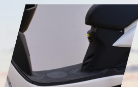
BIGGER FLOOR BOARD