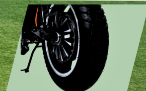
BIGGER REAR TIER