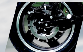
DUAL DISC BRAKES