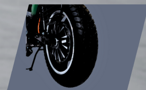
BIGGER REAR TIRE