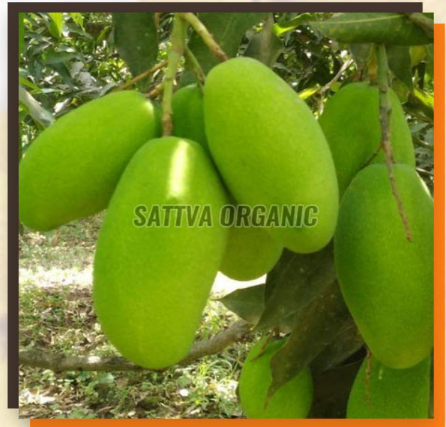
Fresh Dasheri Mango