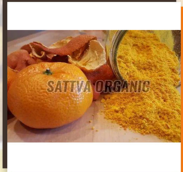
Orange Peel Powder