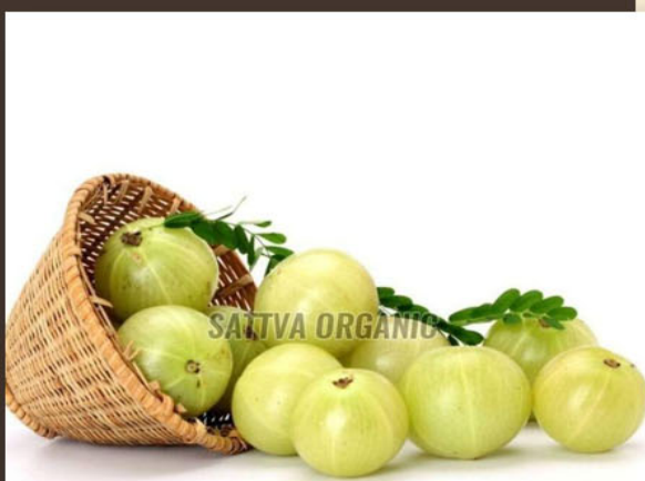
Fresh Indian Gooseberry