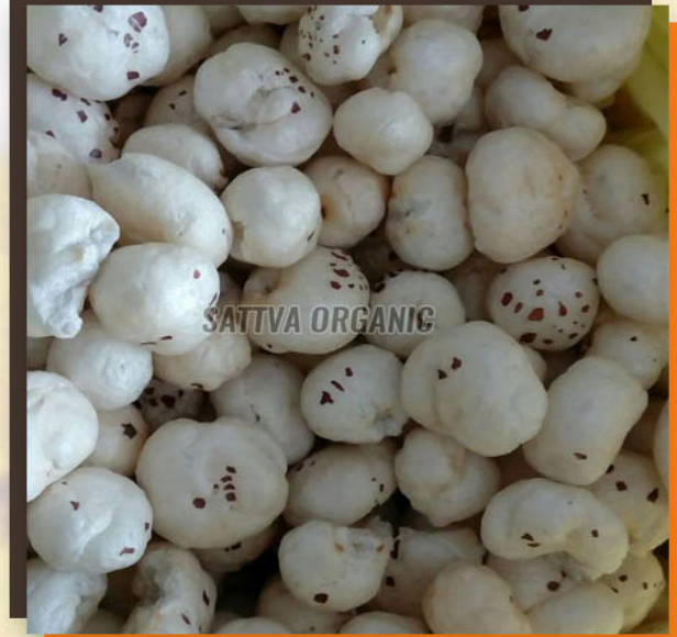
6 Sutta White Makhana