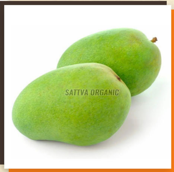
Fresh Banganapalli Mango