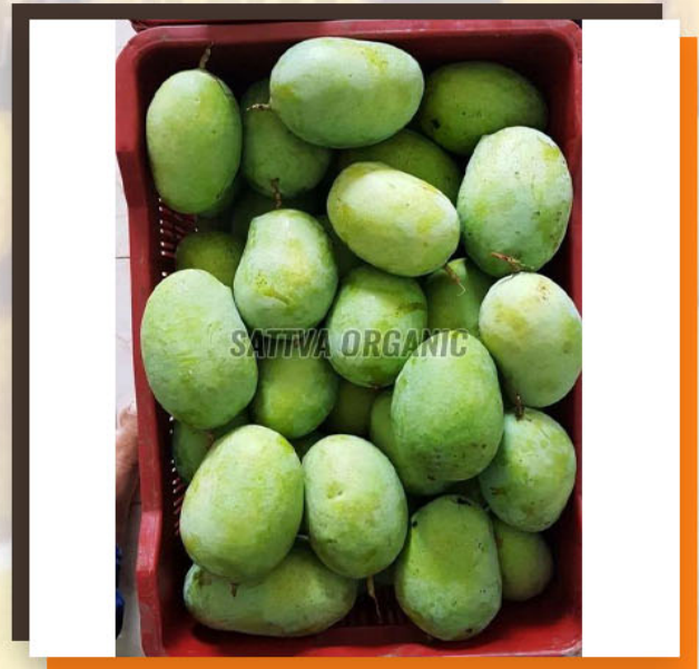
Fresh Langra Mango