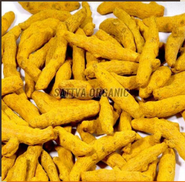
Dried Turmeric Finger