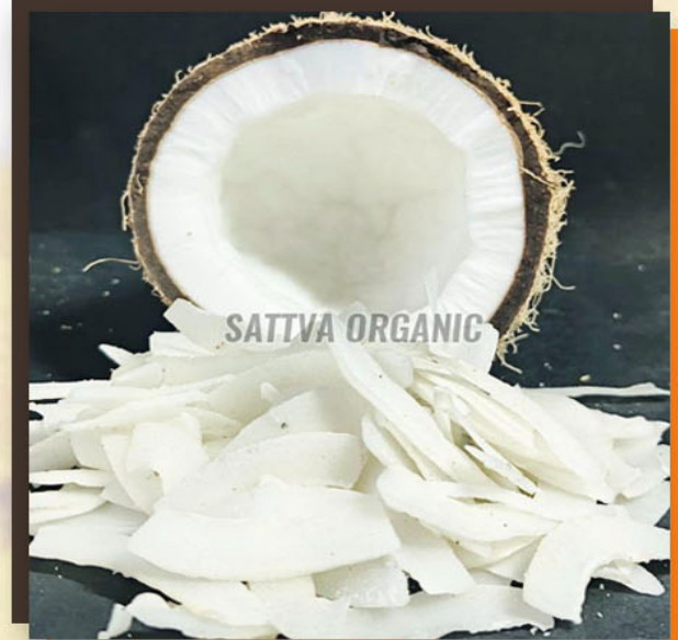
Fresh Coconut Chips