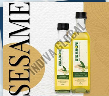
Kikaboni Cold Pressed Sesame Oil