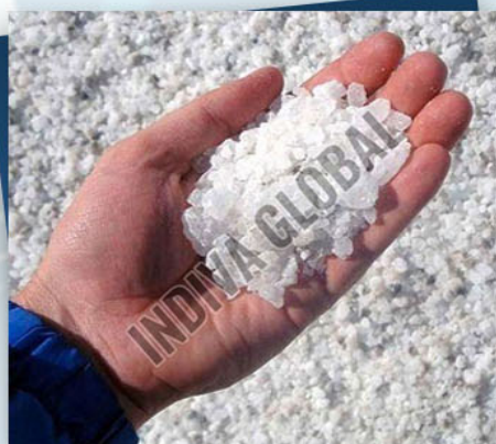
De Icing Salt