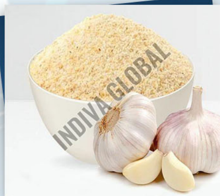
Dehydrated Garlic Powder