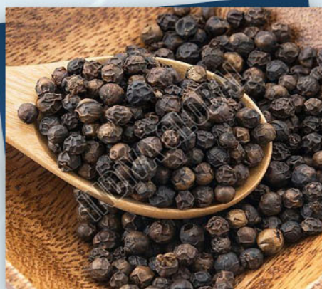
Black Pepper Seeds