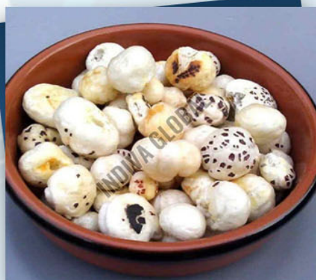
Grade 7 Suta Plus Raw Makhana