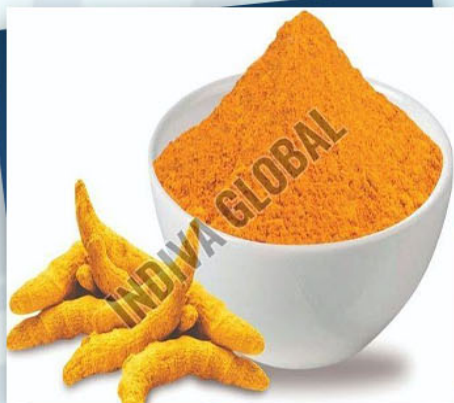
Dehydrated Turmeric Powder