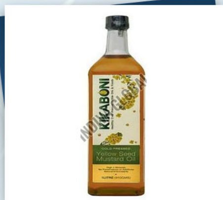
1 Litre Kikaboni Cold Pressed Mustard Oil