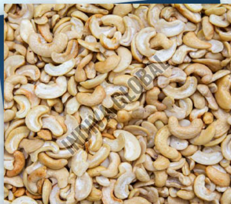
W320 Cashew Nuts