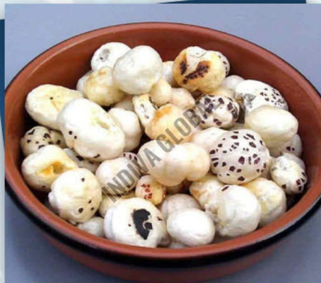
Grade 6 Suta Plus Raw Makhana