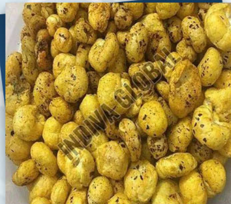
Salt Roasted Makhana