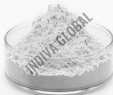
Potassium Chloride Powder