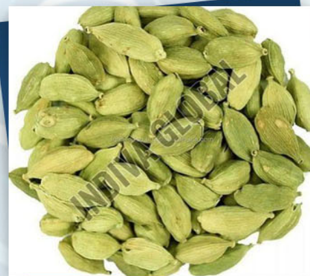
Green Cardamom Seeds