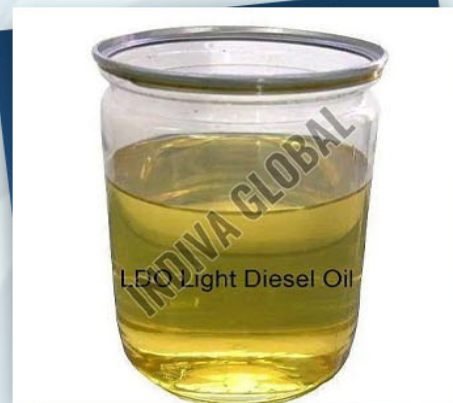
Light Diesel Oil