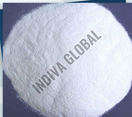
Sodium Chloride Powder