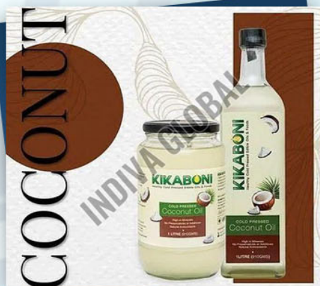
1 Litre Kikaboni Cold Pressed Coconut Oil