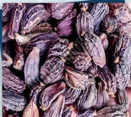
Purple Cardamom Seeds