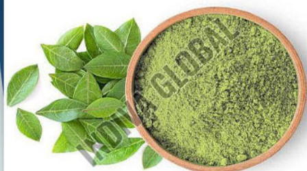
Herbal Henna Powder