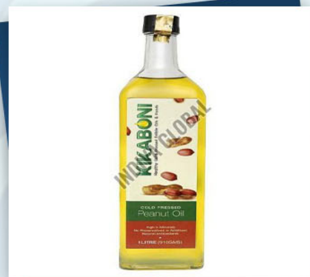
1 Litre Kikaboni Cold Pressed Peanut Oil