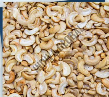
W180 Cashew Nuts