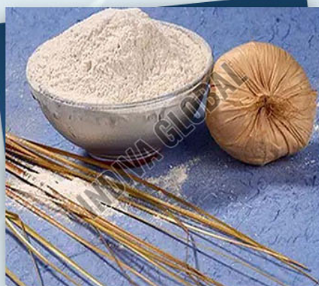
Dehydrated Onion Powder