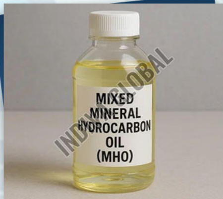
Mixed Mineral Hydrocarbon Oil