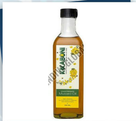
500 MI Kikaboni Cold Pressed Mustard Oil