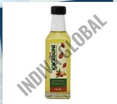
100 MI Kikaboni Cold Pressed Almond Oil