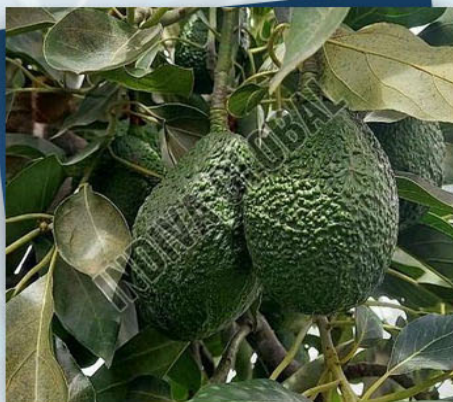
A Grade Hass Imported Tanzania Avocado