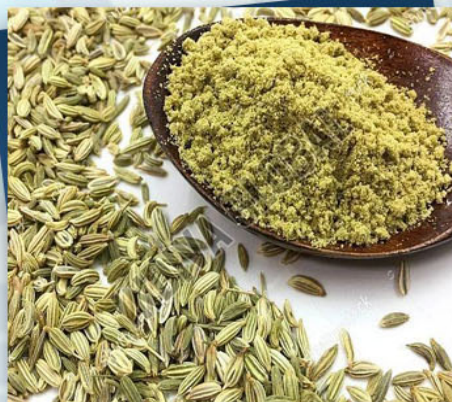
Fennel Seed Powder