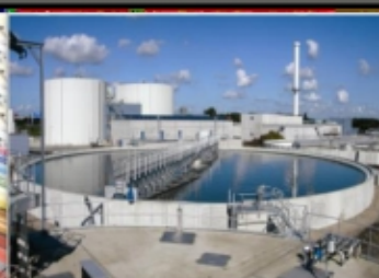
Water and Waste Water