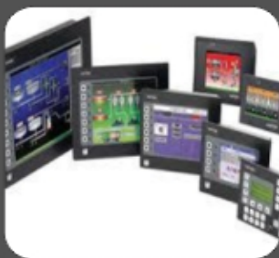
HMI Scada Systems