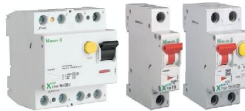
RCCBs, MCBs and Combined RCBOs