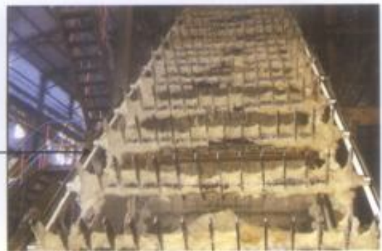
Bagasse Carrier with Polymer Runner