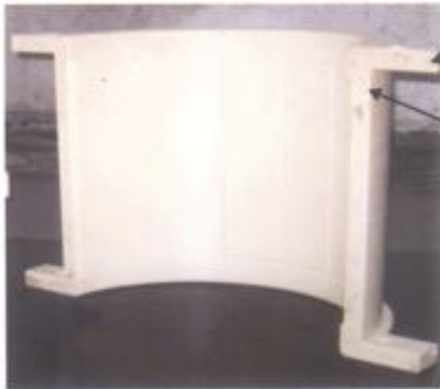
'Arihantron' Self-Lubricating Polymer wear plate for mill bearing housing.

the complete solution for replacement of Brass, Bronze, GM, & white metal bearing liner for top roller top half and bottom half of mill bearing.