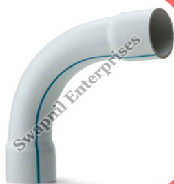
PVC Fabricated Bend Pipe