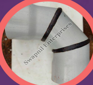
PVC Fabricated Miter Bend Pipe Without FRP