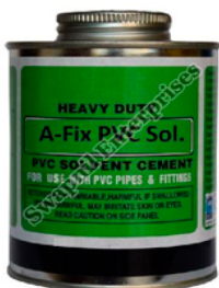
PVC Solvent Cements