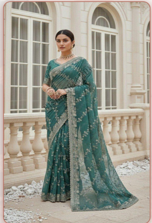
Lamena Embroidery Silk Saree