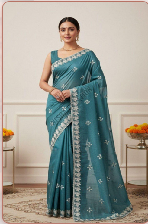
Peacock Blue Embroidery Silk Saree