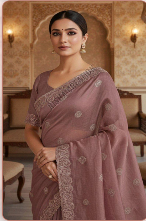
Burnished Brown Embroidery Silk Saree