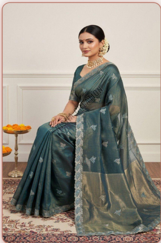
Fuscous Grey Embroidery Silk Saree