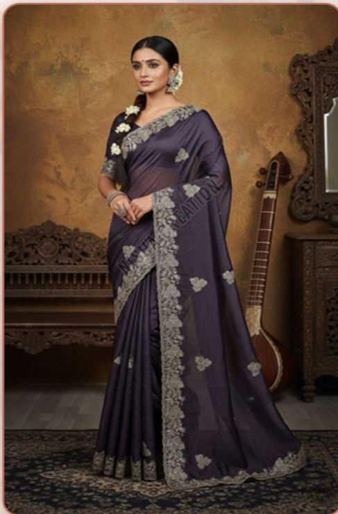
Black Coral Embroidery Silk Saree