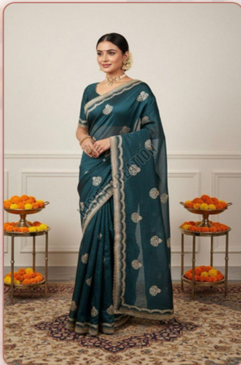
Embroidery Silk Saree