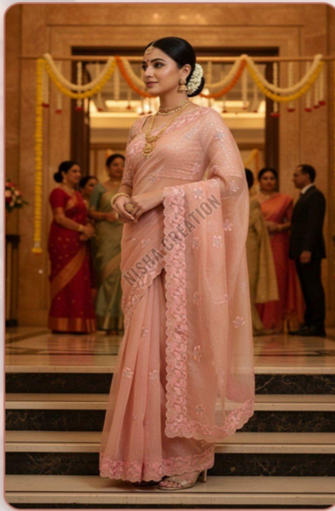
Antique Brass Color Embroidery Silk Saree