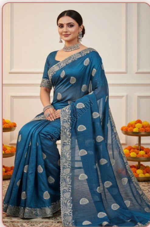
Beautiful Embroidery Silk Saree