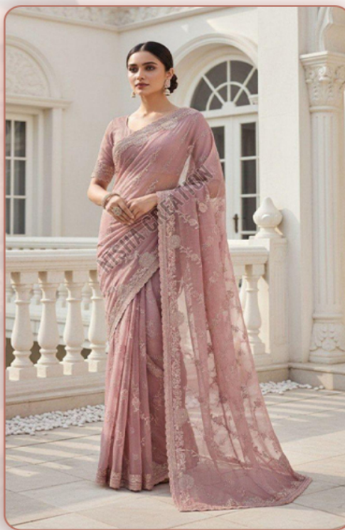
Light Pink Embroidery Silk Saree