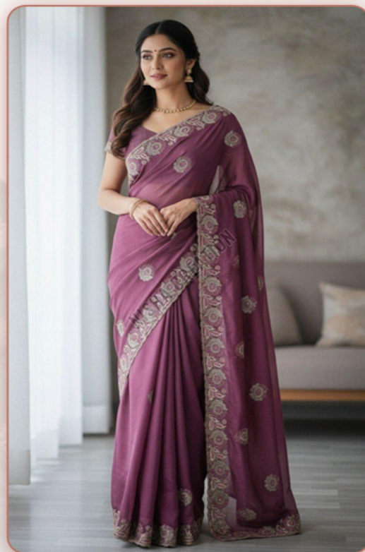
Mauve Embroidery Silk Saree