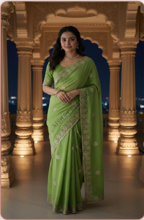
Light Green Embroidery Silk Saree