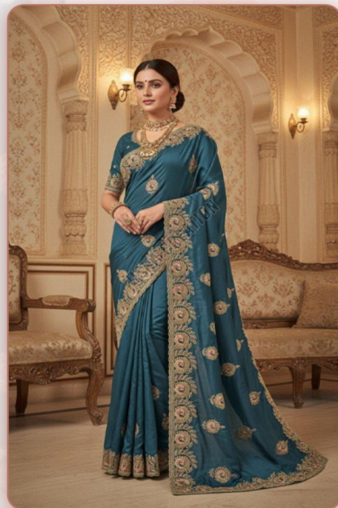
Rama Blue Embroidery Silk Saree