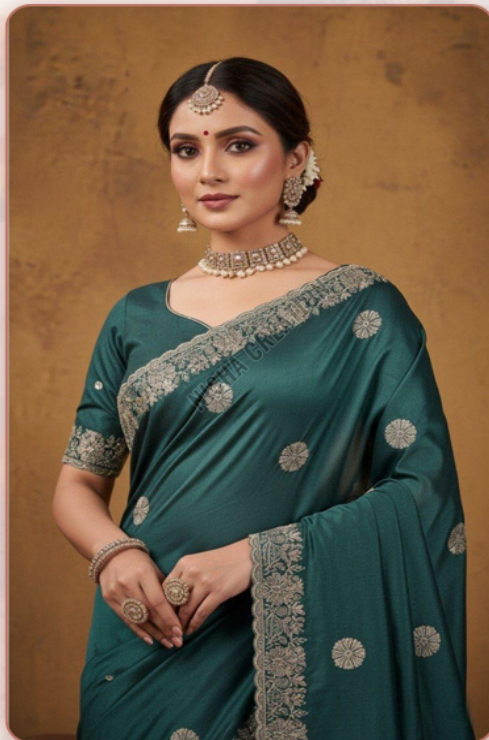
Dark Slate Grey Embroidery Silk Saree