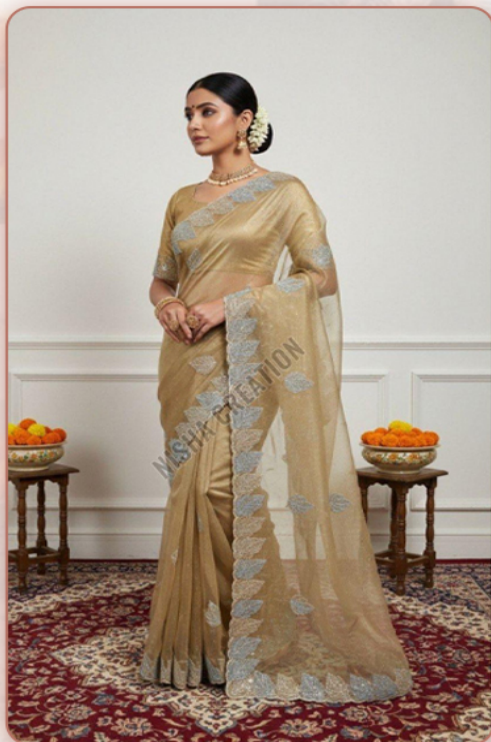
Party Wear Embroidery Silk Saree