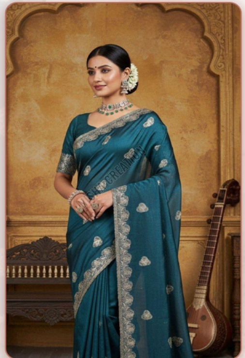
Teal Green Embroidery Silk Saree