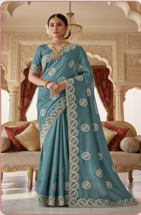
Sky Blue Embroidery Silk Saree