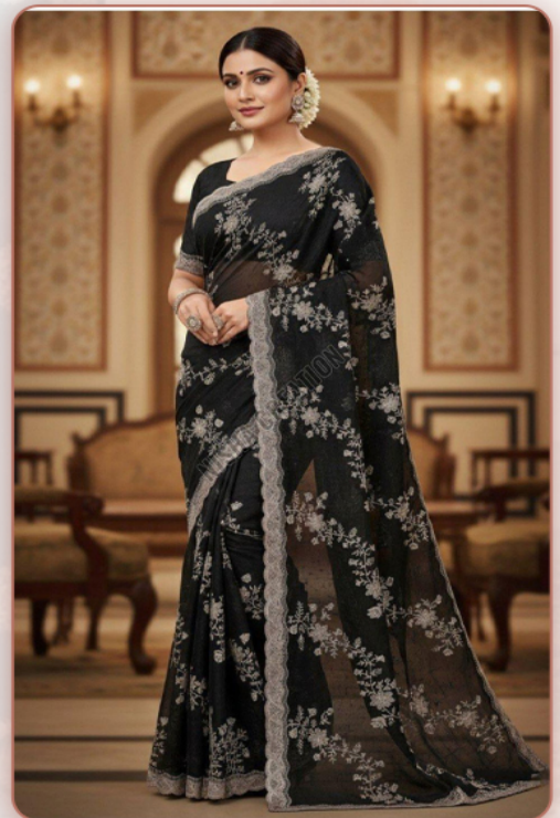
Black Embroidery Silk Saree