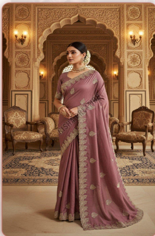
Rose Taupe Embroidery Silk Saree