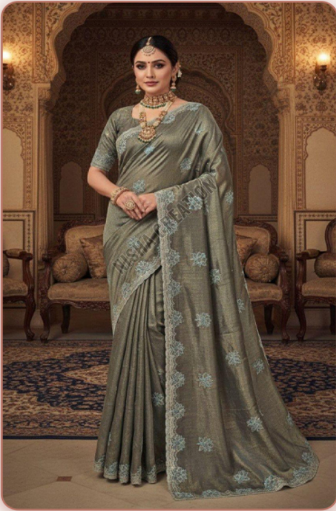
Black Olive Embroidery Silk Saree