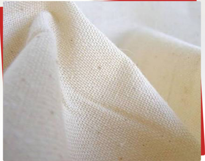
Greige Cotton Fabric