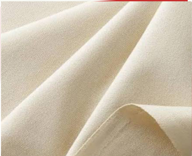
Plain Cotton Fabric