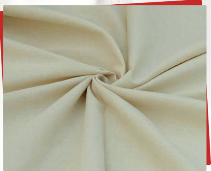
Interlock Polyester Fabric