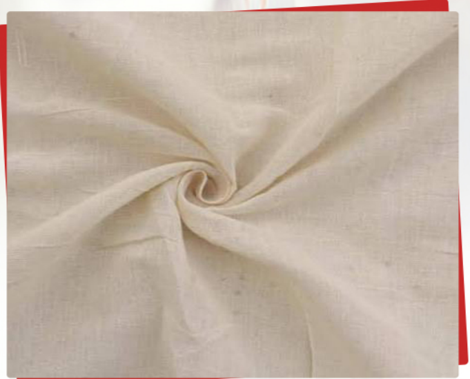
Twill Poplin Fabric