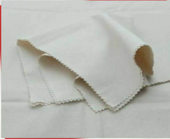
Soft Polyester Fabric