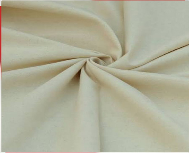
Drill Poplin Fabric