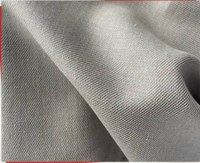
Printed Linen Fabric