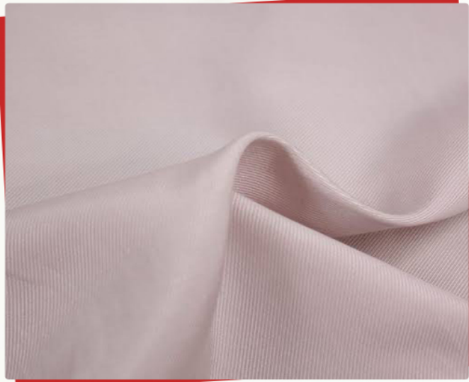
Plain Linen Fabric