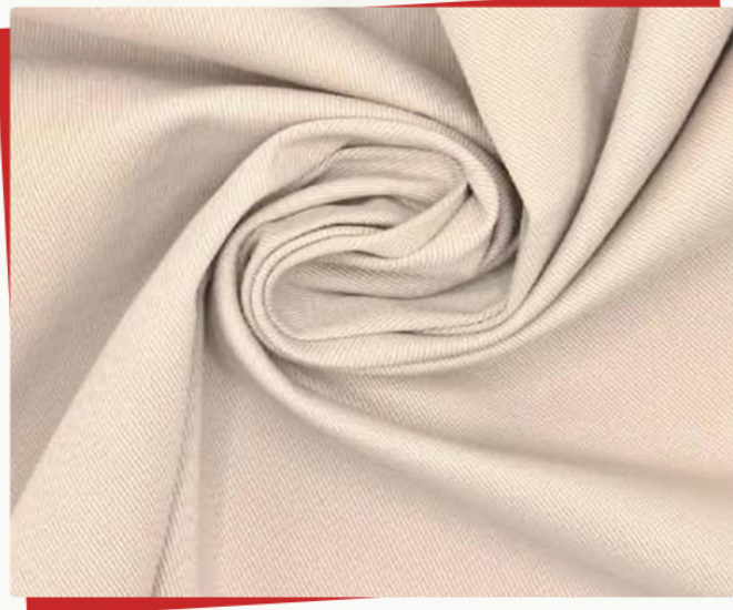
Micro Polyester Fabric