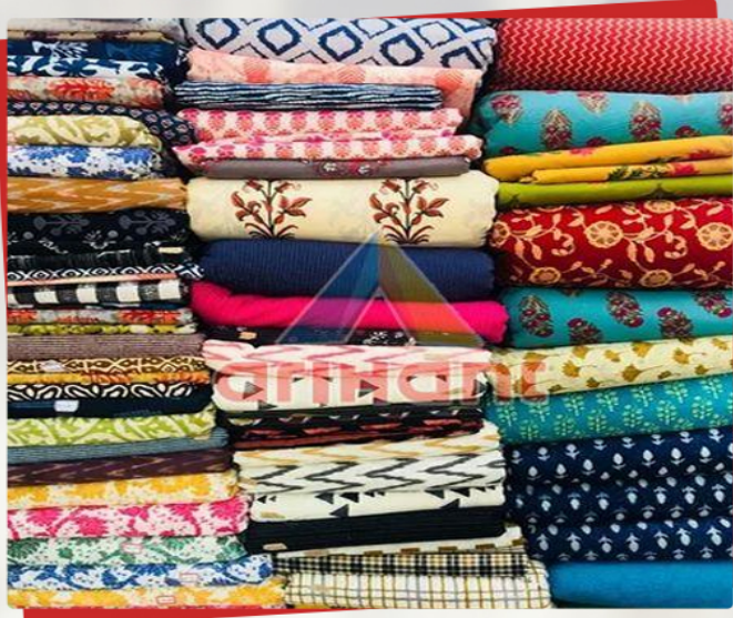
Printed Cotton Fabric