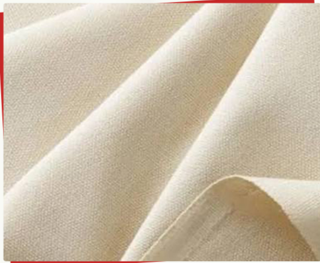
Woven Poplin Fabric