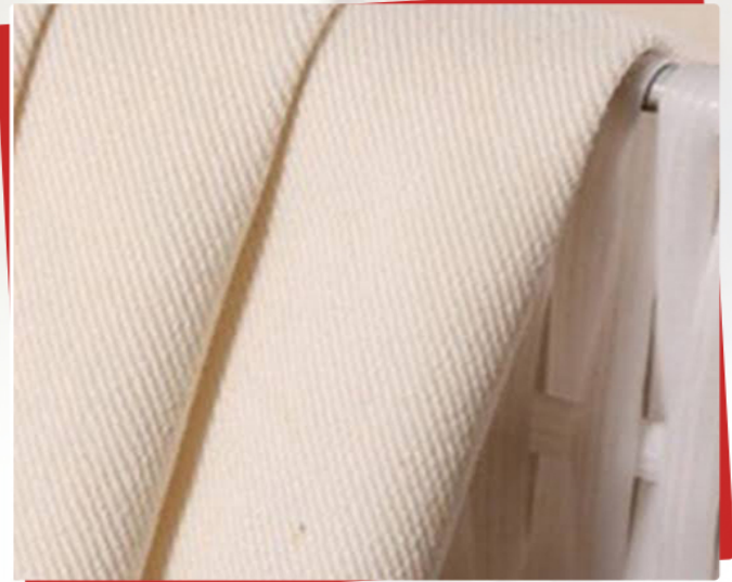
Striped Linen Fabric