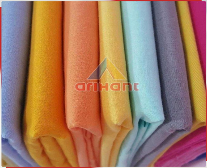
Dyed Cotton Fabric