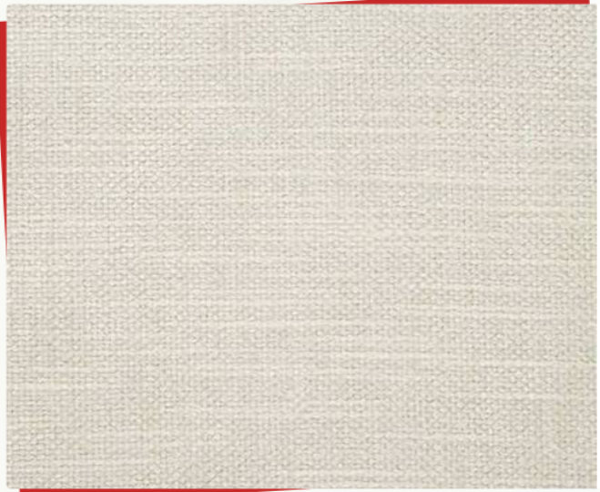
Dobby Poplin Fabric