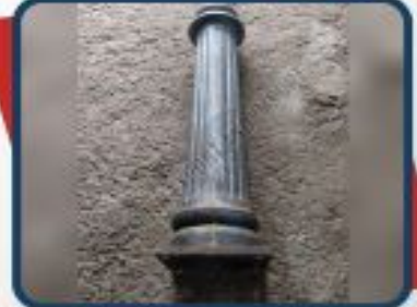
Cast Iron Architectural Columns