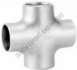
Cast Iron Equal Cross