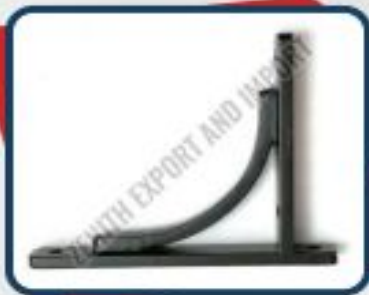
Cast Iron Structural Brackets