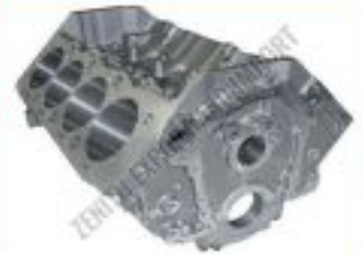
Cast Iron Engine Block