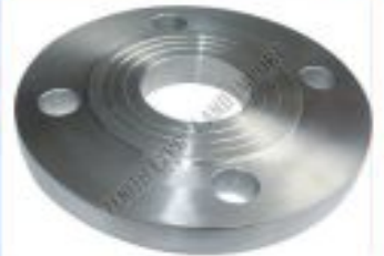
Cast Iron Slip On Flange