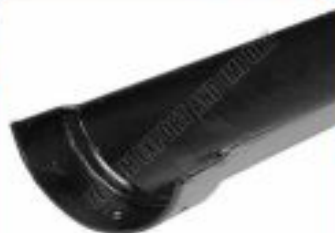
Cast Iron Gutter