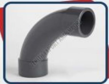
Cast Iron Long Radius Elbow