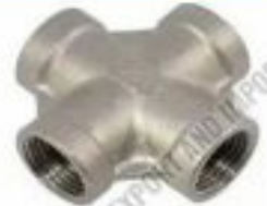
Cast Iron Reducing Cross