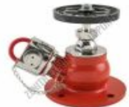
Cast Iron Hydrant