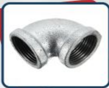
Cast Iron Standard Elbow