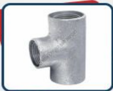
Cast Iron Reducing Tee