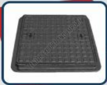
Cast Iron Manhole Cover