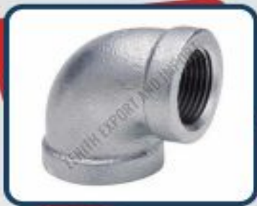
Cast Iron 90° Pipe Elbow