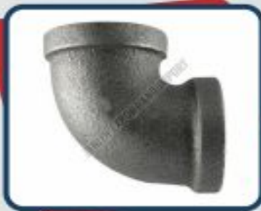
Cast Iron Elbow