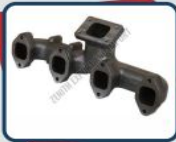
Cast Iron Manifold