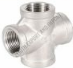
Cast Iron Threaded Cross