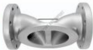
Cast Iron Valve Body