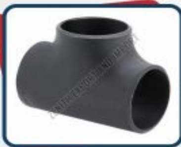
Cast Iron Butt Weld Tee