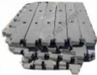
Cast Iron Counterweight