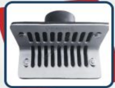
Cast Iron Scupper