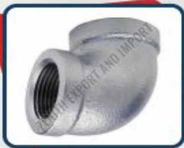
Cast Iron Short Radius Elbow