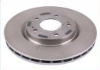
Cast Iron Brake Rotor