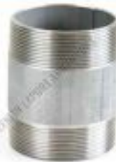
Cast Iron Threaded Nipple