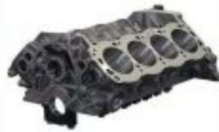
Cast Iron Cylinder Head