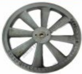
Cast Iron Flywheel