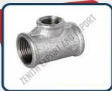
Cast Iron Threaded Tee