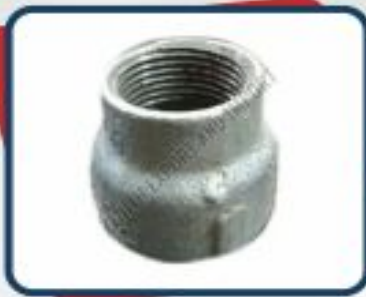
Cast Iron Threaded Reducer