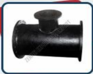
Cast Iron Branch Pipe Tee