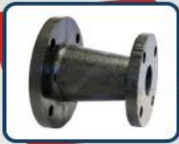
Cast Iron Concentric Reducer