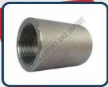
Cast Iron Extension Coupling