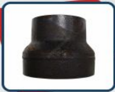
Cast Iron Pipe Reducer