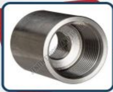
Cast Iron Pipe Coupling