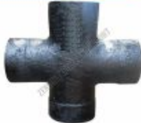
Cast Iron Pipe Cross Fitting