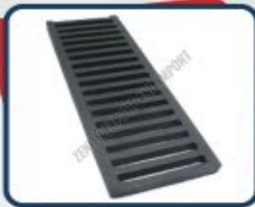
Cast Iron Trench Drain