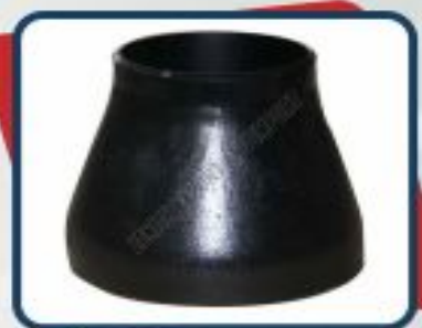
Cast Iron Butt Weld Reducer