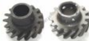
Cast Iron Gear Casing