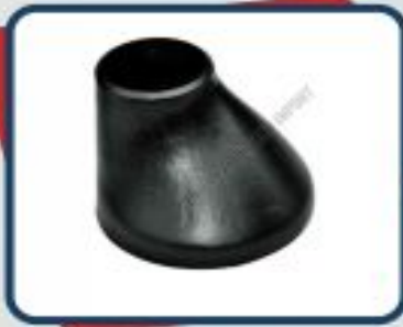
Cast Iron Eccentric Reducer