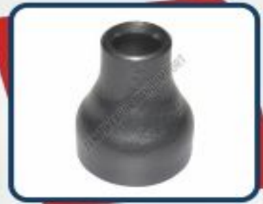
Cast Iron Pipe Diameter Reducer