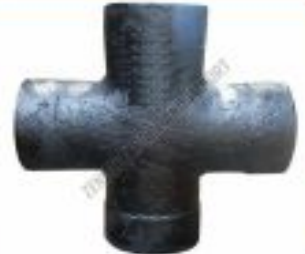
Cast Iron Conduit Cross