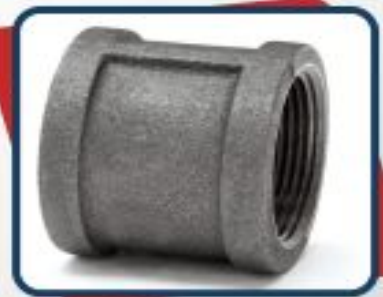
Cast Iron Threaded Coupling