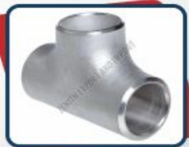
Cast Iron Equal Pipe Tee