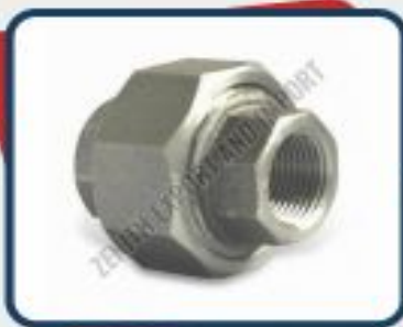
Cast Iron Threaded Union