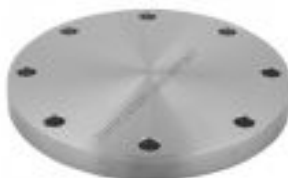
Cast Iron Blind Flange