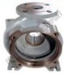
Cast Iron Pump Housing