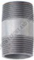
Cast Iron Short Nipple