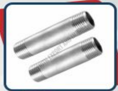
Cast Iron Pipe Nipple