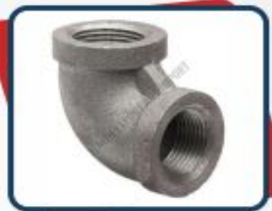
Cast Iron Threaded Pipe Elbow