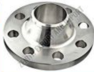
Cast Iron Weld Neck Flange