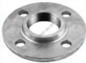
Cast Iron Threaded Flange