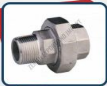
Cast Iron Pipe Union