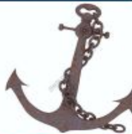
Cast Iron Anchor