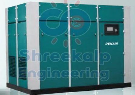
Oil Free Screw Compressor