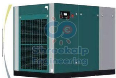
Two-stage Compression Pm Vsd Screw Compressors