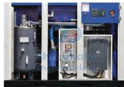
Vsd Oil Injected Rotary Screw Air Compressor