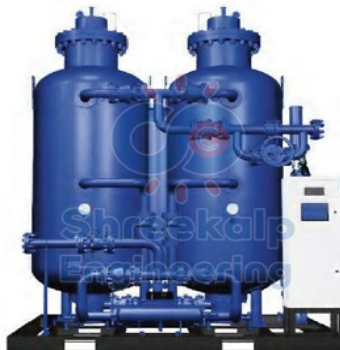
Psa Nitrogen Gas Generators