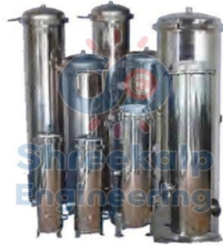
Stainless Steel Compressed Air Filters