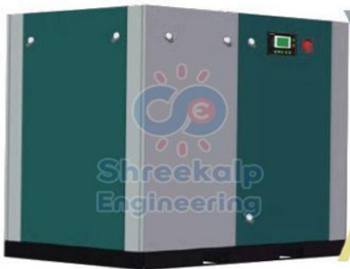
Oil lubricated Screw Air Compressors