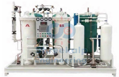
Psa Oxygen Generator