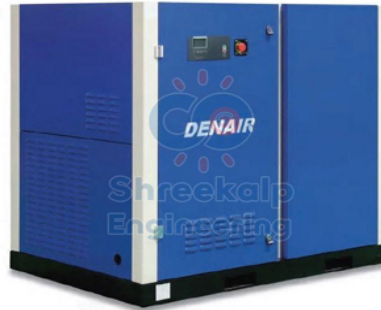
Pm Vsd Screw Air Compressor