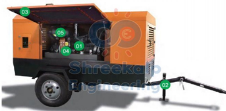
Portable Rotary Screw Air Compressors