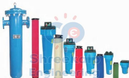
Compressed Air Filters