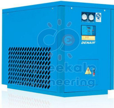
Compressed Air Dryer