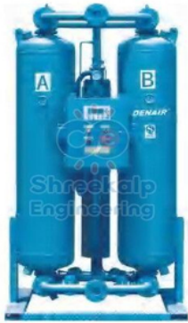
Desiccant Air Dryer