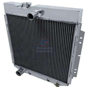
Compressor Oil Cooler