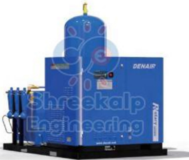
Laser Cutting Air Compressor