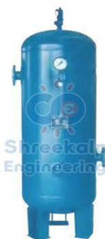
Air Receiver Tank