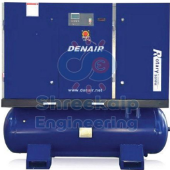
All In One Air Compressor System