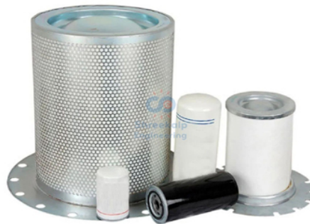
Air Compressor Oil Separator