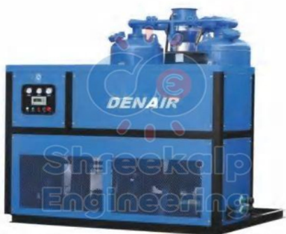
Combined Type Air Dryer