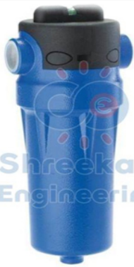
Air Compressor Line Filter