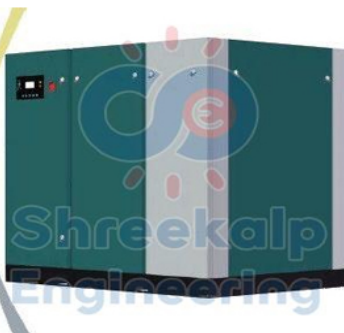
Permanent Magnetic Vsd Air Compressors