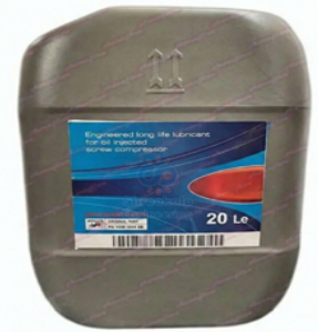
20L Air Compressor Oil