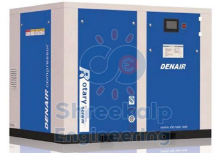
Oil Free Screw Air Compressor- Dry Screw