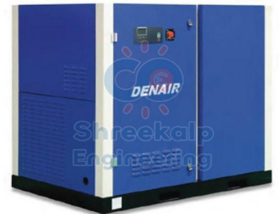
Rotary Screw Air Compressors