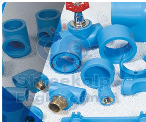
PPR Pipe System