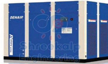
Low Pressure Rotary Screw Air Compressors