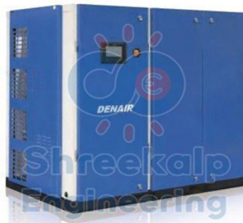
Oil Free Scroll Air Compressor