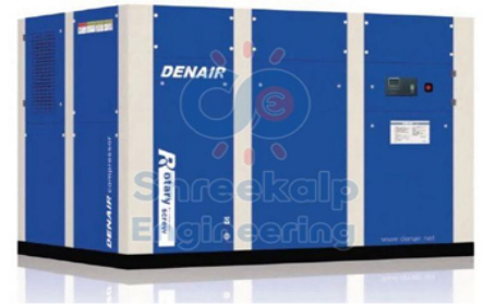
Vsd High Pressure Rotary Screw Compressor