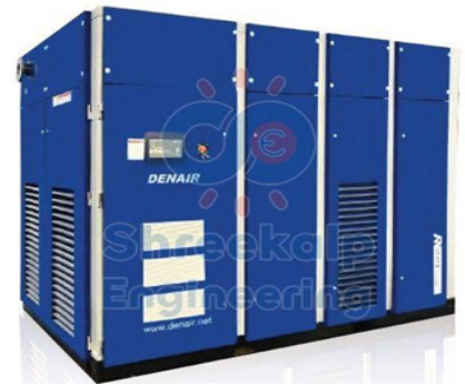
Pm Vsd Two-stage Screw Air Compressor