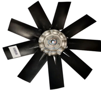
Air Cooling Fan Impeller