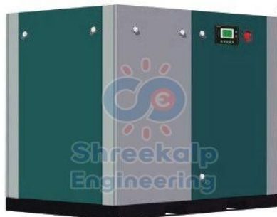
Two-stage Compression Screw Air Compressors