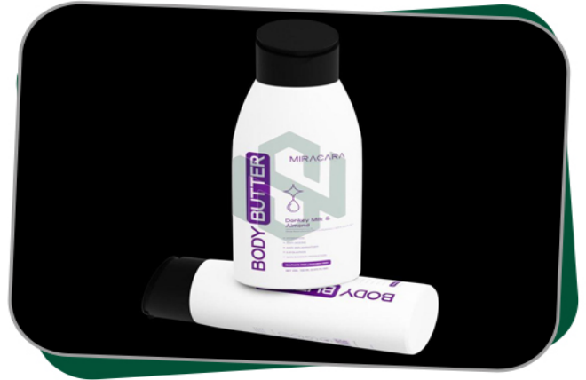
MIRACARA DONKEY MILK BODY BUTTER