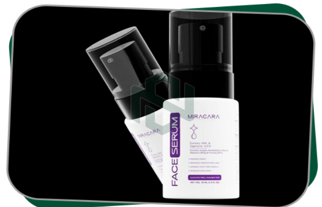
MIRACARA DONKEY MILK FACE SERUM