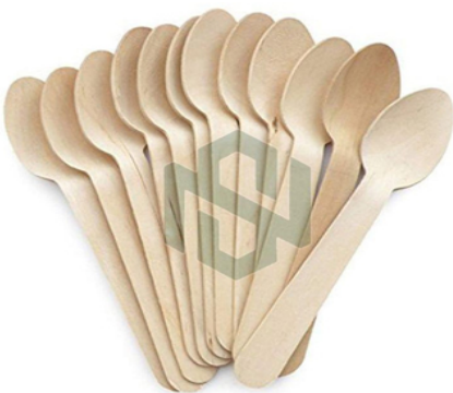
BAMBOO DISPOSABLE SPOON