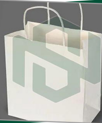
PLAIN PAPER BAG