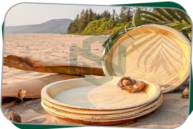
12 INCH ROUND ARECA LEAF PLATE