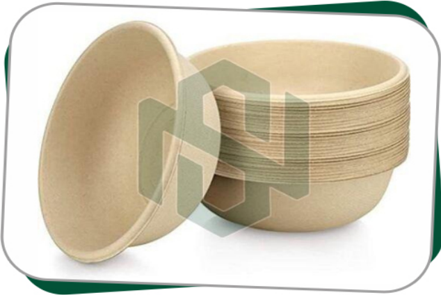
BAMBOO DISPOSABLE BOWL