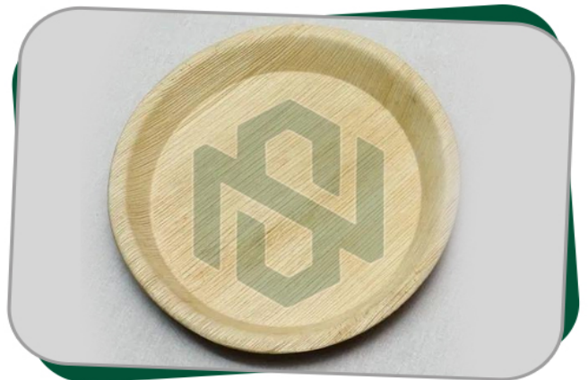
6 INCH ROUND ARECA LEAF PLATE