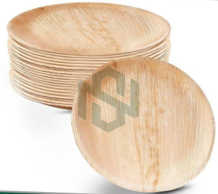
ROUND BAMBOO PLATE