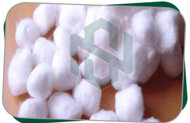
WHITE COTTON BALLS