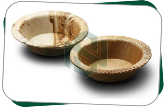
ROUND ARECA LEAF BOWL