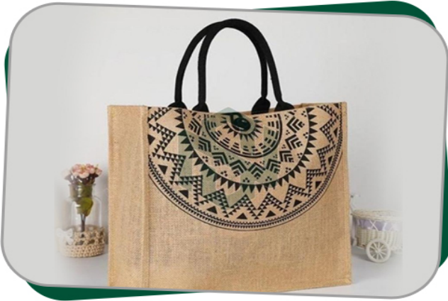
PRINTED JUTE BAG