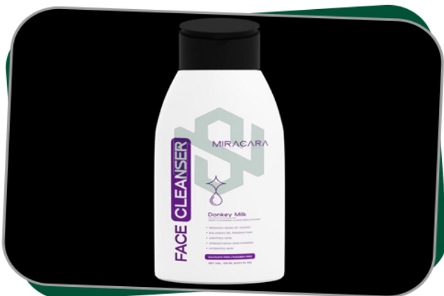
MIRACARA DONKEY MILK FACE CLEANSER