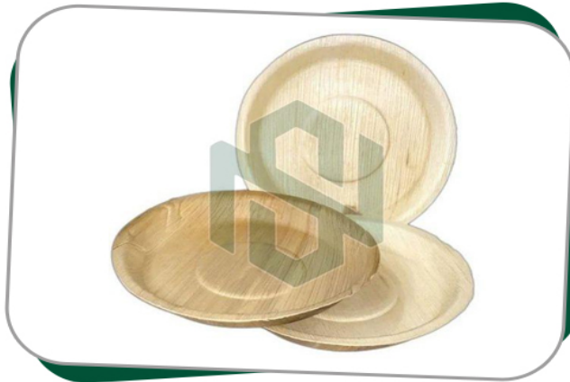
10 INCH ROUND ARECA LEAF PLATE