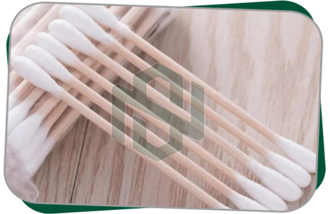
COTTON EAR BUDS