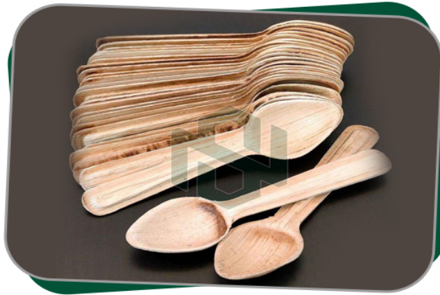
ARECA LEAF SPOON