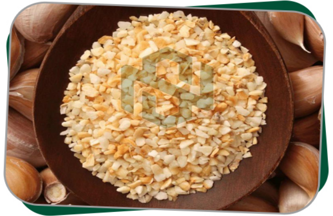
DEHYDRATED GARLIC MINCED