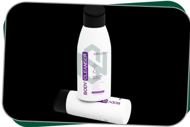
MIRACARA DONKEY MILK BODY CLEANSER