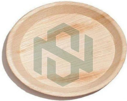
7 INCH ROUND ARECA LEAF PLATE