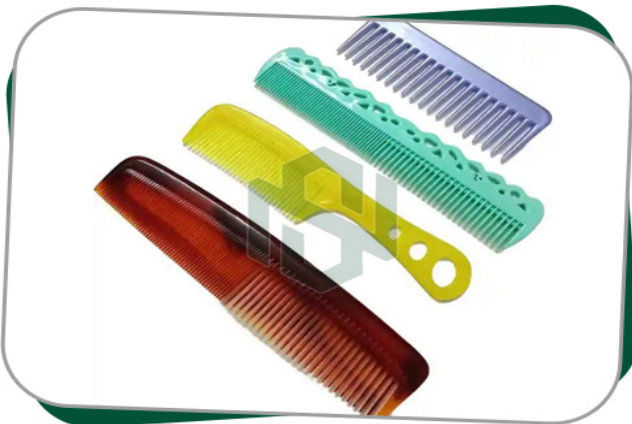
HIGH QUALITY PLASTIC COMB