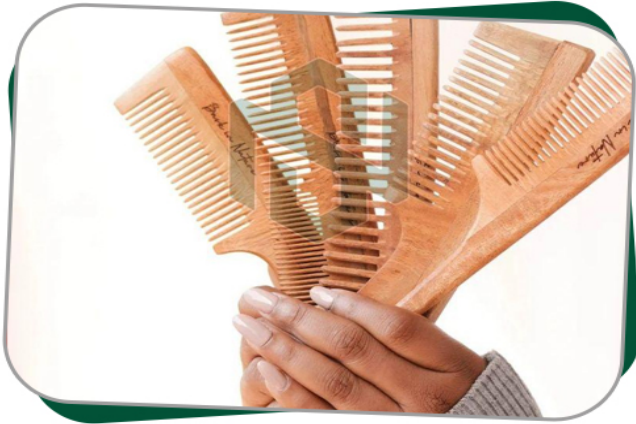
WOODEN HAIR COMB