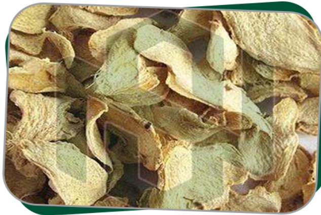
DEHYDRATED GINGER FLAKES