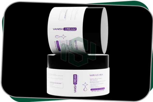
MIRACARA DONKEY MILK VANISH CREAM