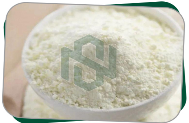
DONKEY MILK POWDER