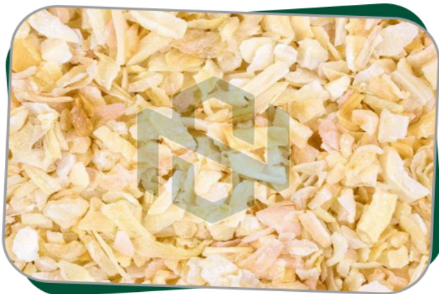
DEHYDRATED WHITE ONION MINCED