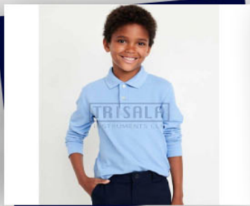
Long Sleeve Polo Shirt Old Navy School T Shirt