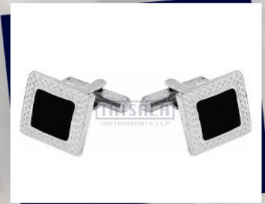
Men Adjustable Metal Office Cufflink