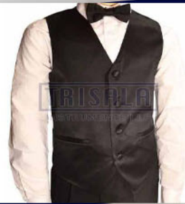
Formal Men'S Restaurant Service Waistcoat