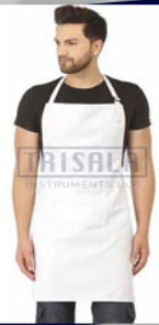
Modern Unisex Polyester Kitchen Apron