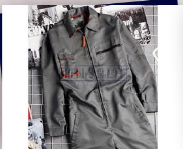
High Quality Coveralls