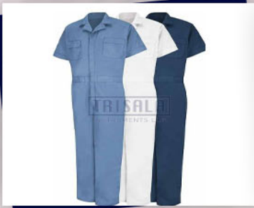
Lightweight Women Industrial Work Tunic