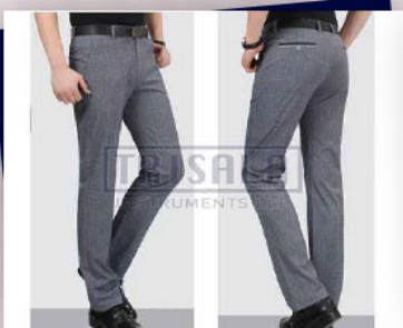
Premium Men Regular Fit Office Trousers