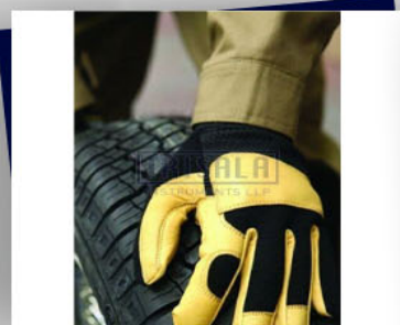
High Quality Genuine Leather Gloves