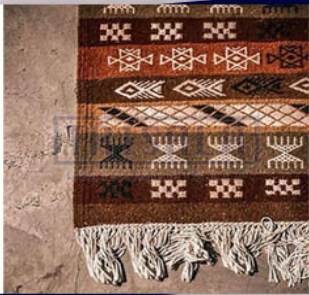
High Quality Woolen Dhurries