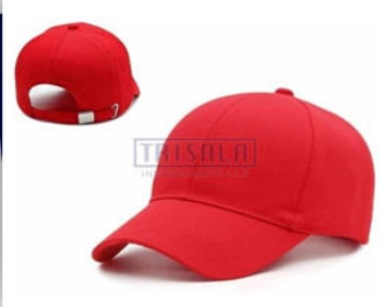
Boys Classic Cotton School Cap