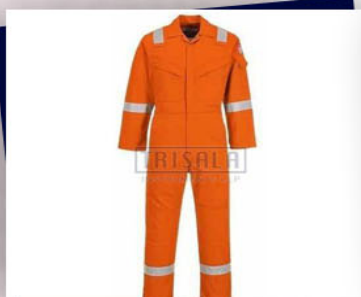
Flame Resistant Women Work Safety Coverall