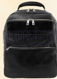
Leather Laptop Bags