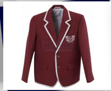
Elegant Girls Tailored School Blazer