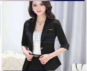
Elegant Women'S Hotel Front Office Blazer