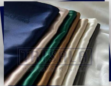
Luxurious Silk Fabric