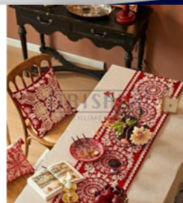
Premium Table Mat