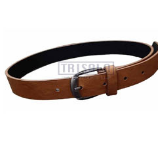
Boys Adjustable Leather School Belt