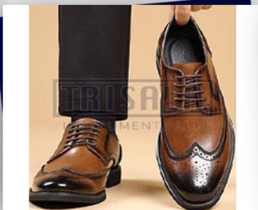
Genuine Men Leather Shoes