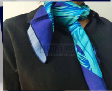
Women Stylish Polyester Office Stole