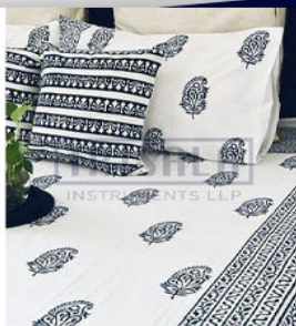
Premium Soft and Durable Bed Sheet