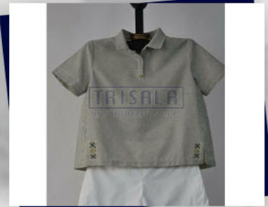
Comfortable Kids Clothes