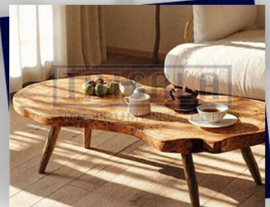
Premium Timber Wood Table