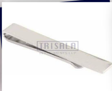
Men Modern Stainless Steel Tie Pin