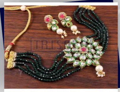
Women Party Wear Crystal Choker Necklace Set