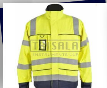
Flame Retardant Men Industrial Safety Jacket