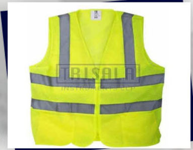
Reflective Striped Unisex Industrial Safety Vest