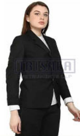
Classic Women Black Waitress Blazer