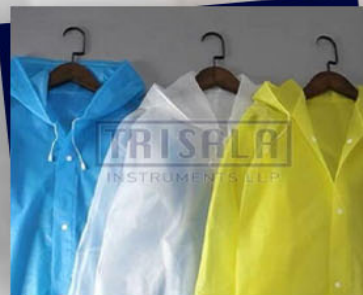
Durable Waterproof Raincoat