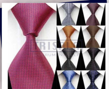
Premium Unisex Formal Corporate Tie