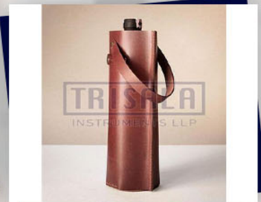
Durable Wine Carry Bag