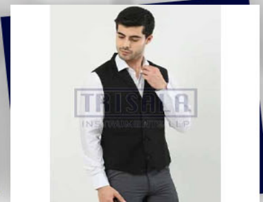
Modern Men Formal Office Waistcoat