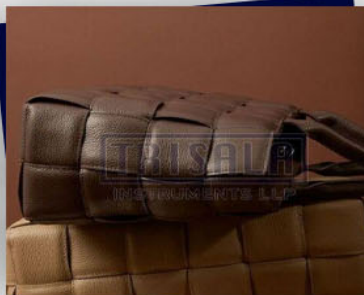
Premium Genuine Ladies Leather Bags