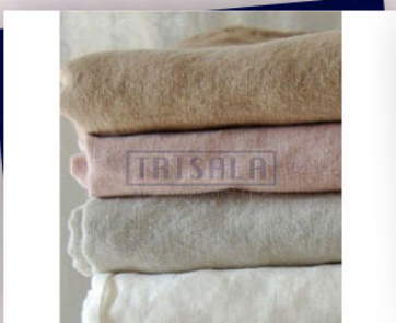
High Quality Cotton Fabric