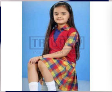
Checked Girls Regular Fit School Dress