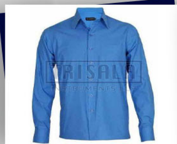
Striped Men Long Sleeve Office Shirt