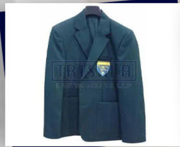
Plain Boys Cotton School Blazer