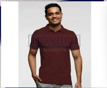
Classic Men Half Sleeve Polo T Shirt