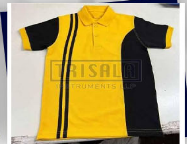
Striped Boys Half Sleeve School Polo T Shirt