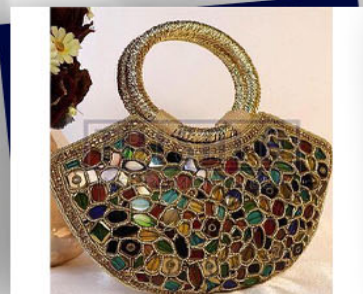
Handcrafted Stone Hand Bag