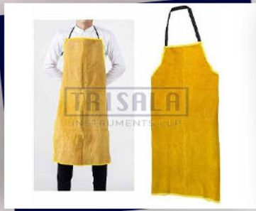
Protective Unisex Industrial Welding Apron