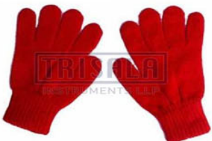
Boys Solid Cotton School Glove