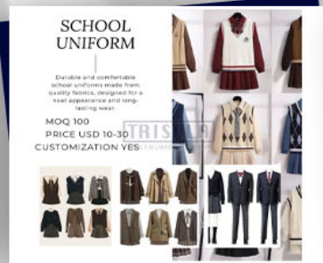
Striped Boys Full Sleeve School Sweater