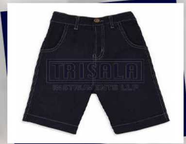
Solid Boys Adjustable Waist School Short