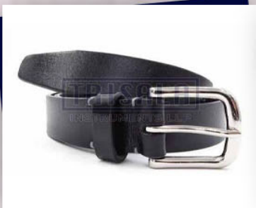
Men Classic Leather Formal Belt