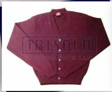
Classic Girls Buttoned School Cardigan