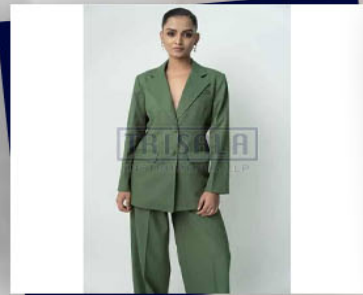
Classic Women Two Piece Office Suit