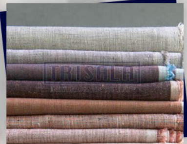
Premium Linen Fabric