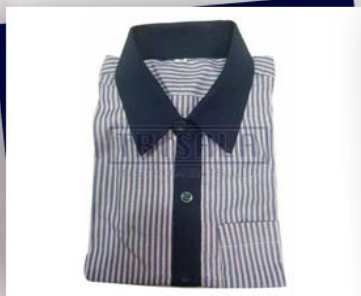
Striped Boys Cotton School Shirt