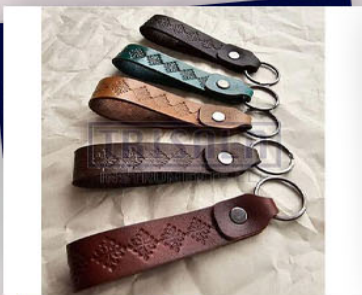
Durable Genuine Leather Key Chain