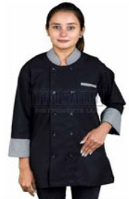
Elegant Women'S Double Breasted Chef Coat