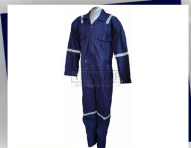
Heavy Duty Men Cotton Boiler Suit