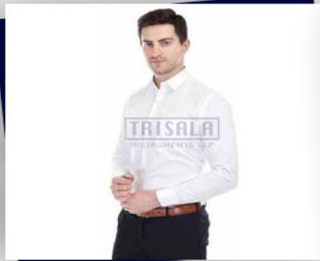
Classic Men Slim Fit Office Shirt