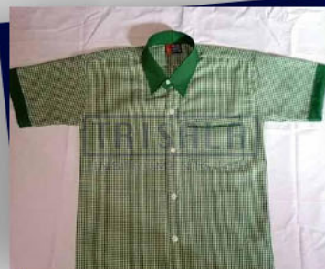
Checked Boys Regular Fit School Shirt