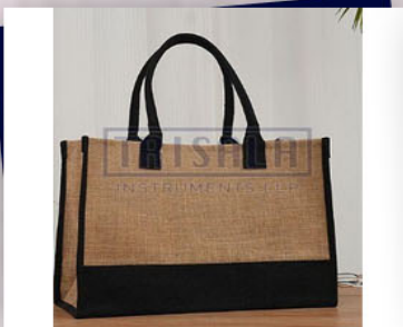
Eco Friendly Jute Bag