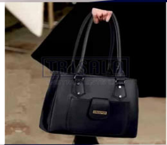
Women Premium Leather Office Handbag