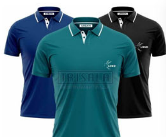
Classic Men'S Slim Fit Chef Coat