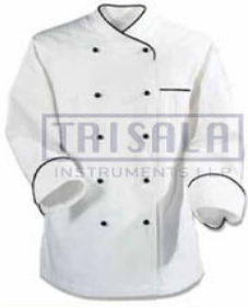
Classic Men'S Slim Fit Chef Coat