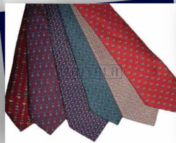
Men Premium Silk Office Tie