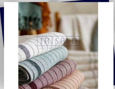
High Quality Absorbent Towels