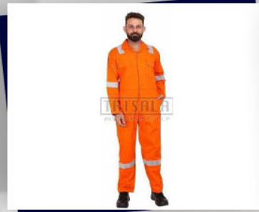
Reflective Striped Unisex Industrial Bib Overall