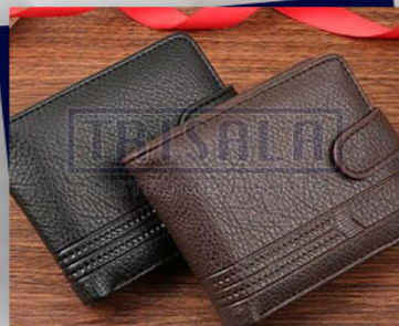
Premium Leather Wallet