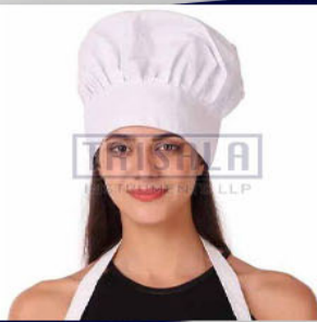
Female Breathable Kitchen Staff Cap