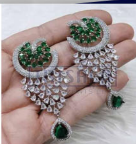
Women Designer American Artificial Earring