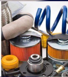
Jcb Spare Parts