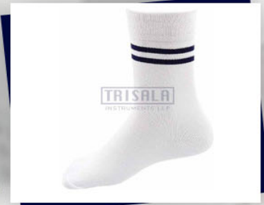
Girls Comfortable Polyester School Sock