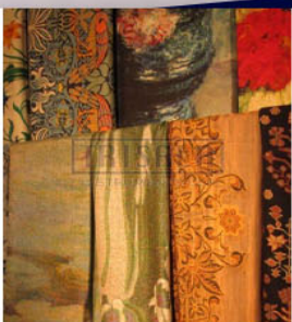
Printed Silk Scarve