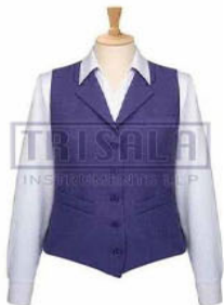
Modern Women'S Restaurant Service Waistcoat