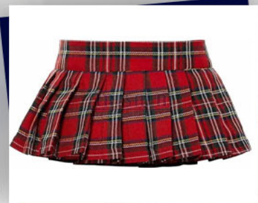
Checked Girls Box Pleat School Skirt