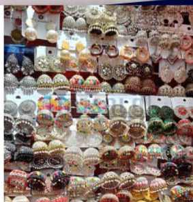
Artificial Designer Jewellery