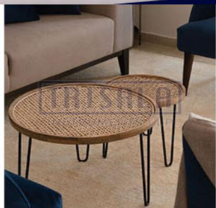
Premium Accent Table