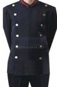
Classic Men'S Tailored Hotel Bellboy Coat