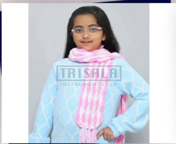
Girls Premium Wool School Scarf