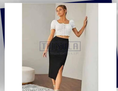
Stylish Women's Corporate Pencil Skirt