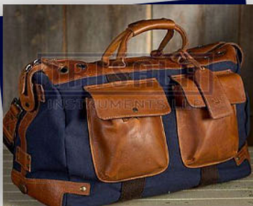
Durable Luggage Trolley Bag