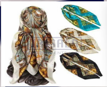
Women Elegant Satin Neck Scarf