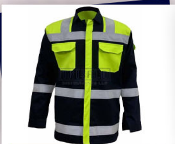
Classic Men Industrial Safety Work Coat