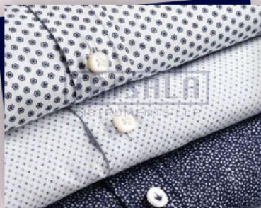
Premium Printed Men Shirt