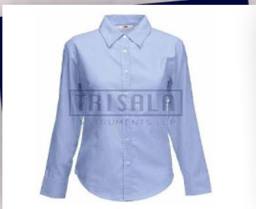
Solid Girls Full Sleeve School Shirt