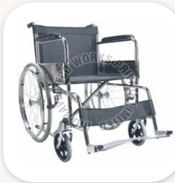
Folding Wheel Chair