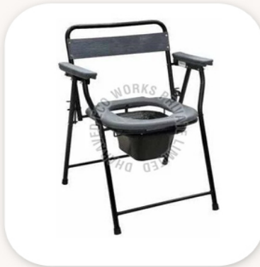
Patient Black Commode Chair