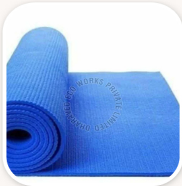
4mm Rubber Yoga Mat