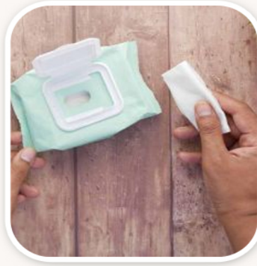
Baby Wet Wipe