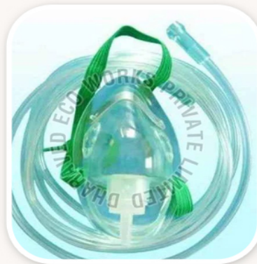
Adult Oxygen Mask