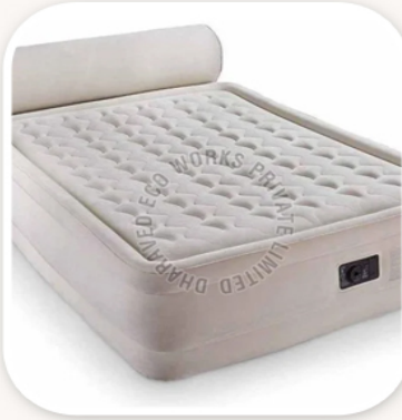
Air Bed Mattress