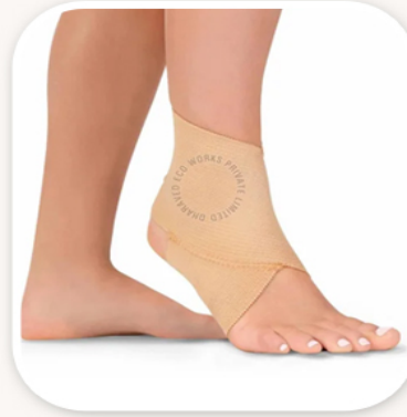
Elastic Ankle Support