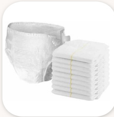
Standard Pant Cotton Adult Diaper