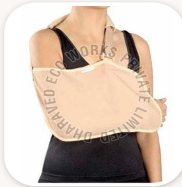
Elastic Pouch Arm Sling