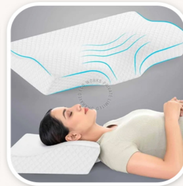
Contoured Memory Foam Pillow