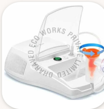
Adult Nebulizer Machine