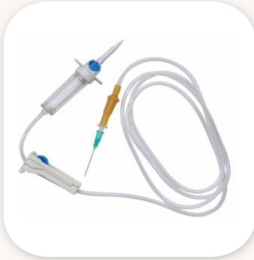
Disposable Infusion Set