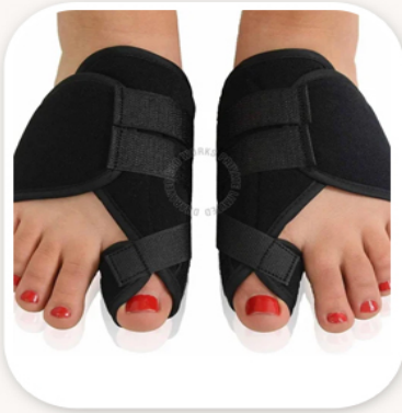
Double Stitched Bunion Splint