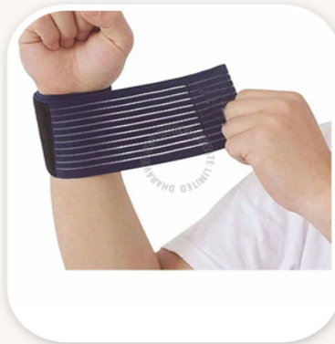
Elastic Wrist Wrap