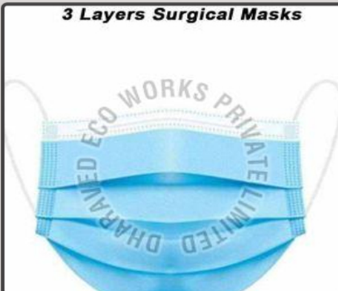
3 Layers Surgical Masks