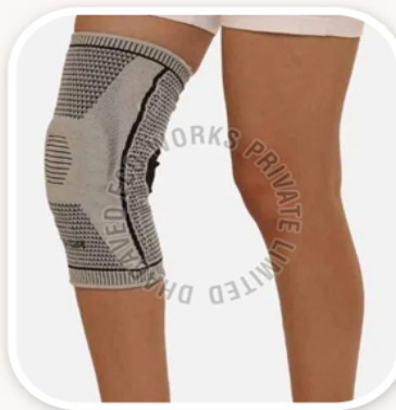
Compression Knee Support with Gel Pad