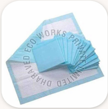
Adult Underpad Sheet