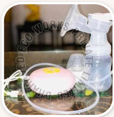
Electric Breast Pump