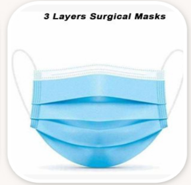
3 Layer Surgical Face Mask