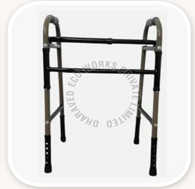
Basic Single Bar Walker