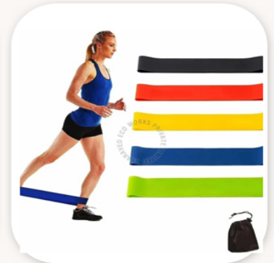
Active Exercise Band