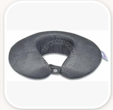
Travel Neck Pillow