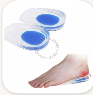
Silicon Heel Protector