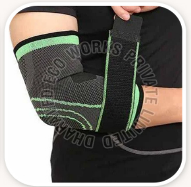
Elbow Sleeve with Strap