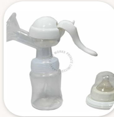
Manual Breast Pump