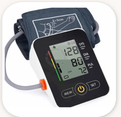
Blood Pressure Monitor