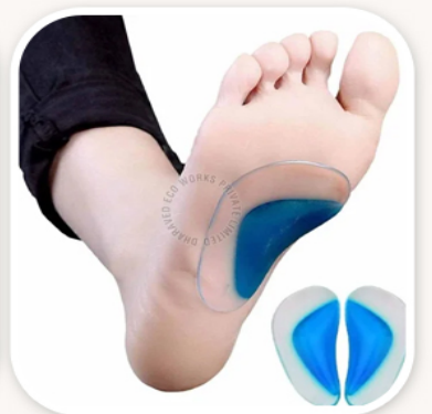
Gel Medical Arch Support