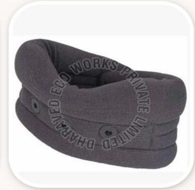
Elastic Cervical Collar