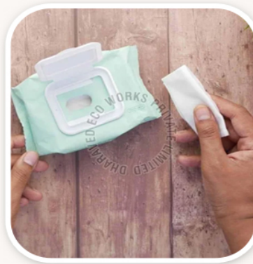
Baby Wet Wipe