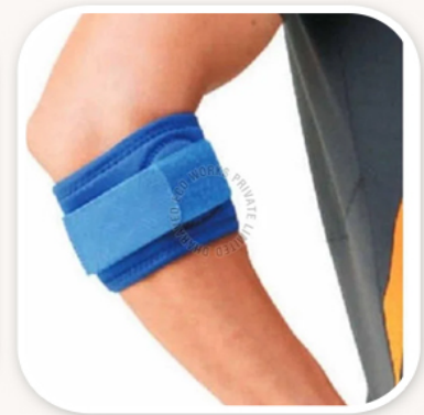
Elastic Tennis Elbow Support