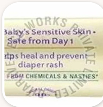
Himalaya Baby Rash Relief Cream