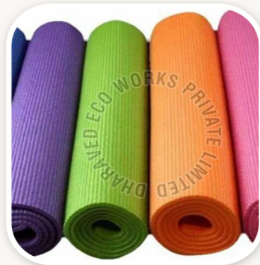
8mm Rubber Yoga Mat