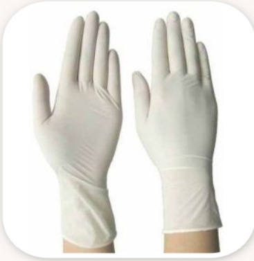
Sterile Surgical Glove