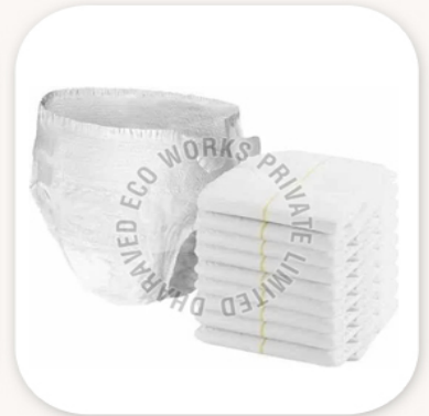
Premium Pant Cotton Adult Diaper