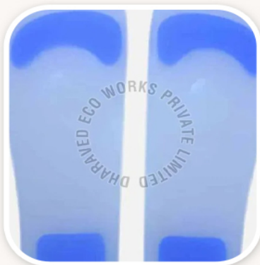
Blue Silicone Insole Plain