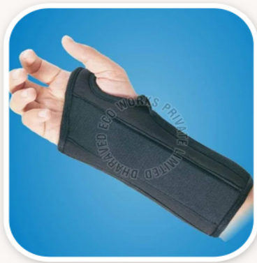
Elastic Wrist Brace