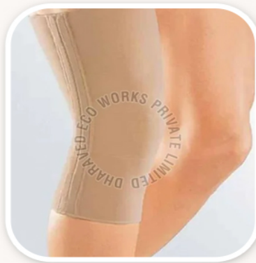
Elastic Knee Support