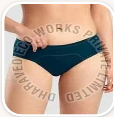
Cotton Period Panty