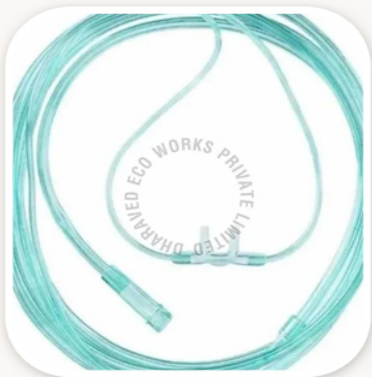
Adult Nasal Oxygen Cannula