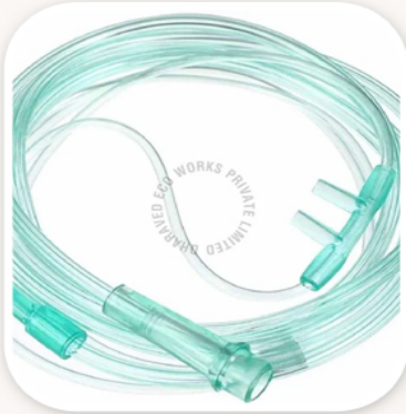
Child Nasal Oxygen Cannula