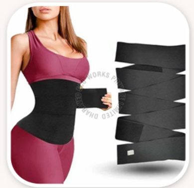
Abdomen Reshaping Belt