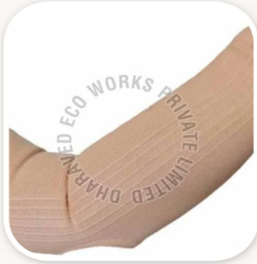
Cotton Elbow Sleeve