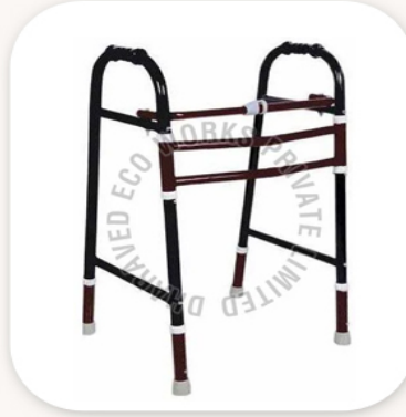
Basic Double Bar Walker