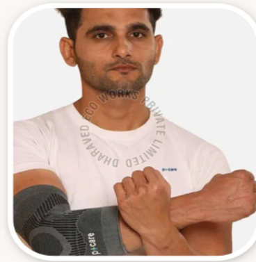
Elbow Sleeve with Pad