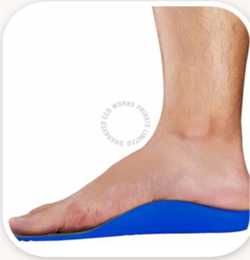
Silicon Full Insole with Arch Support