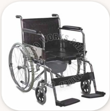
Commode Folding Wheelchair