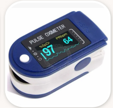
Fingertip Pulse Oximeter