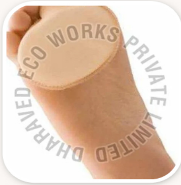
Gel Metatarsal Pad