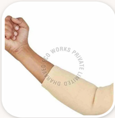
Elastic Elbow Support