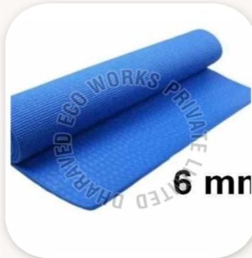
6mm Rubber Yoga Mat