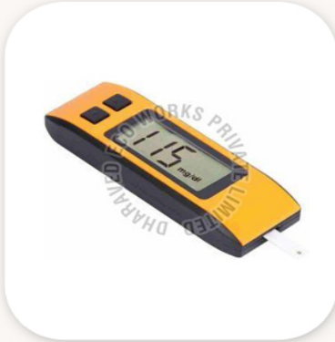
Blood Sugar Test Kit