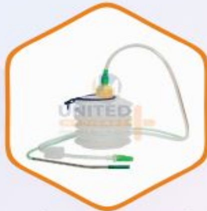
Closed Wound Suction Unit