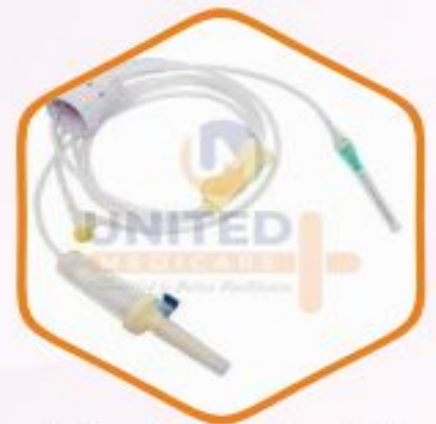
Infusion Set with Dial Flow Regulator