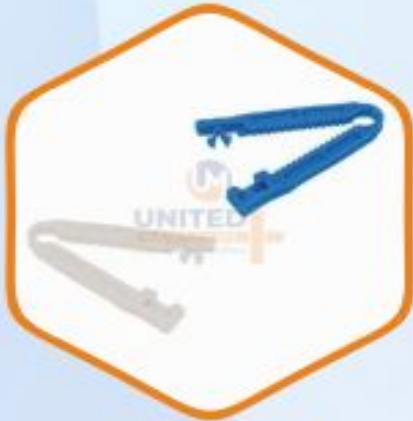
Umbilical Cord Clamp