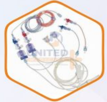
Double Pressure Monitoring Line