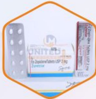
Zunestar 2 Mg Tablets