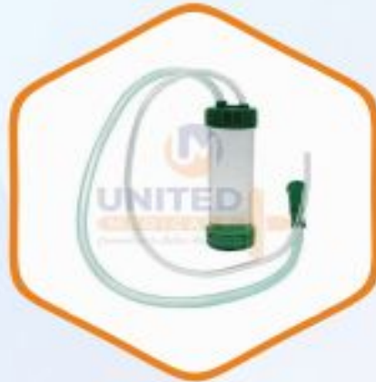
Infant Mucus Extractor