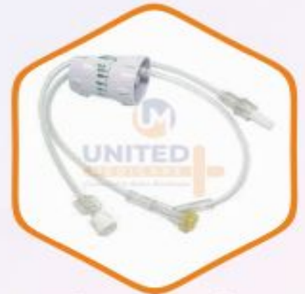
IV Flow Regulator Extension Set