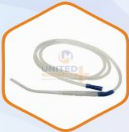
Yankauer Suction Set