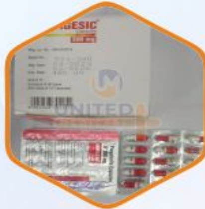
Nervigesic 300 Mg Capsules