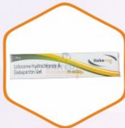
Lidocaine Hydrochloride and Gabapentin Gel