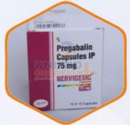
Nervigesic 75 Mg Capsules