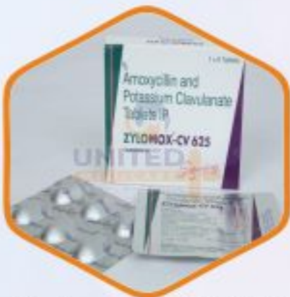
Zylomox-CV 625 Tablets