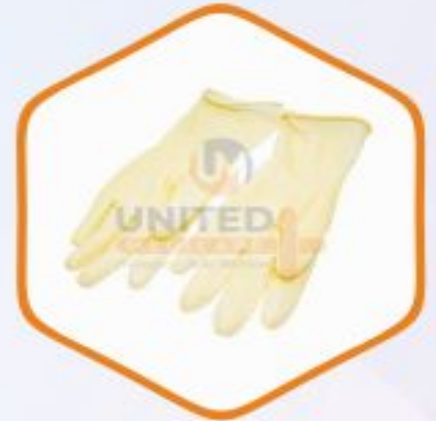
Latex Surgical Gloves