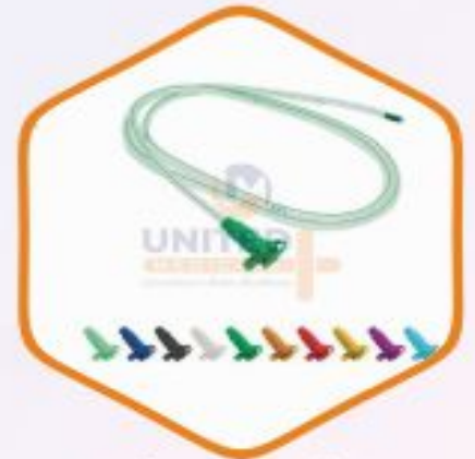
Ryles Feeding Tube