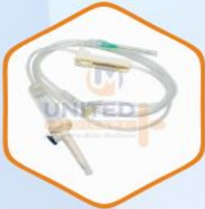
Infusion Set with Y-Connector