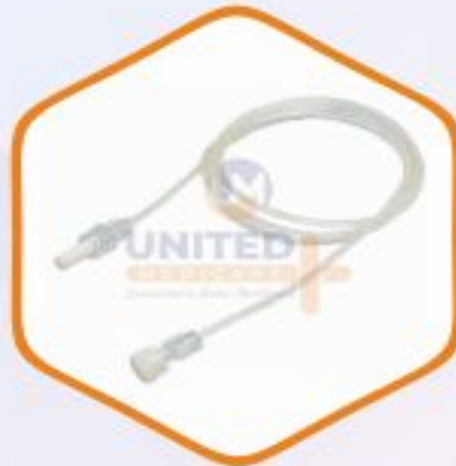
Extension Line Without Stop Cock