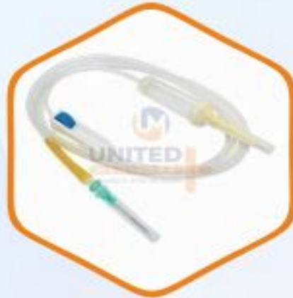
Non Vented Infusion Set