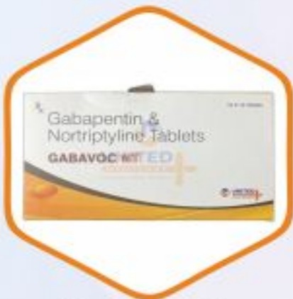
Gabapentin Nortriptyline Tablet