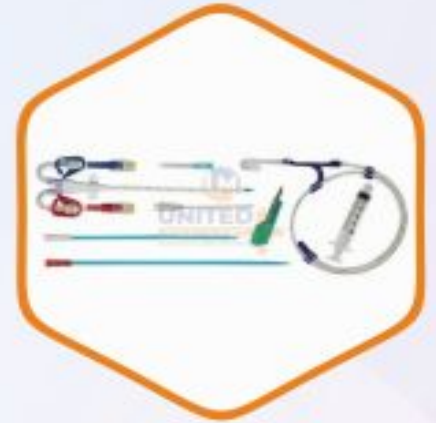
Hemodialysis Catheter Kit