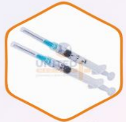
Auto Disable Syringe