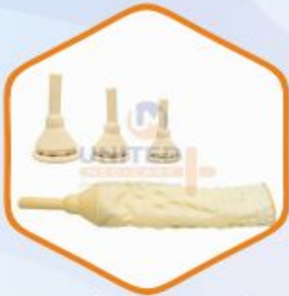
Male External Catheter