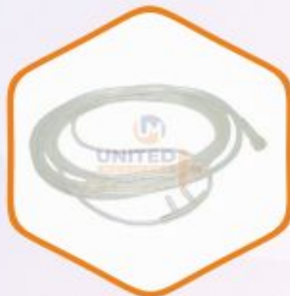
Twin Bore Nasal Oxygen Set