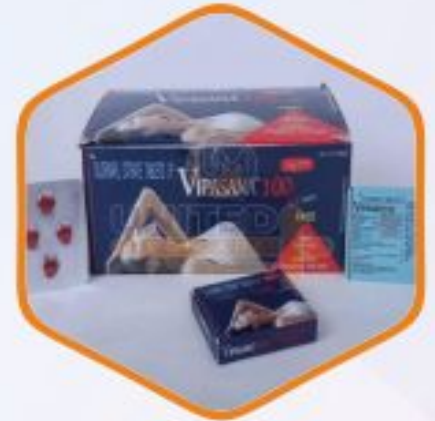
Vipasana 100 Tablets