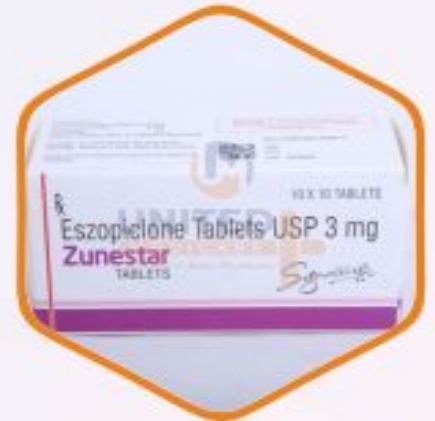
Zunestar 3 Mg Tablets