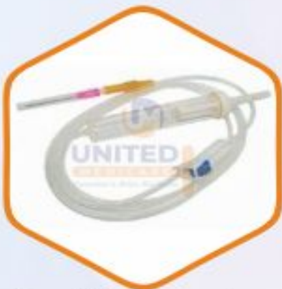
Double Chamber Blood Transfusion Set