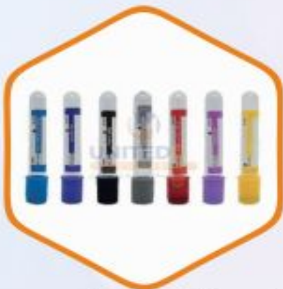
vacutainer blood collection tube