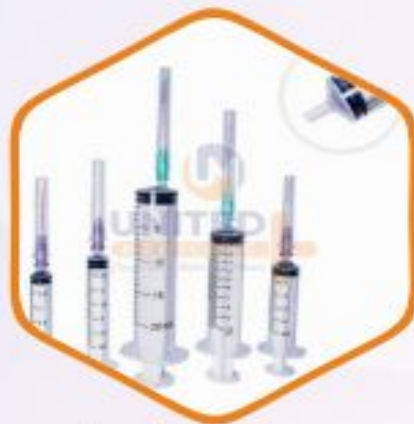
Syringe Luer Slip