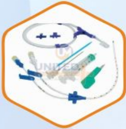
Central Venous Catheter