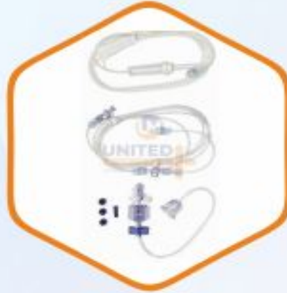
Single Pressure Monitoring Line.