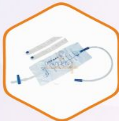
Leg Urine Collection Bag