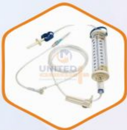
Measured Volume Burette Set