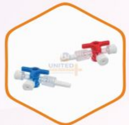
Three Way Stop Cock