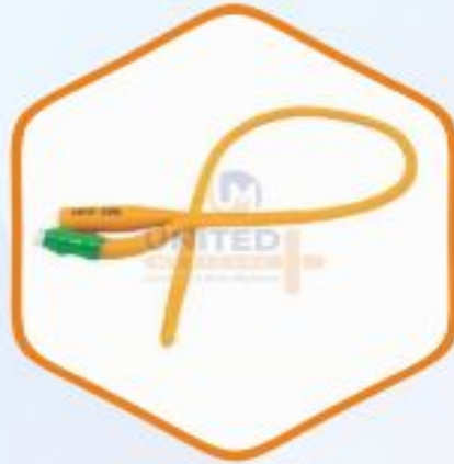
Foley Balloon Catheter