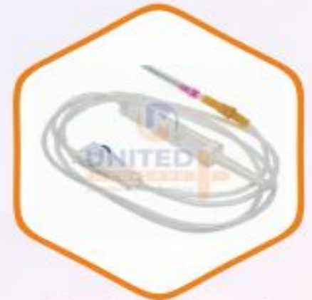
Single Chamber Blood Transfusion Set