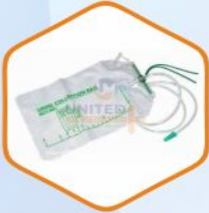
Urine Collection Bag With Nrv