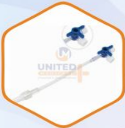
Extension Line With Stop Cock