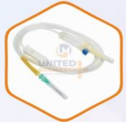
Vented Infusion Set