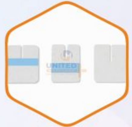
IV Cannula Fixator