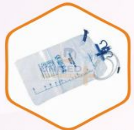
Urine Collection Bag With Drainage Outlet