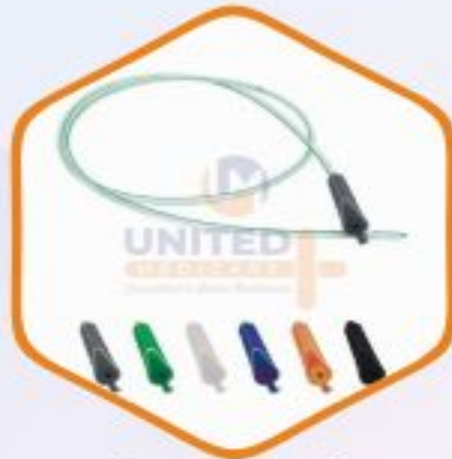
Infant Feeding Tube