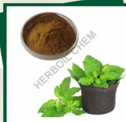
Ocimum Sanctum Extract