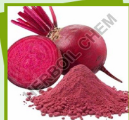
Beet Root Juice Powder