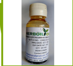
IPECACUANHA LIQUID EXTRACT 2% BP