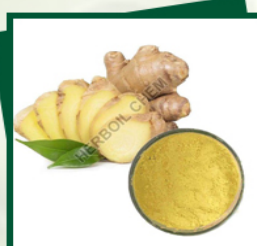
Zingiber Officinale Tuber Extract