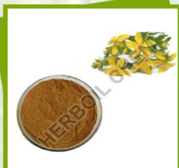
Amaltas Dry Extract