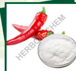
Capsaicin 95% Powder