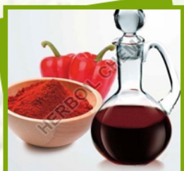
Paprika Food Color