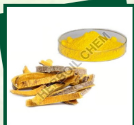
Berberine HCL 98%