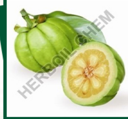
Garcinia Cambogia Extract