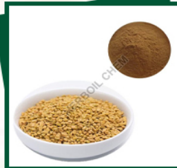
Trigonella Foenum Extract