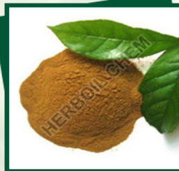
Adhatoda Vasica Leaf Extract