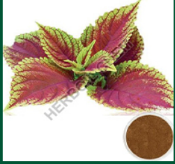
Coleus Forskolin Extract