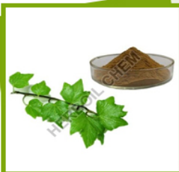
Ivy Leaf Extract