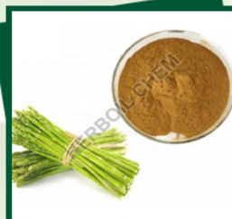
Asparagus Racemosus Extract