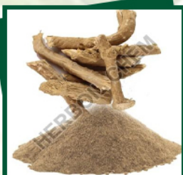
Boerhavia Diffusa Root Extract