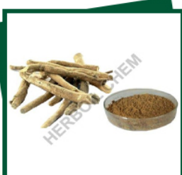
Withania Somnifera Extract