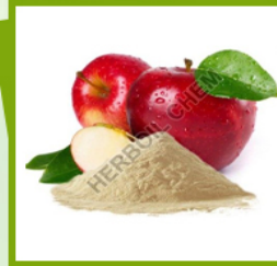
Apple Juice Powder