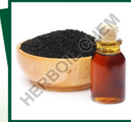
Nigella Sativa Oil