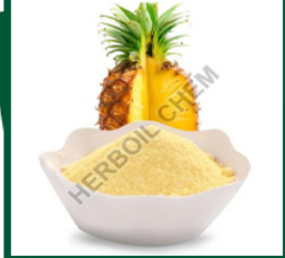
Ananas Comosus Fruit Extract (Bromelain)