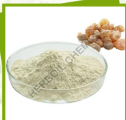
Boswellia Serrata Extract