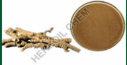
Cephaelis Ipecacuanha Liquid Extract 2%