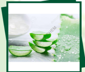
Aloe Vera Extract