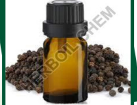
Black Pepper Oleoresin