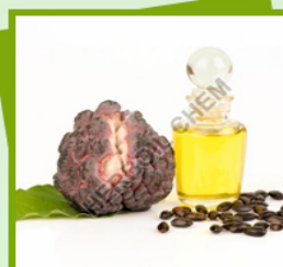
Custard Apple Oil