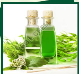
Tea Tree Oil