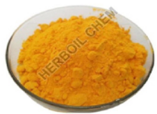
Coenzyme Q10 99% Powder