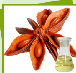
Star Anise Oil