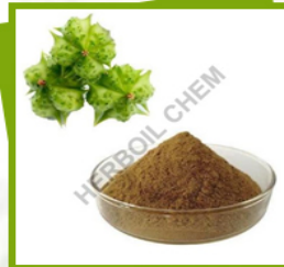
Tribulus Terrestris Extract