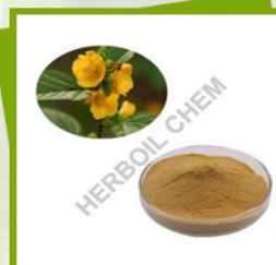
Sida Cordifolia Extract