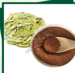
Senna Leaf Extract