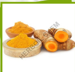
Nano Curcumin Extract