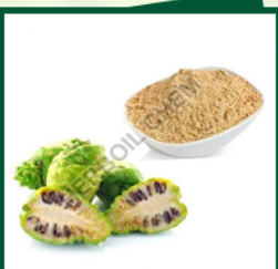
Morinda Citrifolia Extract