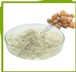
BOSWELLIA SERRATA (AKBA 10%-75%)