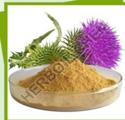
Milk Thistle Extract