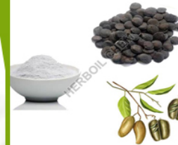
Griffonia Seed Extract 5 HTP