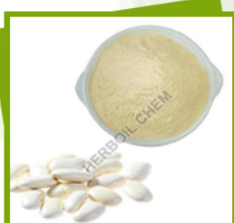
White Kidney Extract