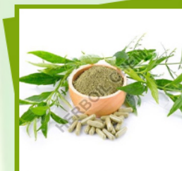
Andrographis Paniculata Extract