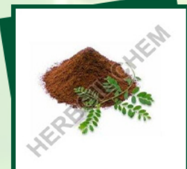
Phyllanthus Niruri Extract