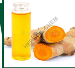
Nano Curcumin 5% to 20% Liquid Water Soluble