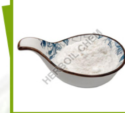
Trypsin Chymotrypsin Powder