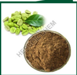
Green Coffee Bean Extract