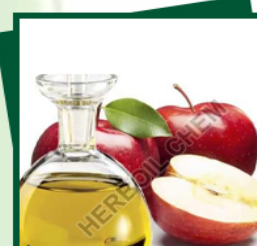
Apple Seed Oil