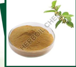
Gymnema Sylvestre Extract