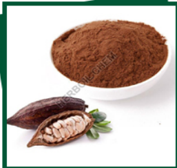
Theobroma Cacao Extract