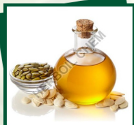
Pumpkin Seed Oil