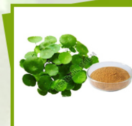
Centella Asiatica Herb Extract