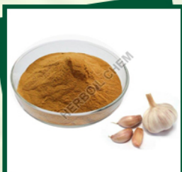
Allium Sativum Extract