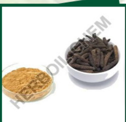
Piper Longum Extract