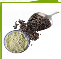
Piper Nigrum Extract