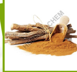
Glycyrrhiza Glabra Extract