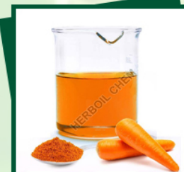
Beta Carotene Color