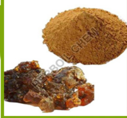
Commiphora Mukul Extract