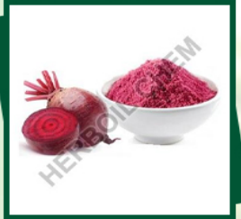
Beet Root Powder