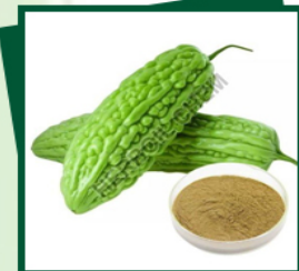
Momordica Charantia Fruit Extract