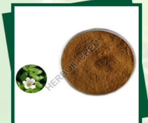
Bacopa Monnieri Extract