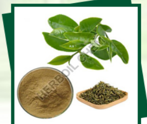
Camellia Sinensis Extract