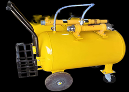
Mobile Foam Unit