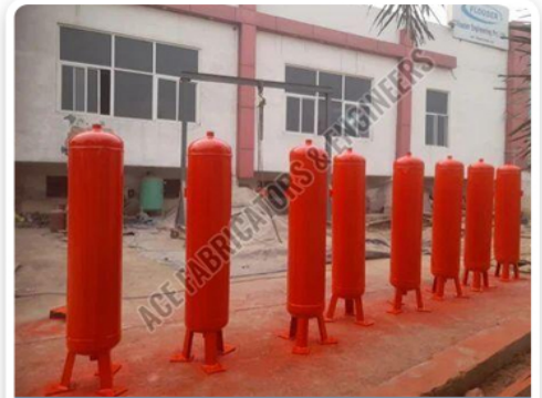
Stainless Steel Air Vessel