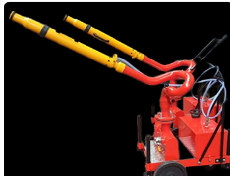
Foam tank with monitor