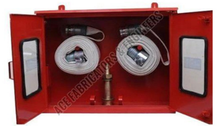
Mild Steel Fire Hose