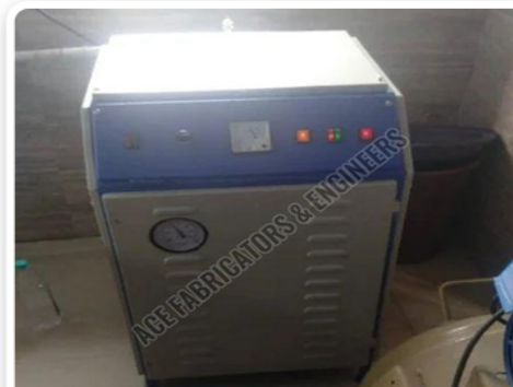
18 W Multi Purpose Electric Steam Boiler