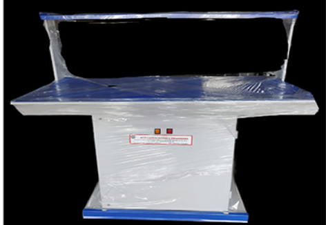
Steam vaccum table for garment use