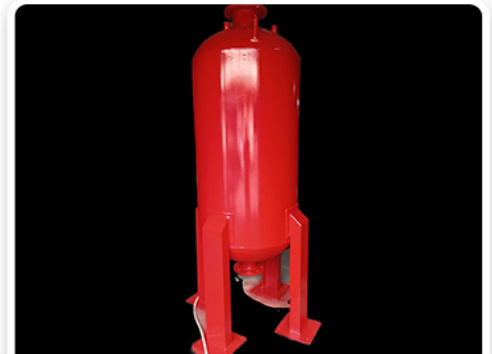
DCP 500KG Tank