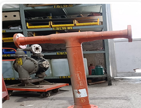
Hydran stand post