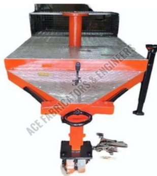
Trailer Mounted Foam Monitor