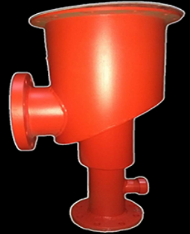
Foam maker with vapour seal chamber