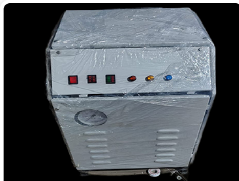
Electric Atomatic Steam boiler 12 KW for garment use