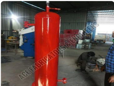
Mild Steel Air Vessel