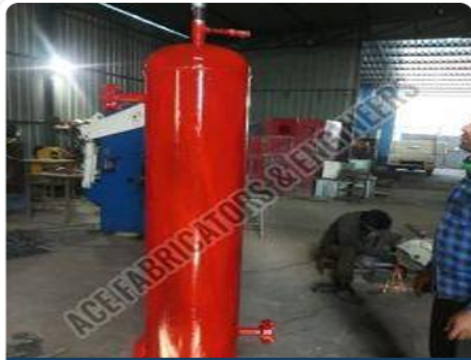
Mild Steel Hose Reel Stand