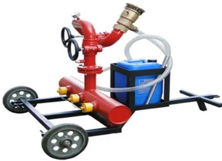
Fork monitor trolley