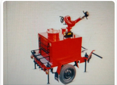
Foam tank with trailer mounted monitor