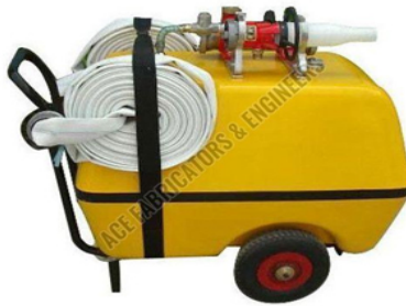
Mobile Foam Unit