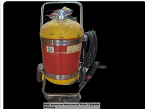
High Pressure mechanical foam