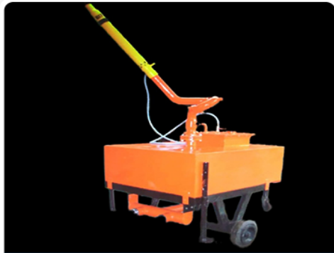
Foam Tank Trolley mounted