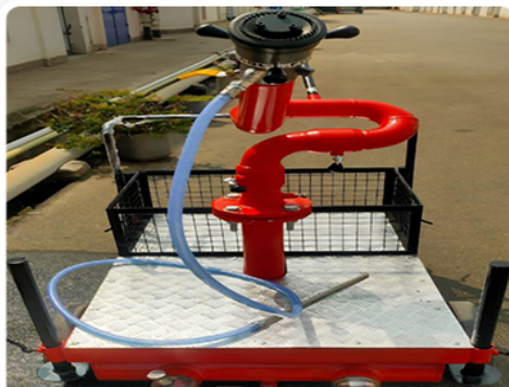
Foam Monitor Trolley