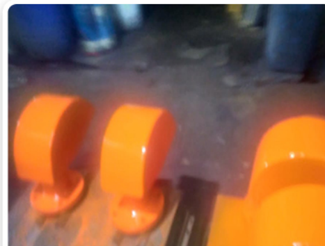
Flanch type foam deflector