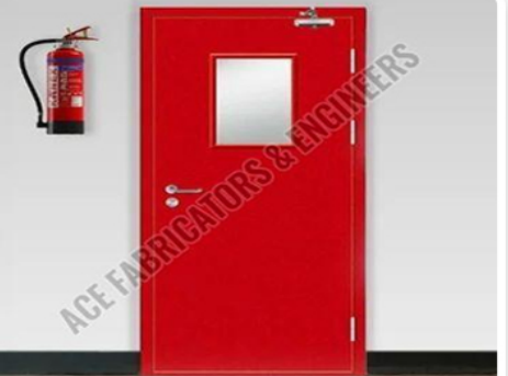
Mild Steel Fire Door