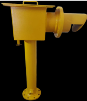
Foam maker with vapour sealed chamber attached deflector