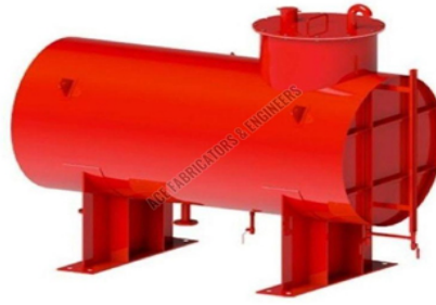
Stainless Steel Foam Storage Vessel