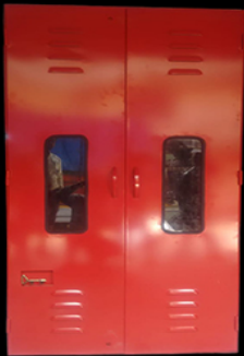
MS Ducting Fire Door