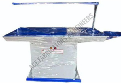
Blue Vacuum Steam Ironing Table