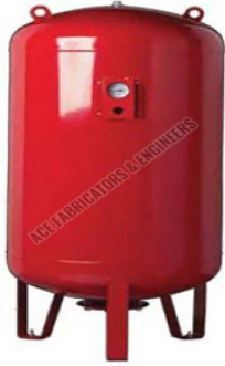
Stainless Steel Dry Chemical Powder Vessel