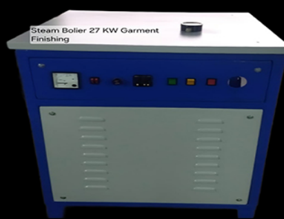
Steam Bolier 27KW for garment use