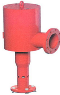
Foam maker with vapour seal chamber