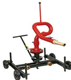
Water monitor trolley