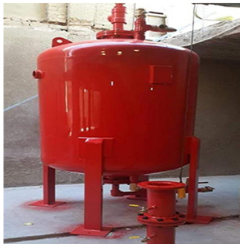
Bladder Foam Tank