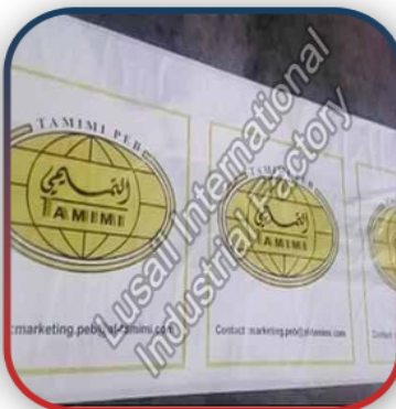
Printed Long Trailer Cover Sheet