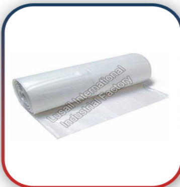
Polyethylene Sheet Roll