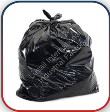
55 Gallon Black Plain Garbage Bag