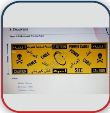
150mm Electrical Powder Cable Tape