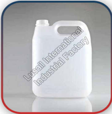
5 Litre HDPE Jerry Can