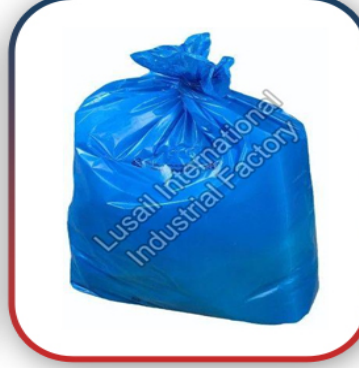
10 Gallon Blue Trash Bags