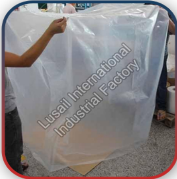
PE Clear Polythene Jumbo Bag