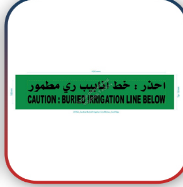
150 Mm Drip Irrigation Tape