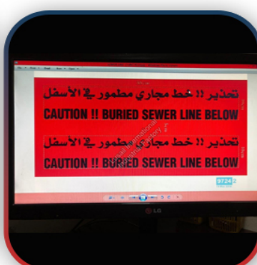
300 Mm Red Sewer Line Warning Tape