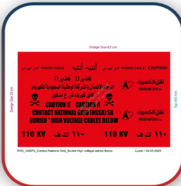
450 Mm National Grid High Voltage Insulation Tape