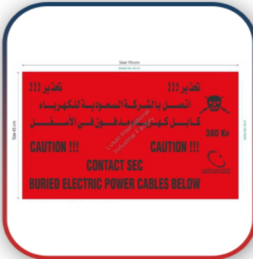
450mm Electric Power Cable