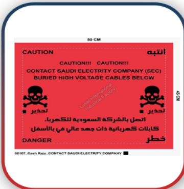
450 Mm Electric Power Cable Tape