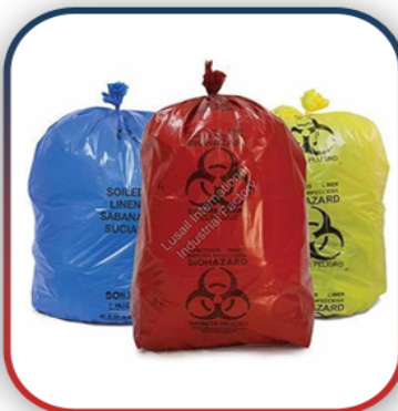
Biomedical Waste Collecting Bag