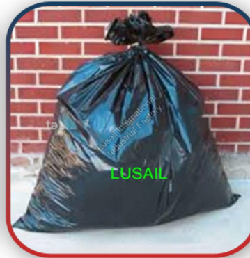
Plastic Trash Bag