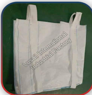
AB-72 Fibc Jumbo Bag