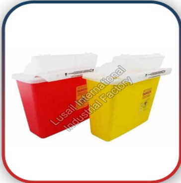
Sharp Disposal Container