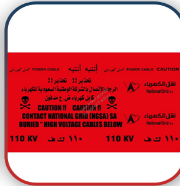
Electrical High Voltage Tape