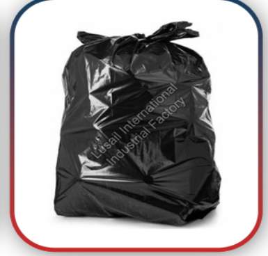
30 Gallon Black Trash Bags