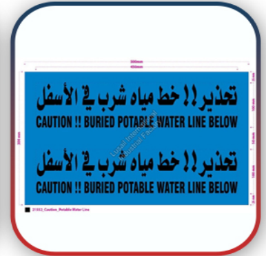
300mm Potable Water Line Warning Tape