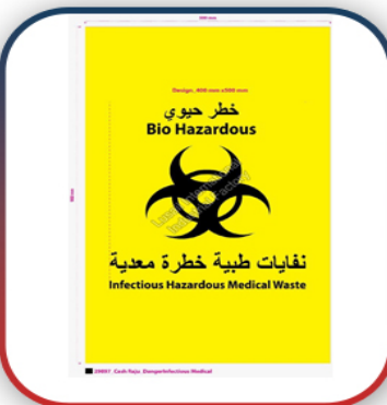
150 Micron Biohazard Heavy Duty Bag