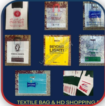
Textile Shopping Bags