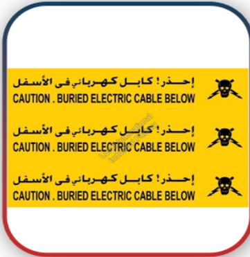
Electric Cable 3 Lines Warning Tape