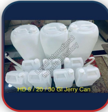
HDPE Jerry Can