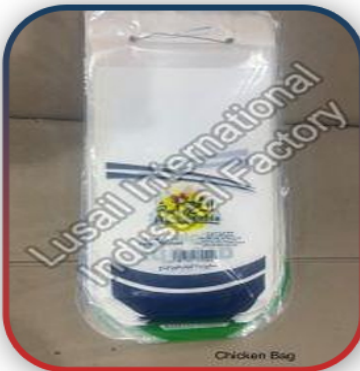
Poultry Chicken Plastic Bag