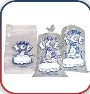
Plastic Ice Packing Bag