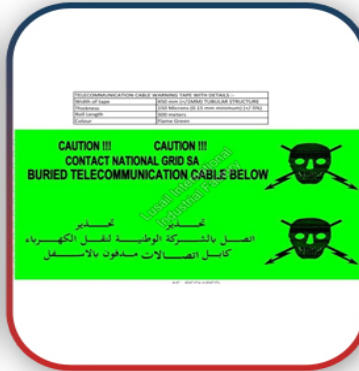
Electric National Grid Tape