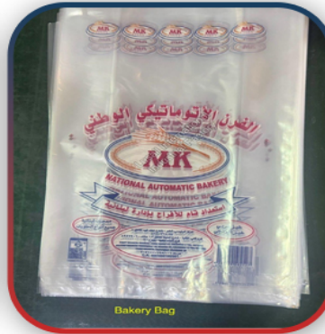
PE Bakery Bag