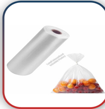
LDPE Vegetable Bag