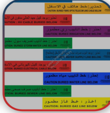
Detectable Warning Tape