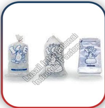
Plastic Sufra Food Serve Sheet