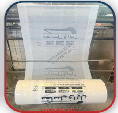
Plastic Laundry Bag