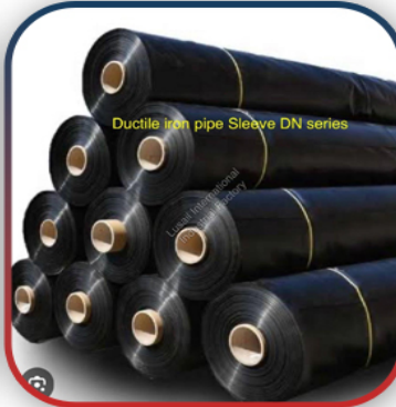
Ductile Iron Pipe Polyethylene Sleeve Film