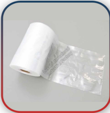
HDPE Vegetable Bag Roll