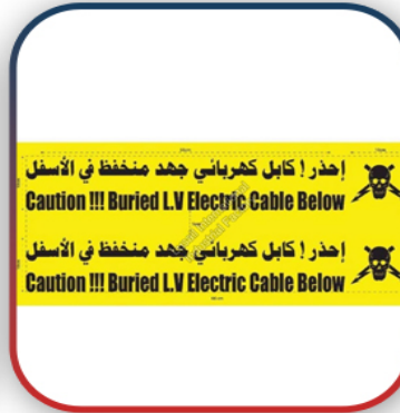
300mm LV Electrical Cable Tape