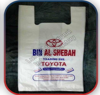
HDPE Shopping Bag