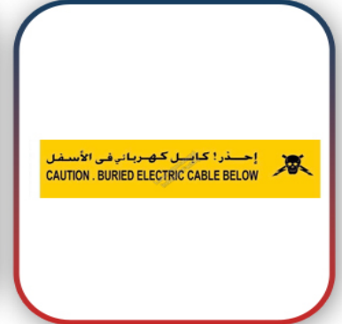
150 Mm Electric Cable Tape