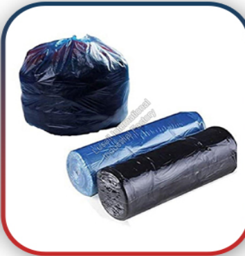
55 Gallon Black Trash Bags