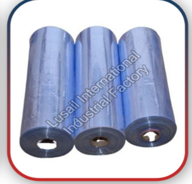
Shrink Sheet Roll