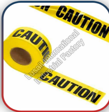
Caution Barricade Tape