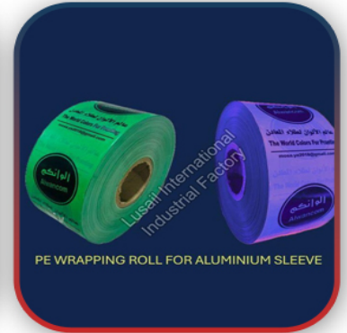
PE Plastic Wrapping Roll