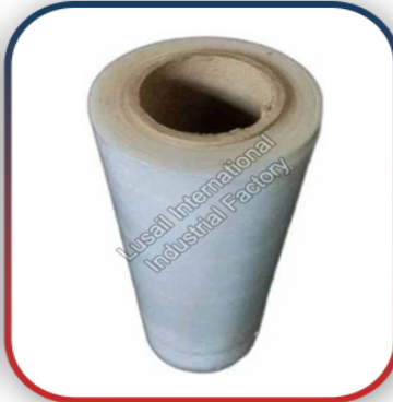
500mmx1200m LDPE Stretch Film for Pallet Wrap