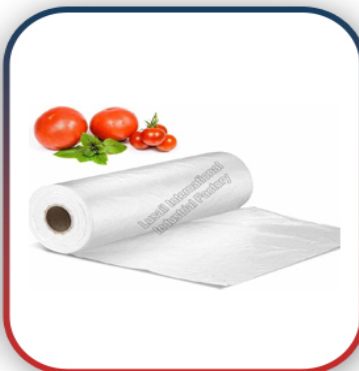
LLDPE Vegetable Bag Roll