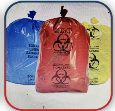
150 Micron 50 GL Bio Hazard Heavy Duty Bag