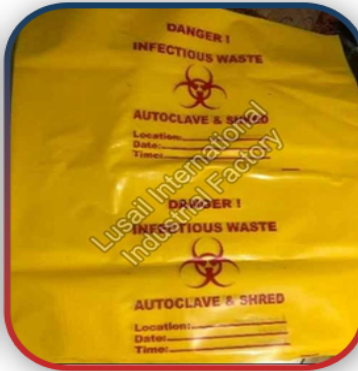
Infectious Bio Medical Waste Bag