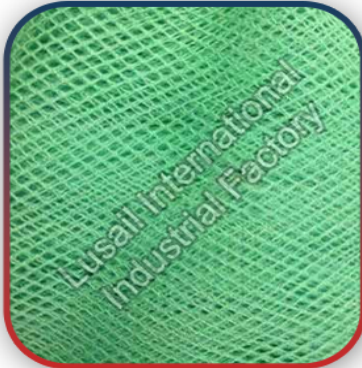
Construction Sites Safety Netting