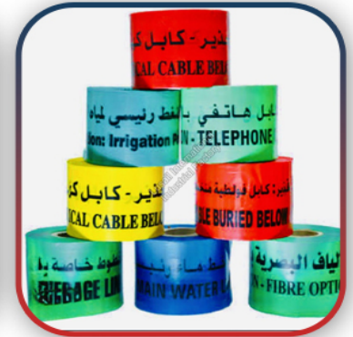
PE Warning Tape