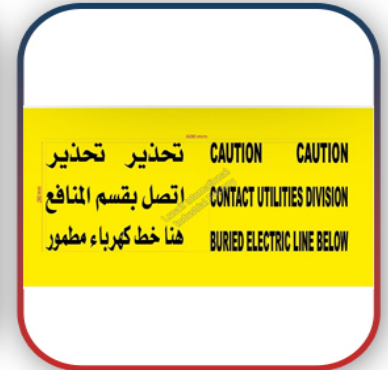
Elect 458 W Utilities Yellow Warning Tape