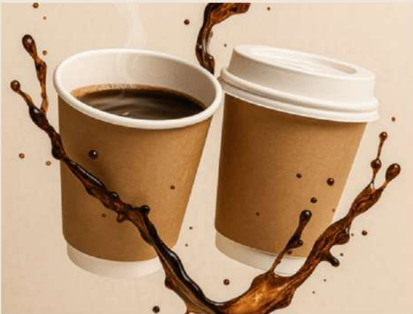
Double wall paper cup