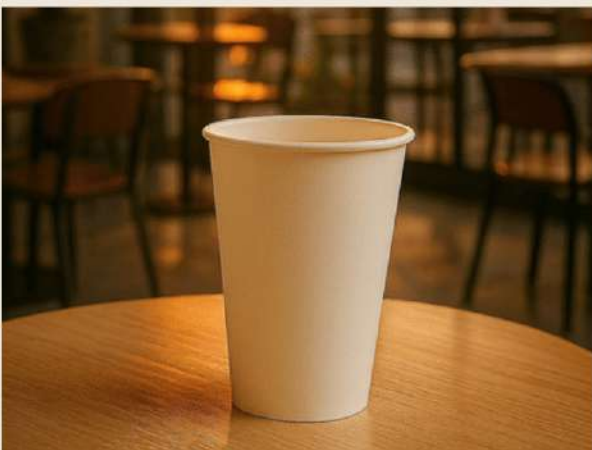
Single wall paper cup