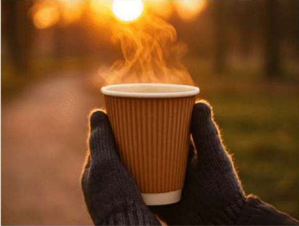
Ripple Paper Cup