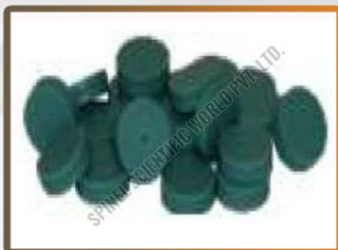
20mm EC Grade PTFE Silicon Septa