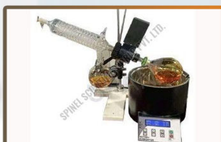
Manual Lift Rotary Evaporator