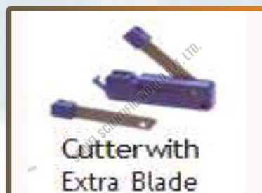
Cutter with Extra Blade Capillary Tubing Cutter