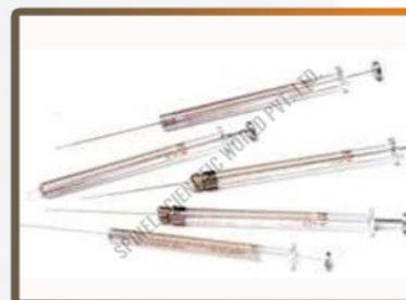
Precision Glass Hamilton Syringe