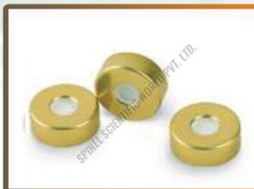
20mm Magnetic Crimp Cap with Silicone Septa