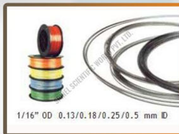
PEEK and SS Tubing for GC HPLC Applications