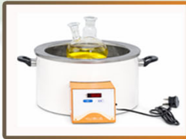
Laboratory Oil Bath