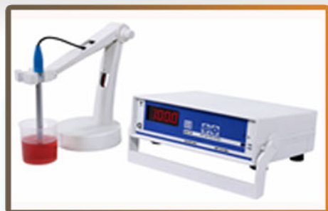
SSW-15 DIGITAL TDS