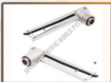
SS Crimper De- crimper Tool for Headspace Caps