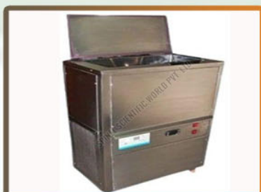
Sonicator With Chiller