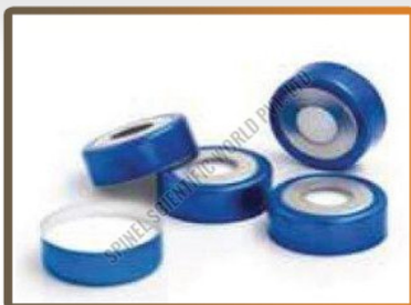
20mm Crimp Cap Silicone Septa