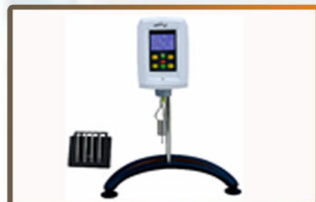
SSW-730 DIGITAL AUTOMATIC