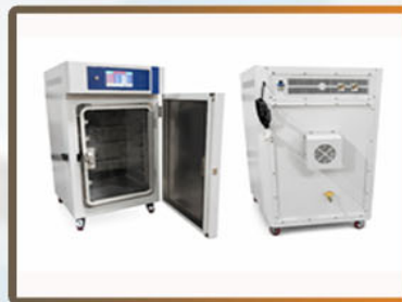
Tri Gas Incubator