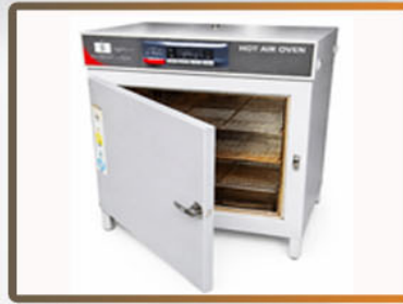
Laboratory Hot Air Oven