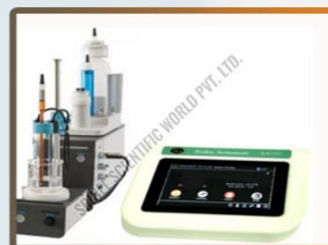
Karl Fischer Ti- trator