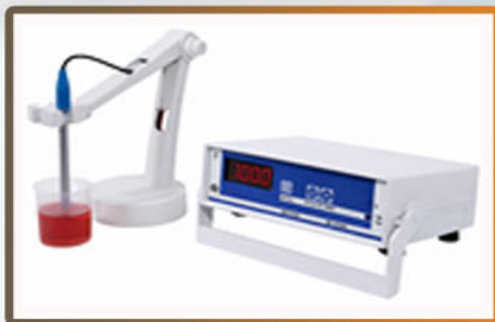
SSW-26 DIGITAL CONDUCTIVITY