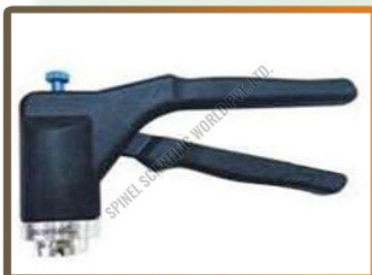
20mm Headspace Caps Manual Crimper