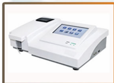
SSW-1201 BIO CHEMISTRY