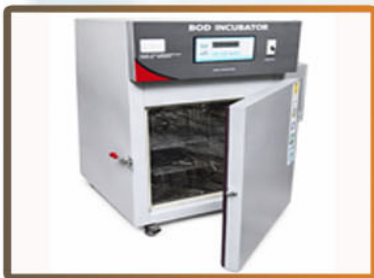
BOD Incubator Chamber