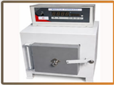
Ceramic Fibre Muffle Furnace