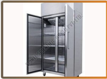
Industrial Double Door Deep Freezer