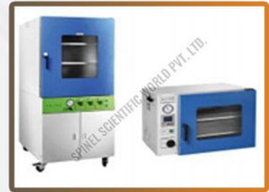
Vacuum Drying Oven