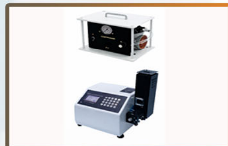
SSW-672 MICRO- PROCESSOR FLAME