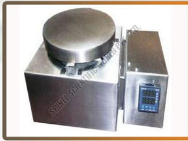
Digital Laboratory Hot Plate