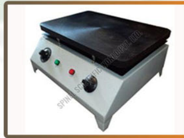
Rectangular Laboratory Hot Plate