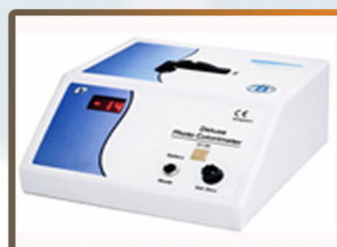
SSW-112 DELUX PHOTO COLORIMETER IN-BUILT