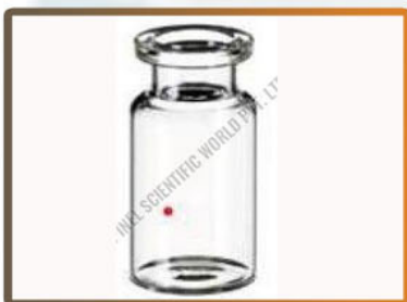
10ml Clear Glass Headspace Vial