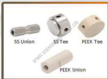
HPLC Union and Tee Fittings