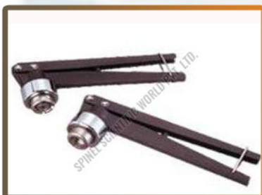
MS Crimper De- crimper Tool for 20mm Headspace Caps