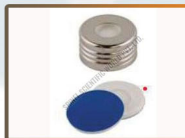
18mm Magnetic Screw Cap