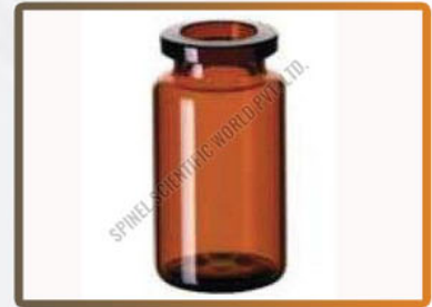
10ml Amber Glass Headspace Vial