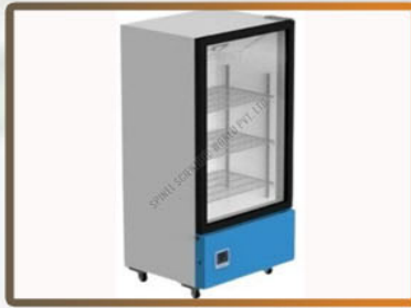
Laboratory Glass Door Refrigerator