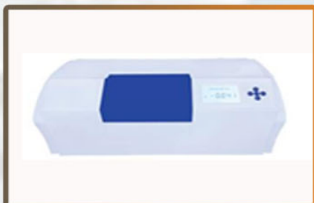
SSW-750 DIGITAL AUTOMATIC