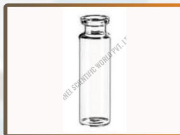
20ml Clear Glass Headspace Vial