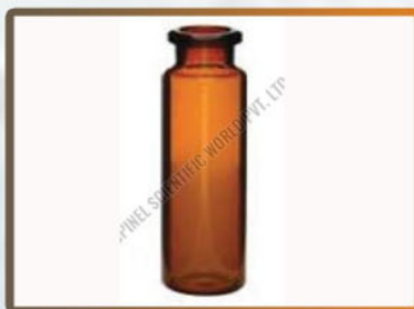
20ml Amber Glass Headspace Vial