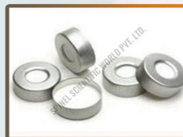
20mm Aluminium Crimp Cap