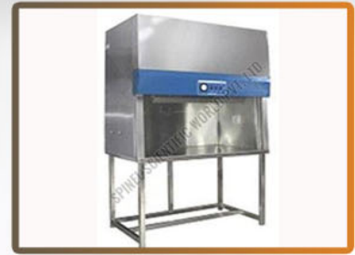
Horizontal Laminar Air Flow Cabinet