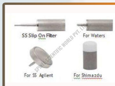
HPLC Mobile Phase Filter