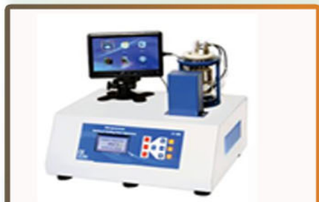
SSW-108 MICRO- PROCESSOR MELTING POINT