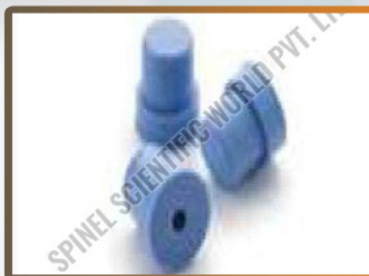
20mm Enduro Blue Septa