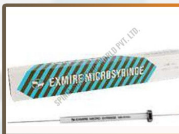
Gc Autosampler Syringe