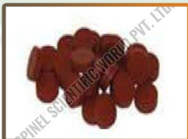
20mm HT Grade Gc Septa for Headspace Vials