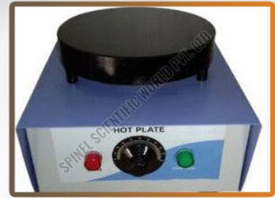
Laboratory Hot Plate