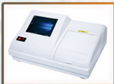
SSW-1260 MICROPLATE ELISA