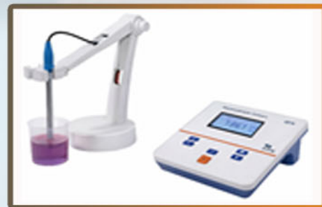
SSW-50 MICRO- PROCESSOR PH METER 5 POINT