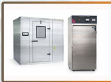
Stability Test Chamber