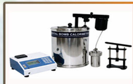
SSW-1160 AUTO- MATIC BOMB