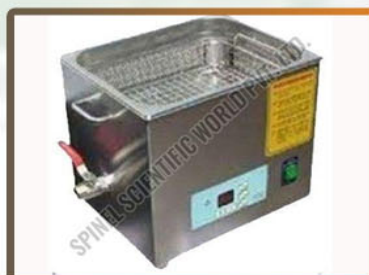
Ultrasonic Bath Sonicator