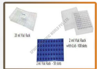
Laboratory Vial Rack for 2ml and 20ml Vials