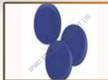
20mm Gp Grade Blue Septa