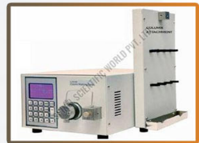
Column Washing Pump