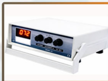
SSW-27 DIGITAL D.O.