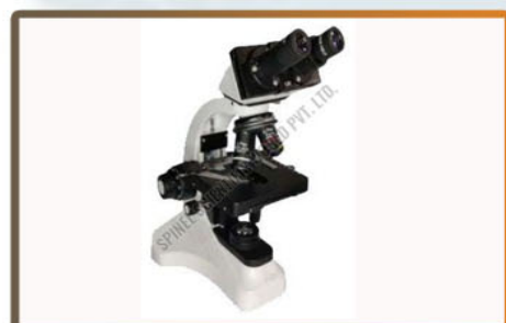
Ssw Asi 44 Research Microscope