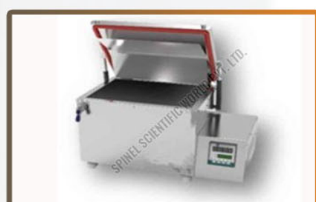
Industrial Steam Pot Machine