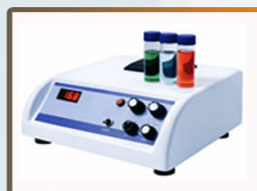
SSW-330 DIGITAL PHOTO