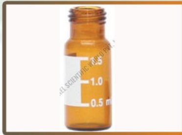
1.5ml Amber Glass Screw Neck Vial