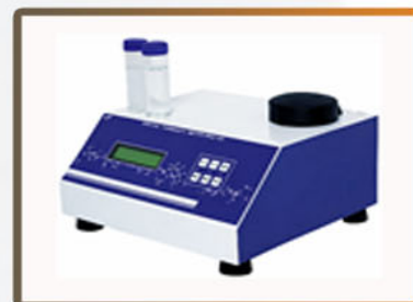
SSW-35 MICROPROCESSOR TURBIDITY