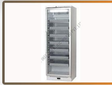
Pharma Grade Lab Refrigerator