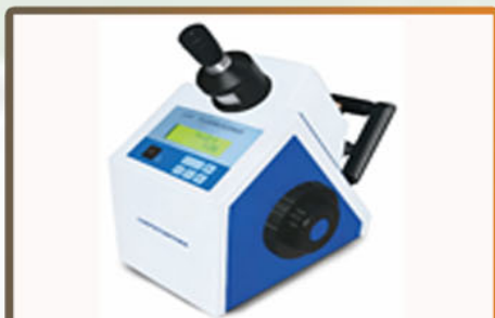
SSW-738 DIGITAL ABBE