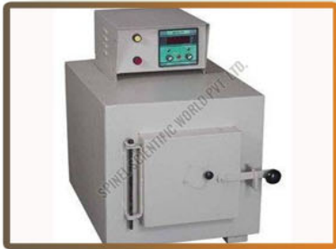
Laboratory Muffle Furnace