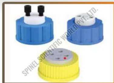
HPLC Solvent Bottle Safety Cap