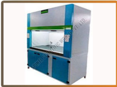
Laboratory Fume Hood