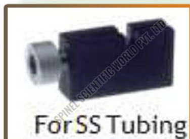
Stainless Steel Tubing Cutter