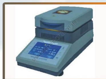
Digital Moisture Analyzer Machine