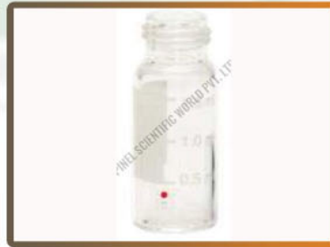
1.5ml Clear Glass Screw Neck Vial