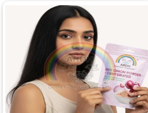
Dehydrated Red Onion Powder