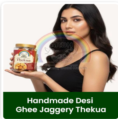
Handmade Desi Ghee Jaggery Thekua