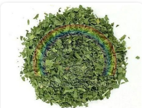
Dried Fenugreek Leaves