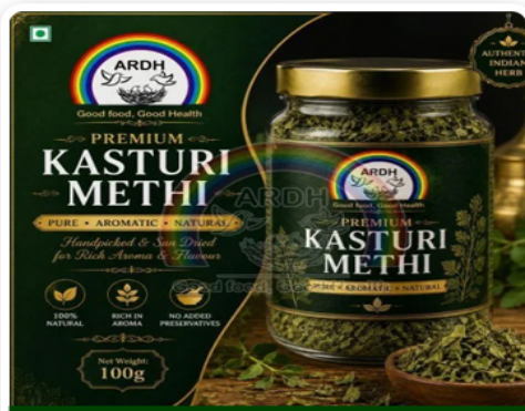
Dried Kasuri Methi Leaves