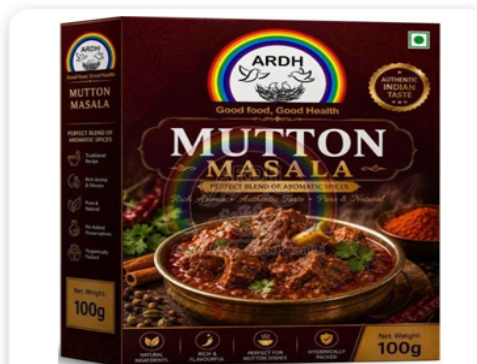
Ardh Mutton Masala Powder