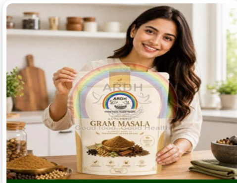
Garam Masala Powder