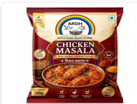
Ardh Chicken Masala Powder