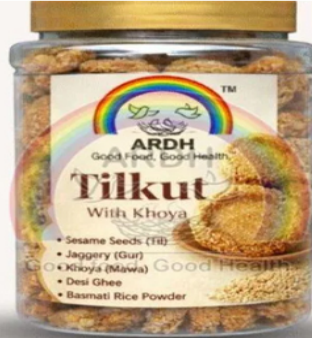
Tilkut with Khoya