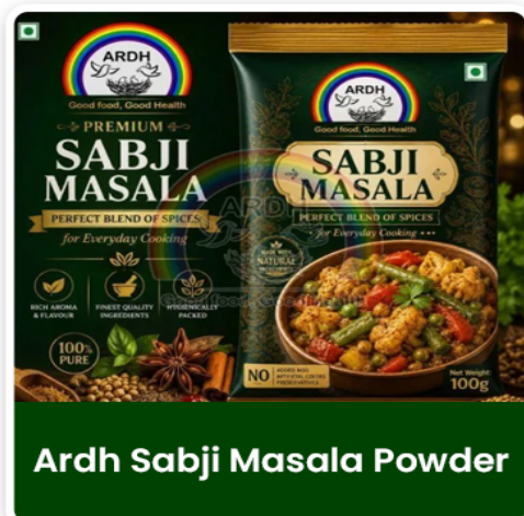
Ardh Sabji Masala Powder