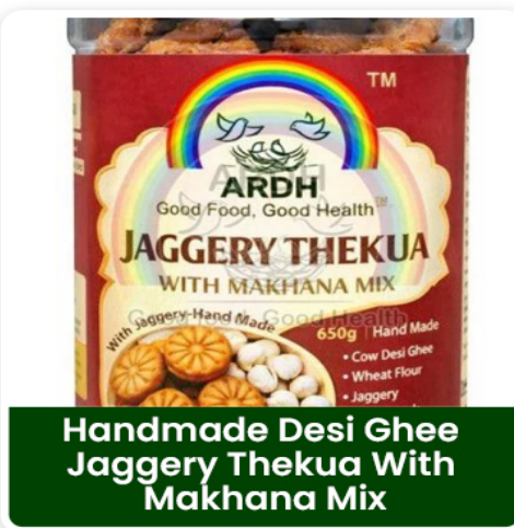
Handmade Desi Ghee Jaggery Thekua With Makhana Mix