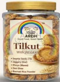
Tilkut with Jaggery