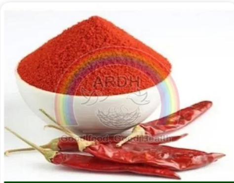
Kashmiri Red Chilli Powder