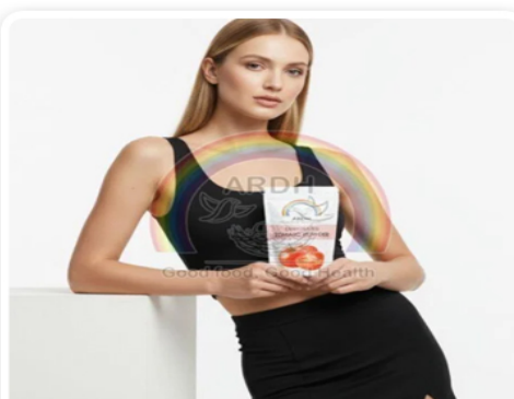
Dehydrated Tomato Powder