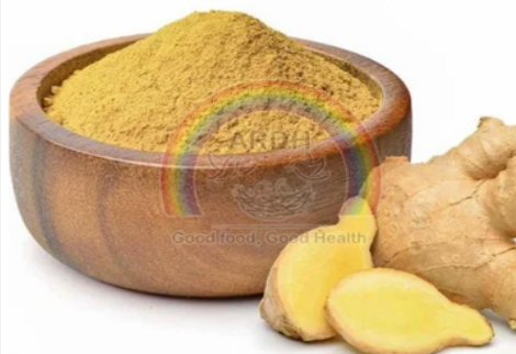
Dehydrated Ginger Powder