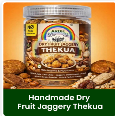
Handmade Dry Fruit Jaggery Thekua