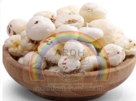
6 Suta Phool Makhana