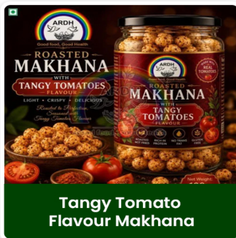
Tangy Tomato Flavour Makhana