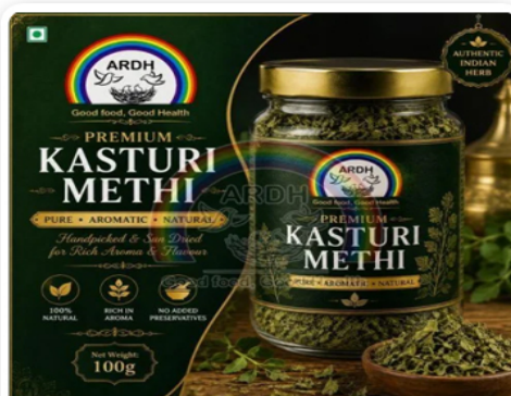
Ardh Kasturi Methi