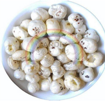
4 Suta Phool Makhana