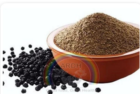
Black Pepper Powder