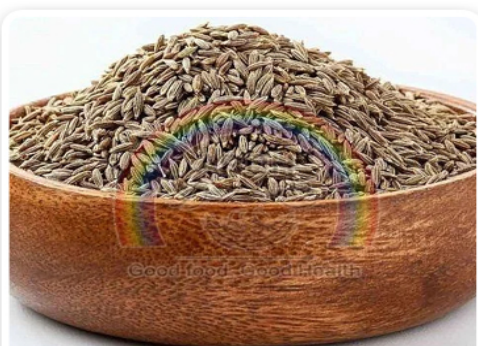
Brown Cumin Seeds