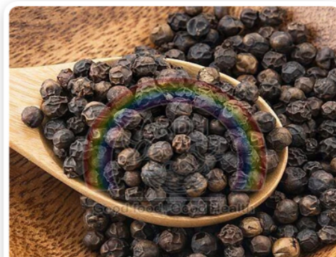
Black Pepper Seeds