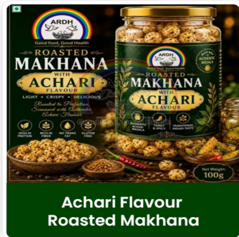
Achari Flavour Roasted Makhana