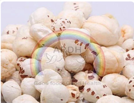
5 Suta Phool Makhana