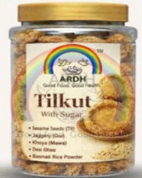
Tilkut with Sugar