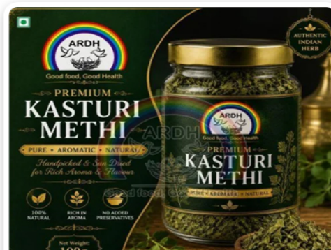
Dried Kasuri Methi Leaves