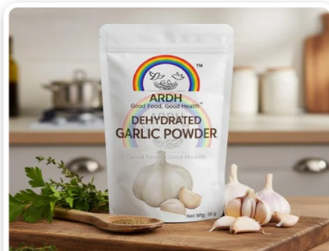
Dehydrated Garlic Powder