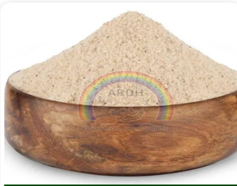
Pure Hing Powder