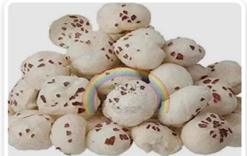
7 Suta Phool Makhana