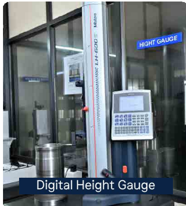
Digital Height Gauge