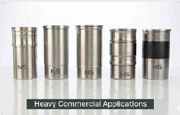
Heavy Commercial Applications