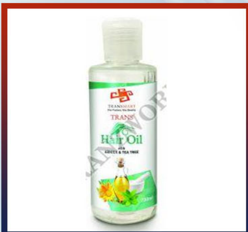
Trans Hair Shampoo