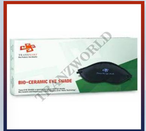
Trans Bio Ceramic Eye Shade