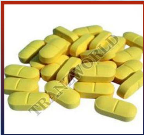
Trans Calcium Tablets