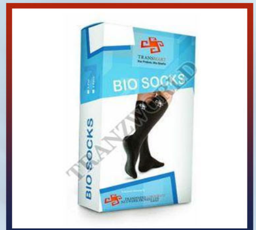
Trans Bio Socks