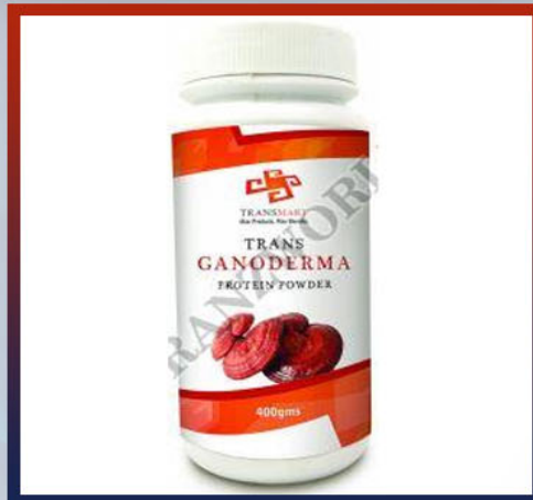
Trans Ganoderma Protein Powder