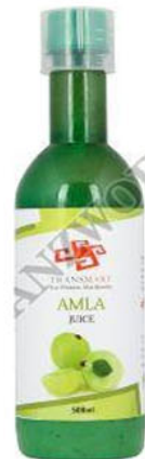
Trans Amla Juice