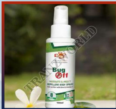
Trans 100ml Bug Off Body Spray