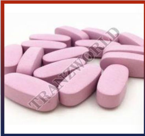
IME-9 Ayurvedic Diabetes Tablets