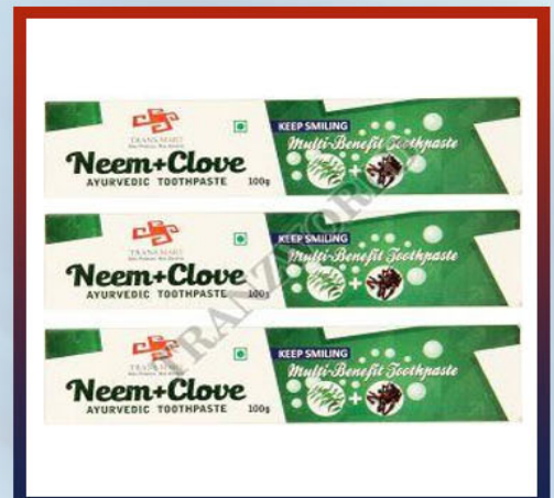
Trans Neem Clove Toothpaste