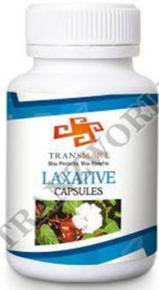
Trans Laxative Capsules