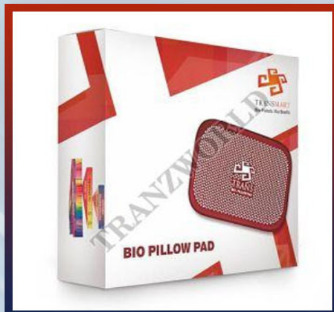
Trans Bio Pillow Pad