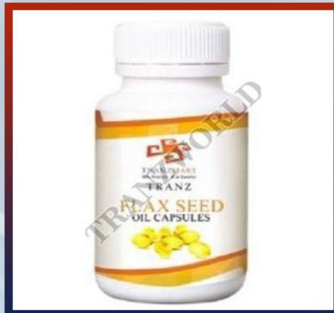
Trans Flax Seed Oil Capsules