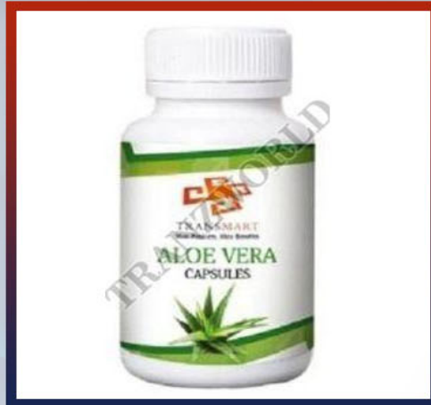
Trans Aloe Vera Capsules