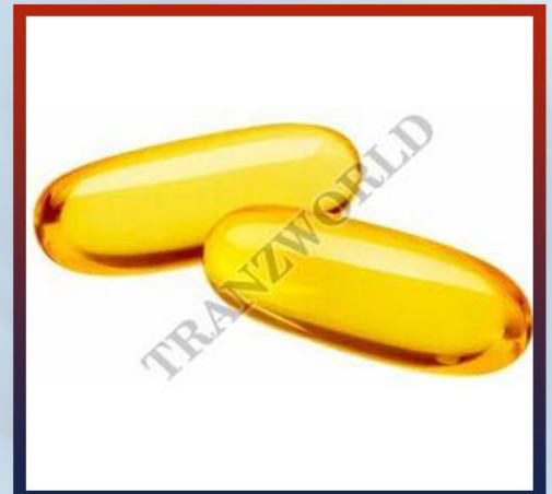
Trans Ganoderma Capsules