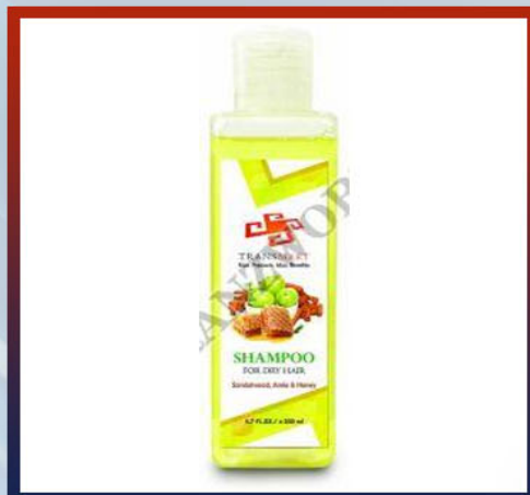
100gm Trans Gentle Cleansing Bar