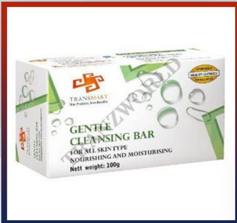
100gm Trans Gentle Cleansing Bar