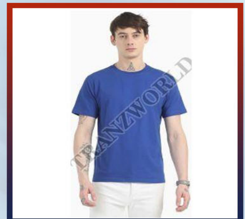
Solid Round Neck T-Shirt