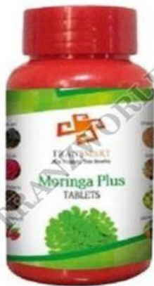
Tranz Moringa Plus Tablets