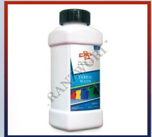
Trans Biodegradable Fabric Wash