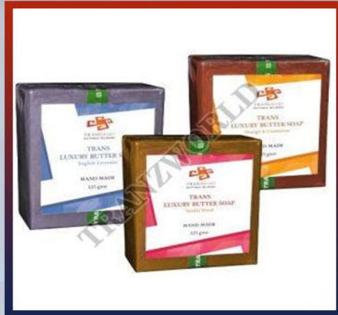
125gm Trans Handmade Luxury Soap