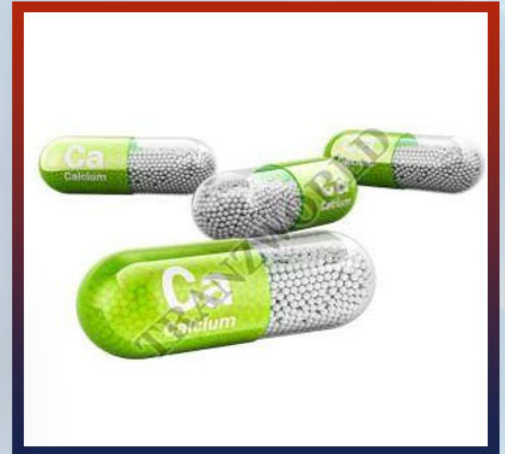
Trans Calcium Capsules