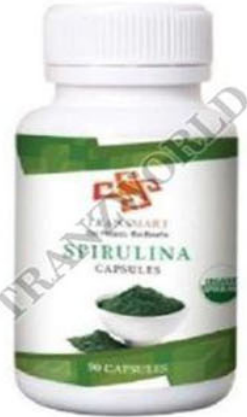
Trans Spirulina Capsules