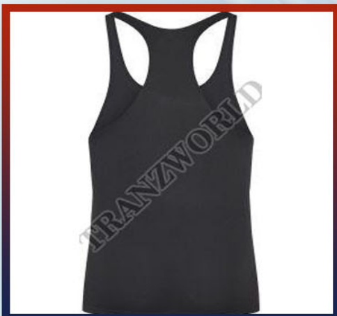
Trans Bio Ceramic Mens Health Singlet