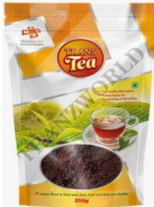
250gm Trans Tea