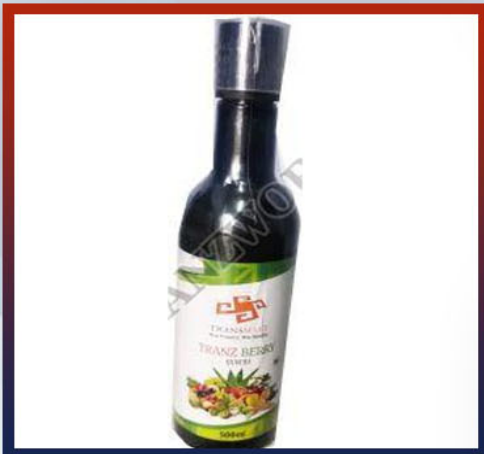
Trans Berry Juice