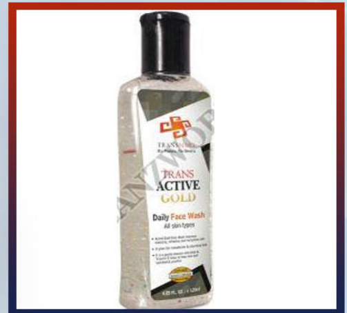
Trans Active Gold Face Wash