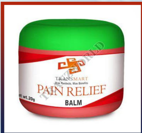
Trans Pain Relief Balm