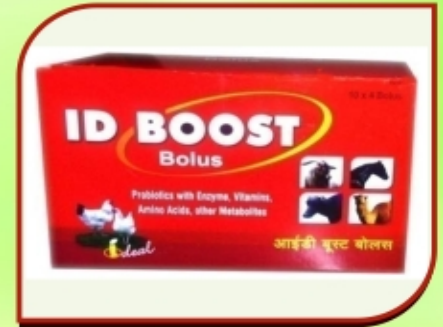
ID Boost Bolus