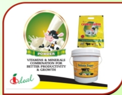
Calmix Super Forte Powder