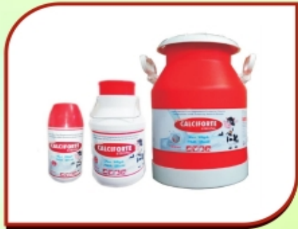
Chelated Calciforte Strong Liquid