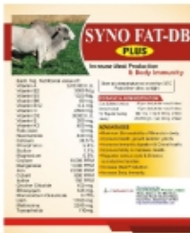
Syno Fat-DB Plus