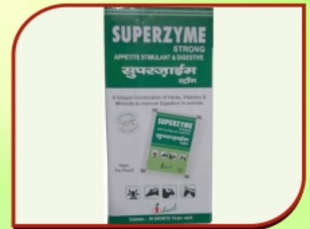
Super Zyme Liquid