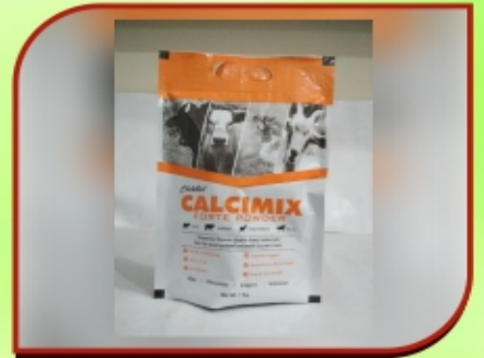
Chelated Calcimix Forte Powder