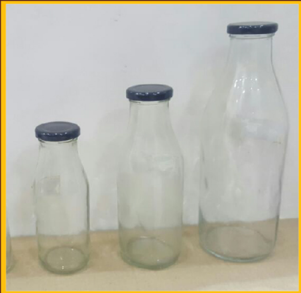
Keventers glass bottles