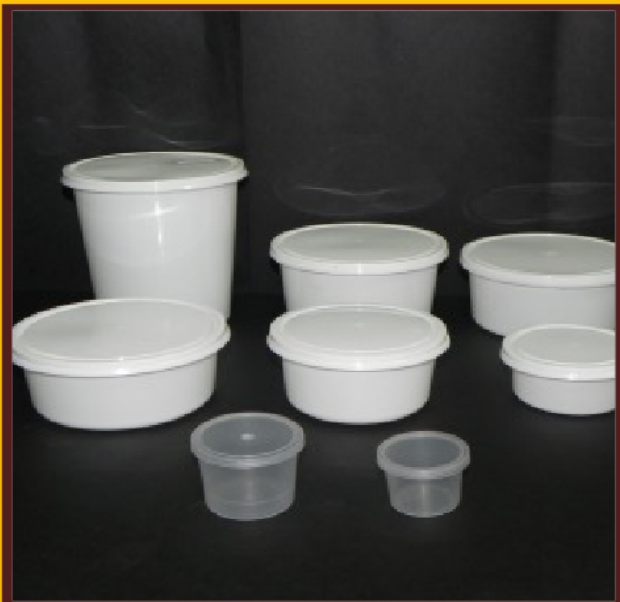
White round container