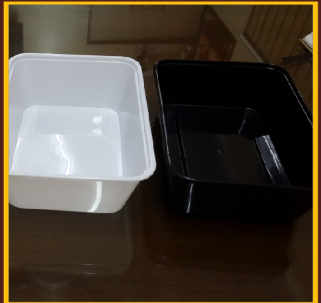
Plastic rectangular container