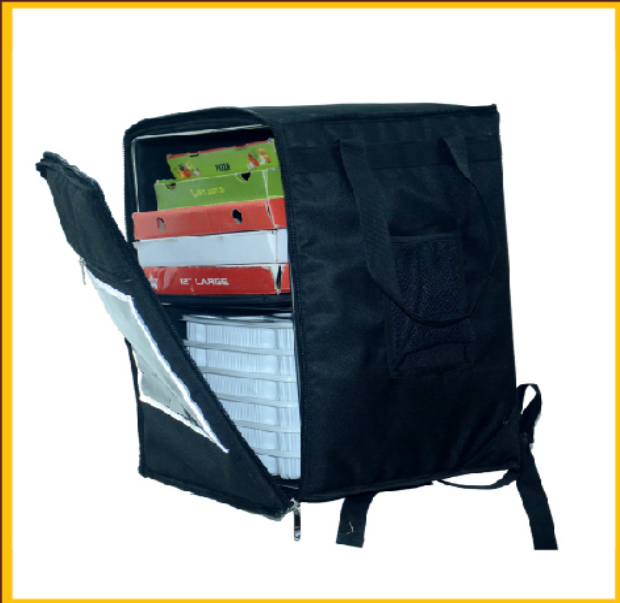
Pizza Front Load