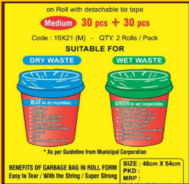
Biodegradable Grabage Bag