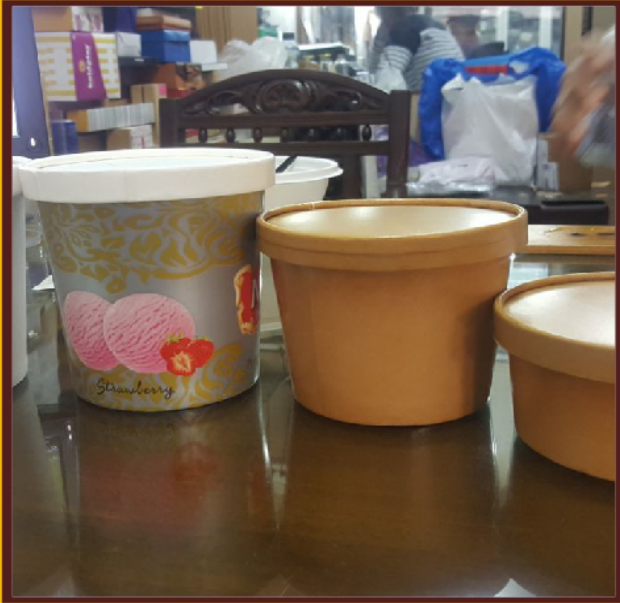
Paper tub with paper lids