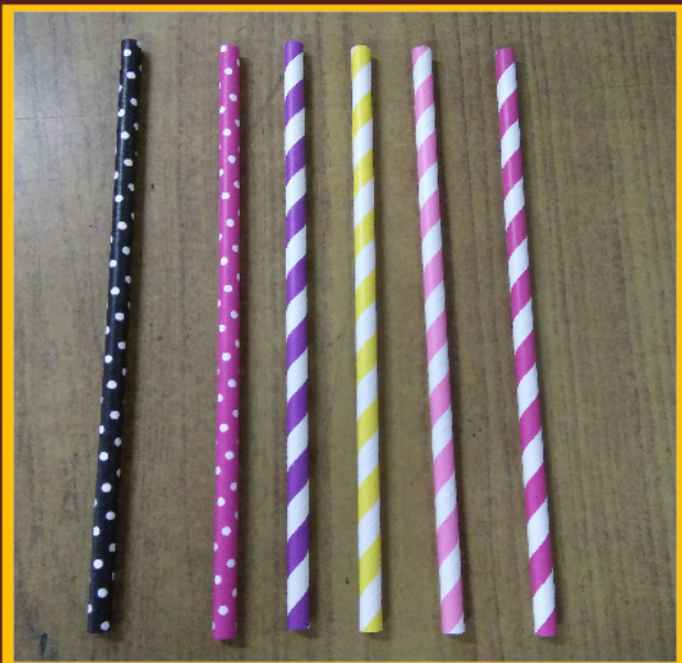
Paper straw coloured 6,8 mm