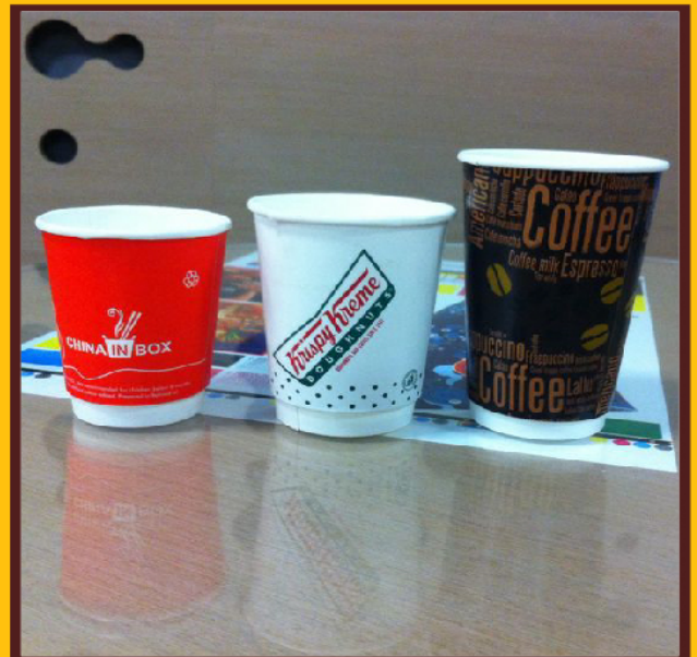
Double wall glasses