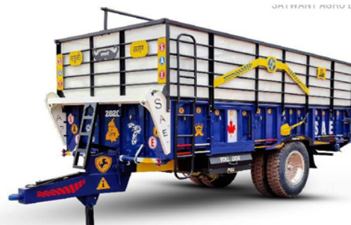
Hydraulic Tractor Trolley