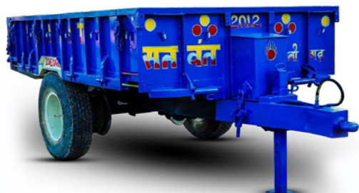
Fixed Tractor Trolley