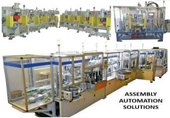
ASSEMBLY AUTOMATION SOLUTIONS