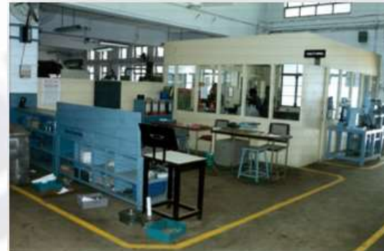
Quality Control Dept.