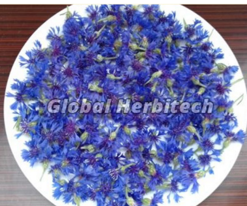
Centaurea Cyanus Flower