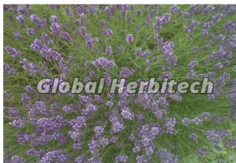
Lavandula Angustifolia Tea