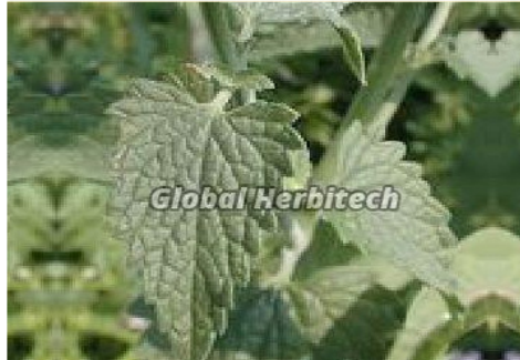
Nepeta Cataria Tea