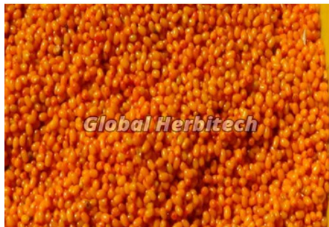
Hippophae Rhamnoides Tea