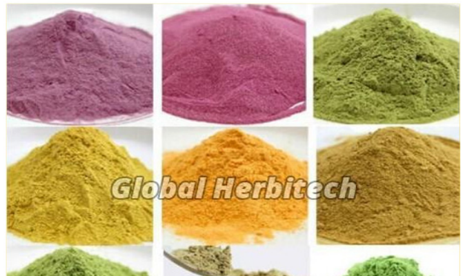
Fruit Juice Powder