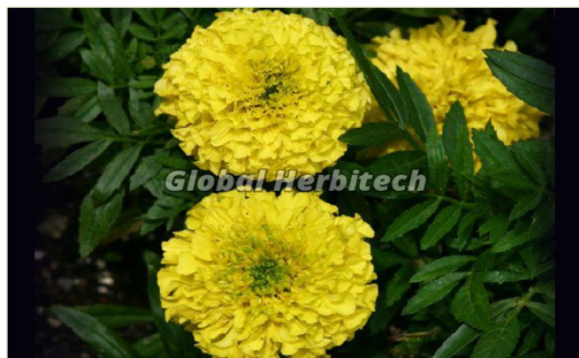
Calendula Tagete Flower