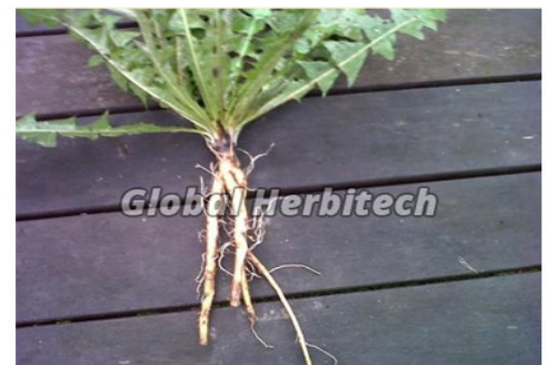
Taraxacum Officinale Tea