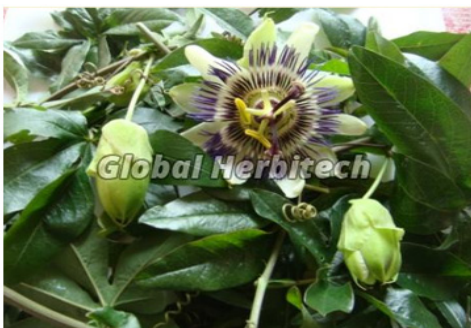
Passiflora Incarnata Tea