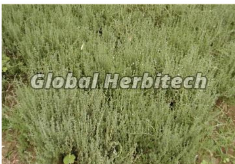
Thymus Serpyllum Tea