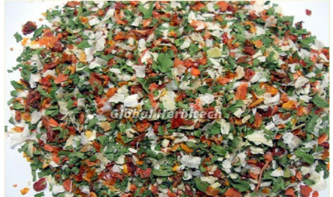
Dehydrated Mixed Vegetables