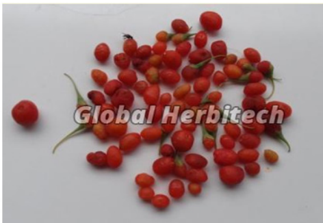
Goji Berry Tea