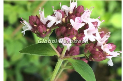
Origanum Vulgare Tea