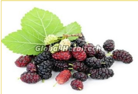
Morus Alba Tea