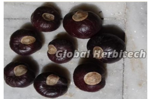
Horse Chestnut Tea