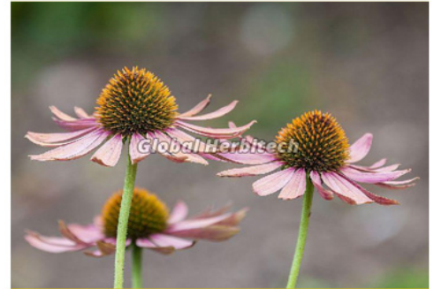
Echinacea Purpurea Tea