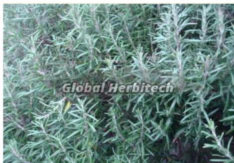
Rosmarinus Officinalis Tea