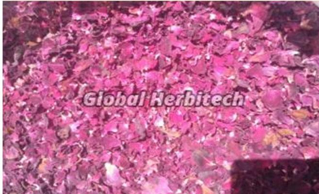
Rosa Damascena Flower