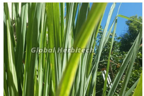
Lemongrass Leaves & Rhizome Tea