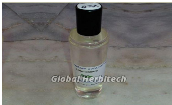
Virgin Coconut Oil