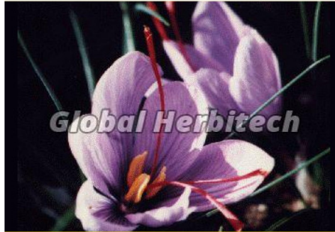
Crocus Sativus Tea