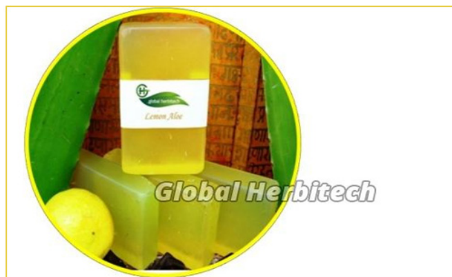
Natural Herbal Soaps