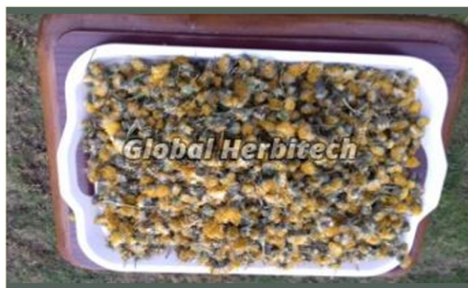
Dandelion Dry Flower