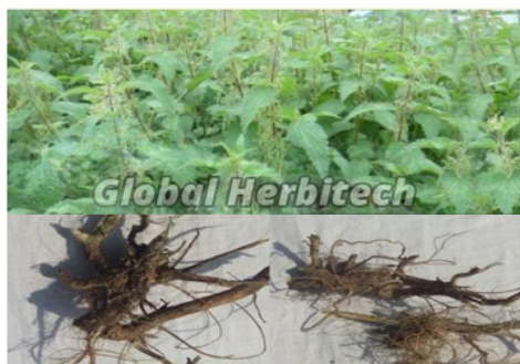
Urtica Dioica Tea