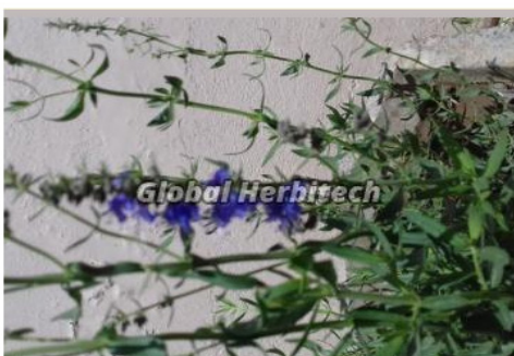
Hyssopus Officinalis Tea