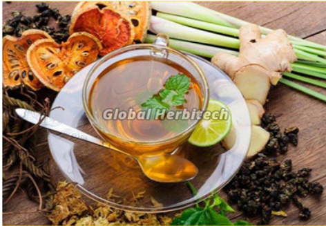
Instant Herbal Tea