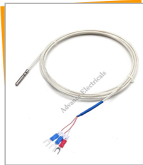
PT100 Temperature Sensor