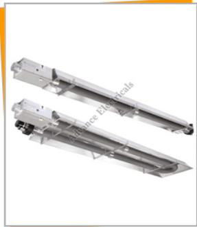
Radiant Tube Heaters