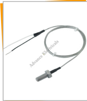
M6 Bolt Type Thermocouple