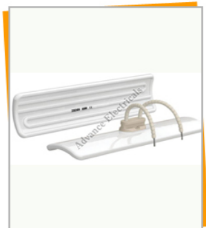
Ceramic Infrared Heaters