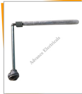
Molten Aluminum Thermocouples