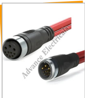
Over Mold Male Connector