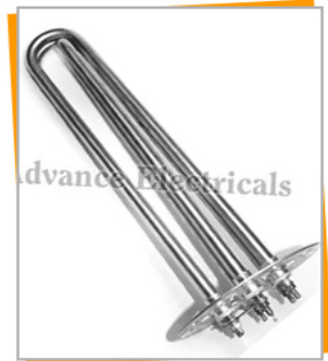
Hopper Dryer Heater