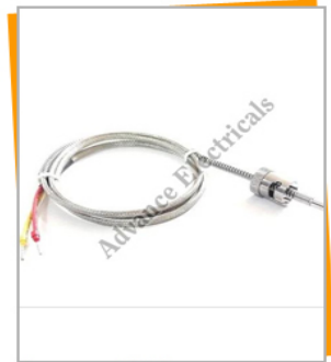
Rotating Holder Thermocouple