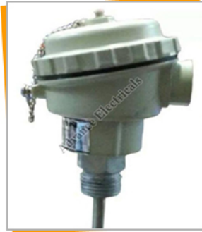
Head Type Thermocouple