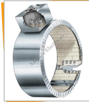
Ceramic Band Heaters