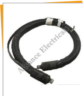
Hose Pipe Heaters