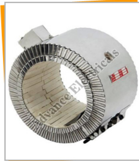
Power Saving Ceramic Band Heaters