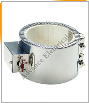
Ceramic Nozzle Heaters