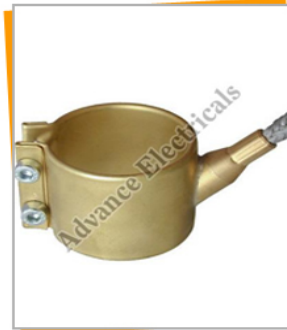
Sealed Mica Nozzle Heaters