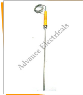
K Type Hand Held Temperature Thermocouple