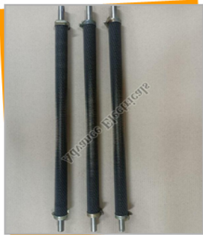
Finned Tube Air Heater