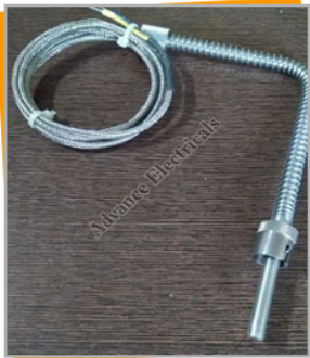
L Type Adjustable Thermocouple