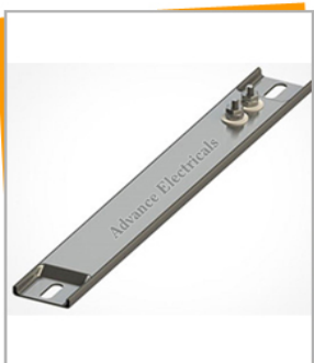
Ceramic Strip Heater