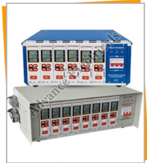
Hot Runner Temperature Controllers