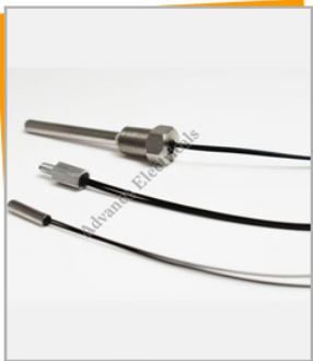
NTC Temperature Sensor