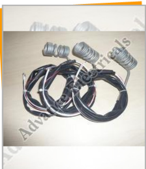
Micro Coil Heaters