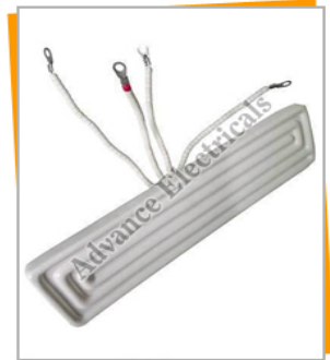
Ceramic IR Heater