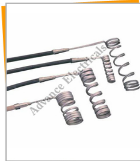
Hot Runner Coil Heater