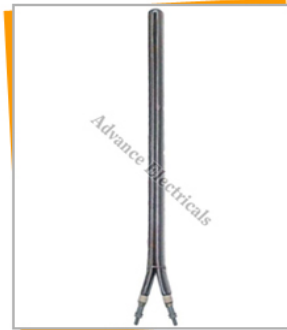
D Shape Split Cartridge Heaters