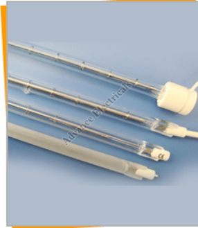
Silica Infrared Tube Heaters