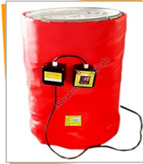
Flexible Jacket Type Drum Heater