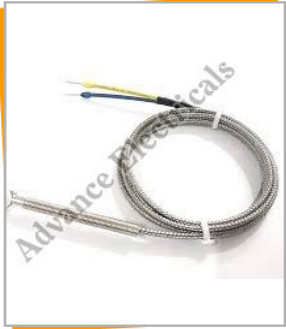
Button Type Thermocouple