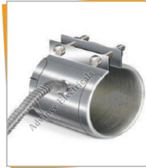
Aluminium Nozzle Heater