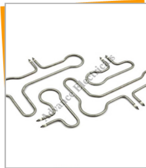
Flexible Manifold Heaters