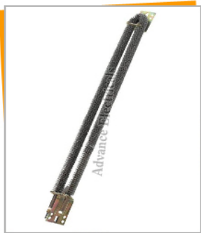
I Shape Finned Tubular Heaters