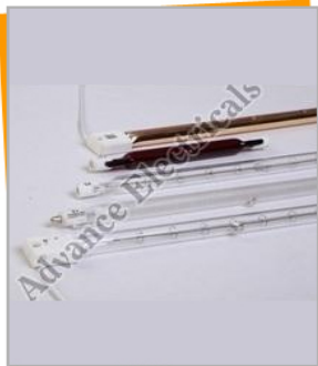
Panel Space Heaters