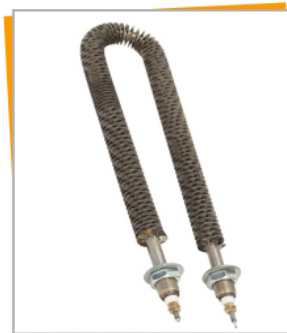
Tubular U Shape Finned Heater