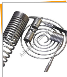
Sealed Coil Heater