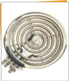
Hot Plate G Coil Heater