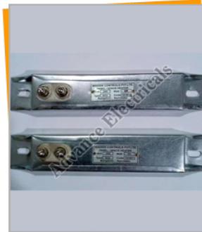
Strip Type Panel Heater