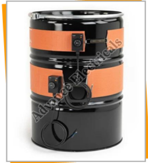
Silicone Rubber Drum Heaters