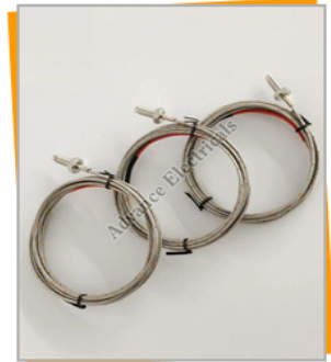
Nozzle Ring Thermocouple