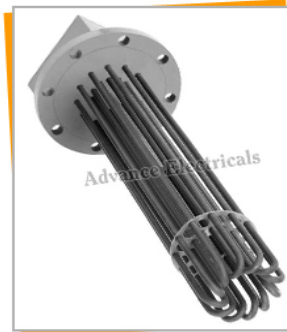
Flange Type Immersion Heaters