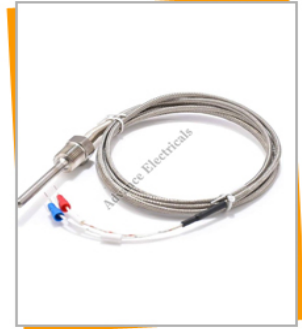
K Type Thermocouple Wire