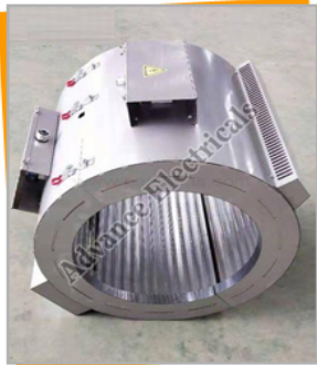
Nano Infrared Band Heaters