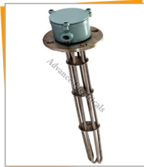
Flame Proof Heaters