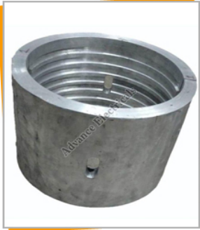
Aluminium Casted Band Heaters