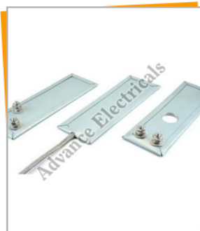
Mica Strip Heater