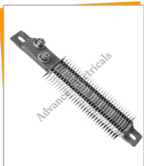
Finned Strip Heater