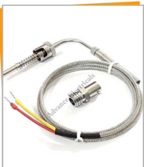
Thermocouple Spring Loaded Bayonet