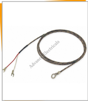
Lug Type Thermocouple