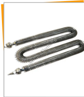
M Shape Finned Tubular Heaters