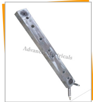
Aluminium Strip Heater