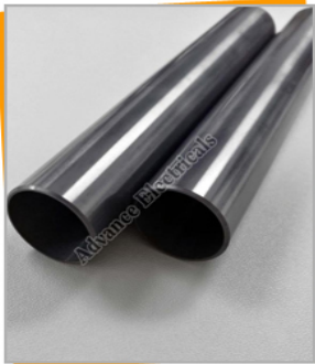
Silicon Nitride Ceramic Rod