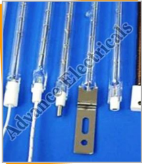
Quartz Infrared Heaters