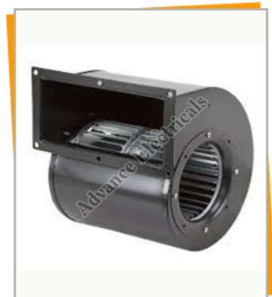
Double Inlet Blowers