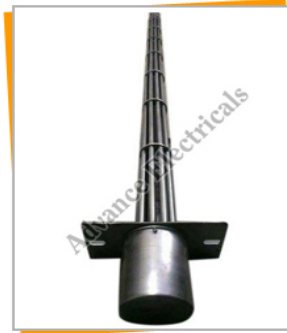
Corrugation Machine Heaters