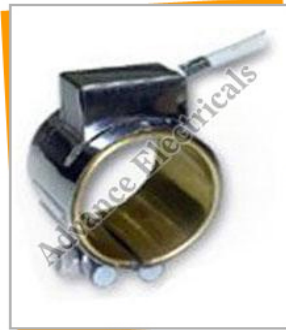
Mica Nozzle Heaters