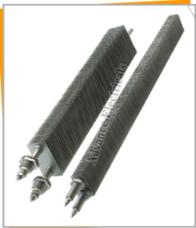
Double Tube Air Finned Heaters