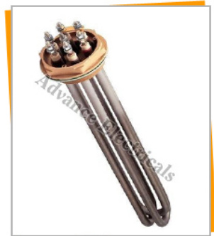
Oil Immersion Heaters