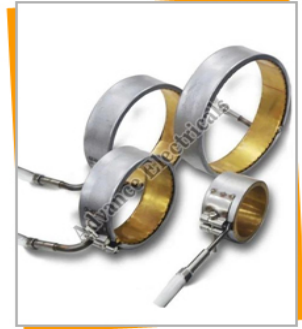
Brass Nozzle Heater