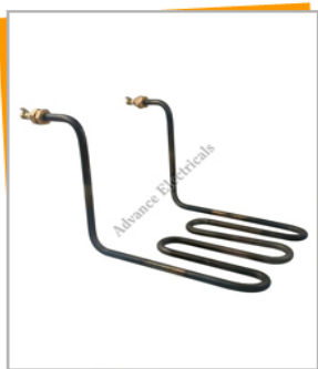
Stainless Steel Deep Fryer Heater