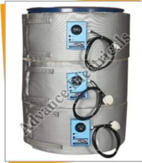
Ceramic Bass Drum Heater