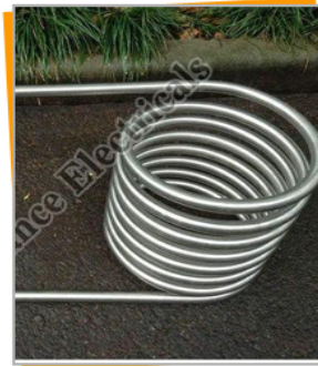
Aluminium Coil Heaters