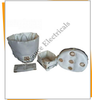
Energy Saving Insulation Jackets