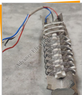
Hot Air Gun Heaters