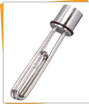
Chemical Immersion Heaters