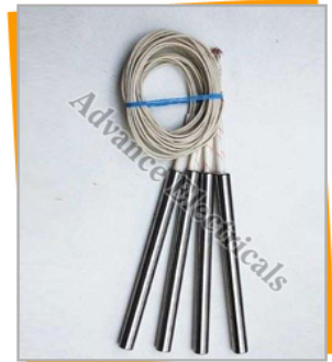
High Density Cartridge Heaters