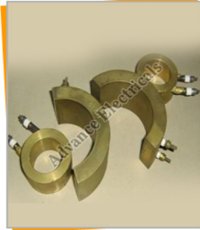
Brass Casted Band Heaters