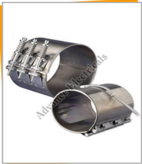
Mica Band Heaters