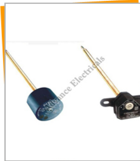
Stem Type Thermostat