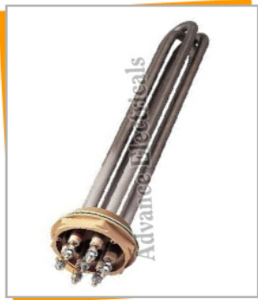
Bain Marie Heaters