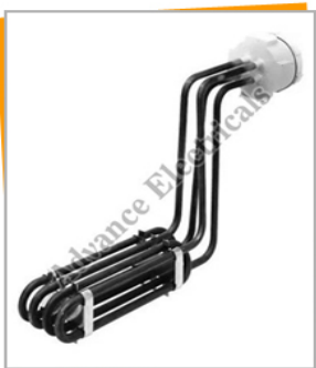
Over the Side Immersion Heater