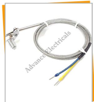
Butterfly Bolt Type Thermocouple