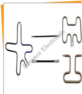
Tubular Manifold Heaters