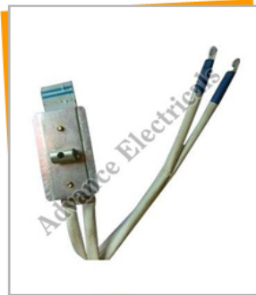
Box Strapping Machine Heater