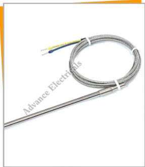
Pencil Type Thermocouple