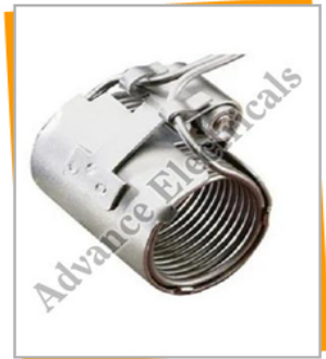
Axial Clamp Coil Heaters