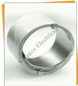
Aluminium Band Heaters