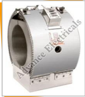
Blower Jackets for Band Heaters