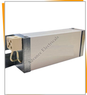
Box Type Panel Heater