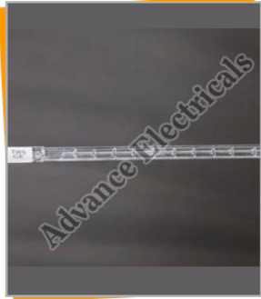
Short Wave Infrared Heater