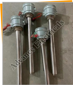
Lead Covered Heaters