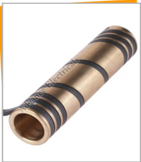
Brass Coil Heaters