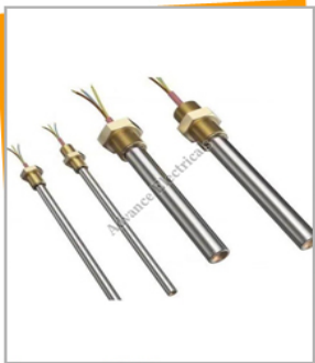
Low Density Cartridge Heater