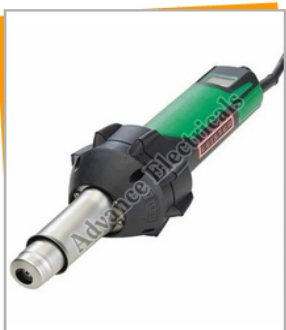
Leister Hot Air Gun Heater