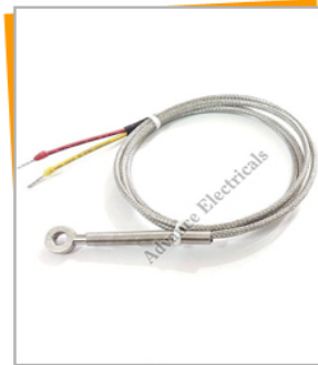
Ring Washer Type Thermocouple