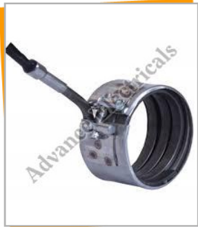
Coil Nozzle Heaters