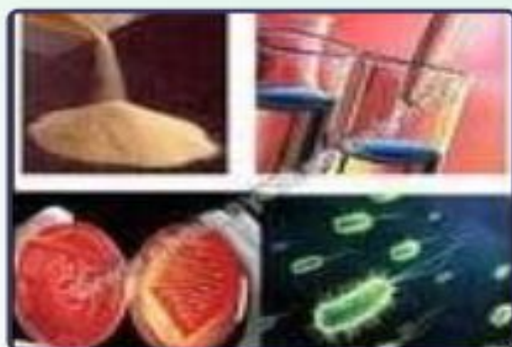
Tryptone & Tryptose