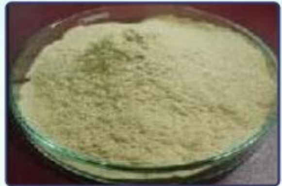
Mineral Enriched Yeast