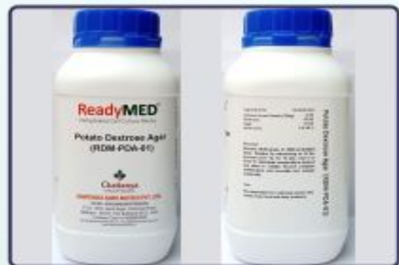
Potato Dextrose Agar