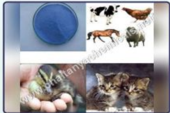
Protein Digest-Amino Acid Chelates (Mineral Proteinate)