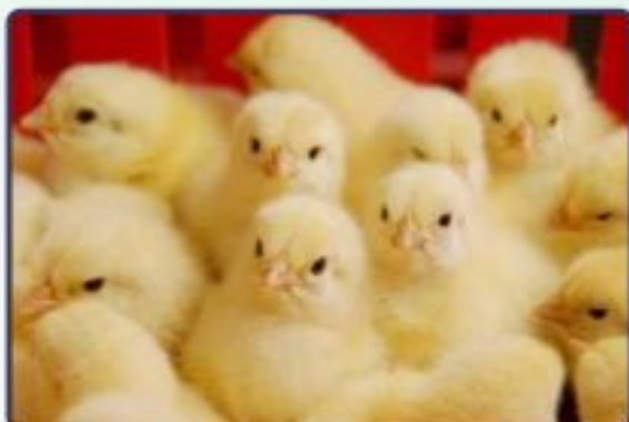
Protein Digest-NutriMin (Mutli Mine Formulati)