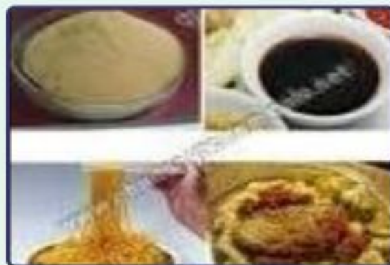
Yeast Extract Powder