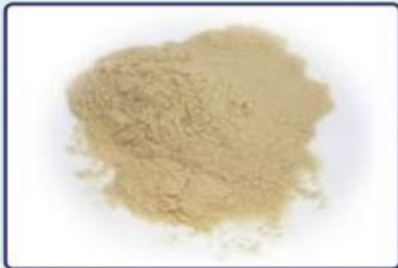
Malt Extract Powder