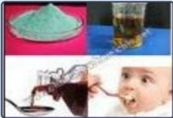
Protein Hydrolysate Powder