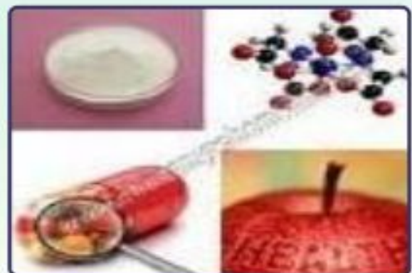
Amino Acid Chelates