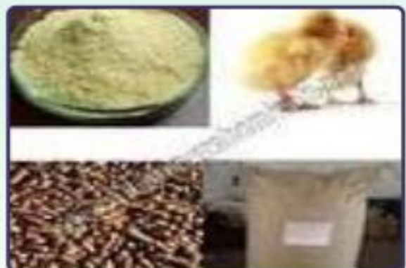
Mineral Enriched Yeast