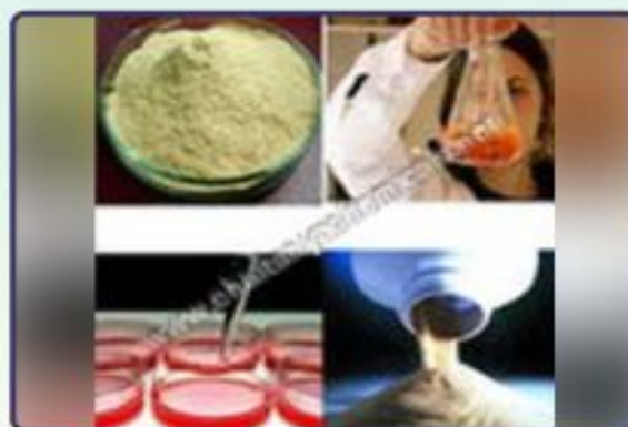
Pancreatic Digest of Casein & Gelatin