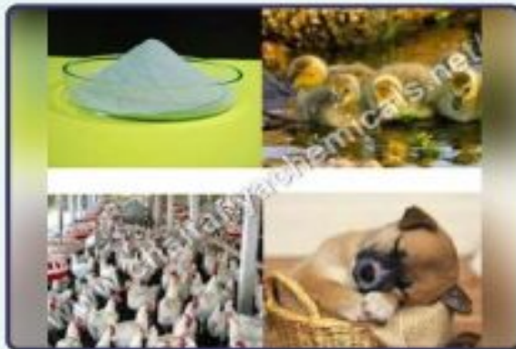
Protein Digest-Amino Acid Chelates (Mineral Glycinate)