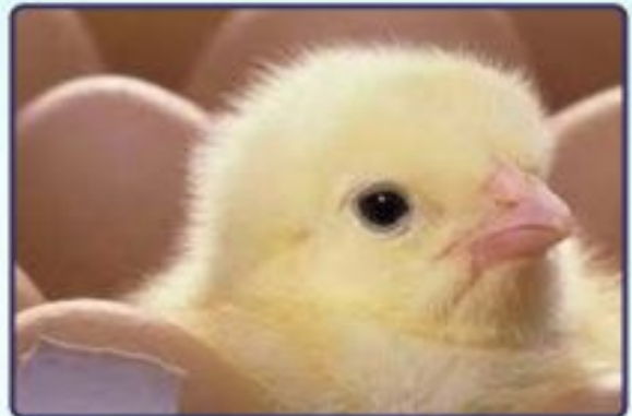
Protein Digest (Hydroly Protein Powder)