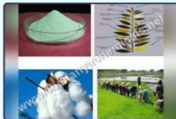
Prota-Min (Single Micronutrient Amino Acid Based Chelates)