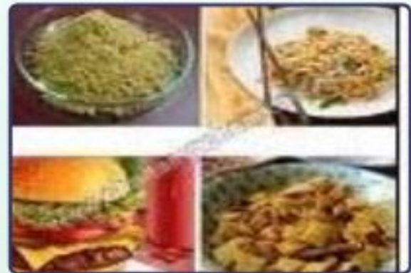
Hydrolyzed Vegetable Protein (HVP)