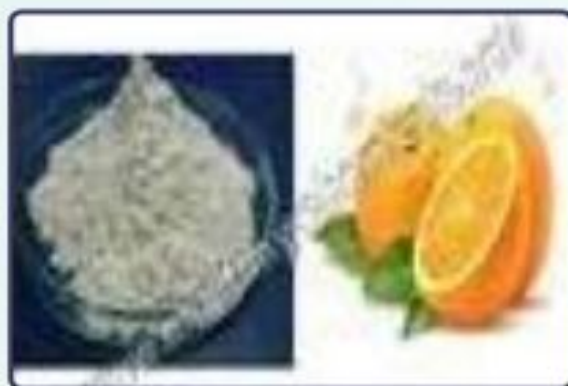
Sodium Ascorbate & Zinc Ascorbate