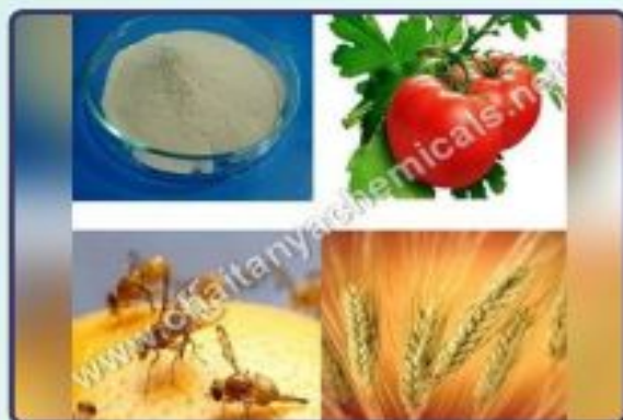
Protune (Amino Acid Mixture) Powder