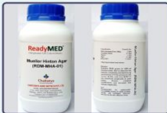
Muller Hinton Agar