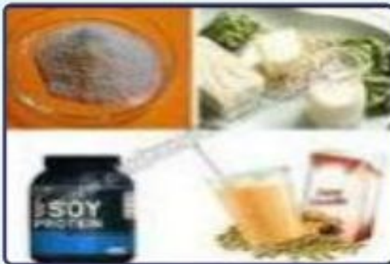
Soya Isolate Concentrate