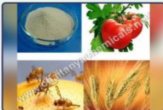
Amino Acid Mineral Chela (Mine Glycinate)