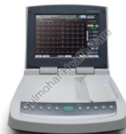
ECG-2450 ECG MACHINE