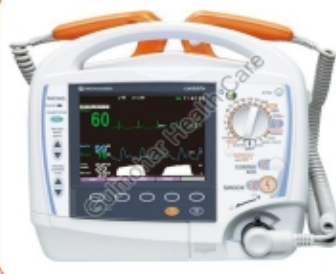
TEC-5600 SERIES MEDICAL DEFIBRILLATOR