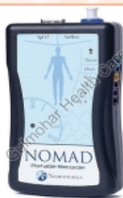
NOMAD HOME TESTING DEVICE