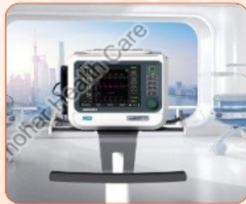
HAMILTON-C1 Neo ICU VENTILATOR