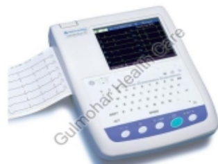
ECG-1250 ECG MACHINE