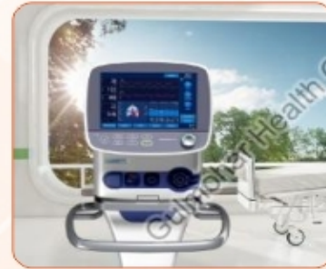
HAMILTON-C3 ICU VENTILATOR