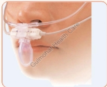
MAINSTREAM CO2 SENSOR KIT