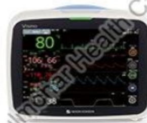
PVM-4700 SERIES BEDSIDE MONITOR