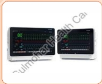
G5 CSM-1500 BEDSIDE MONITOR