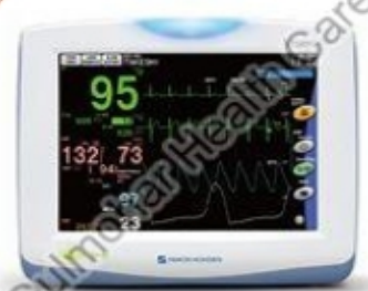
PVM-2701 BEDSIDE MONITOR