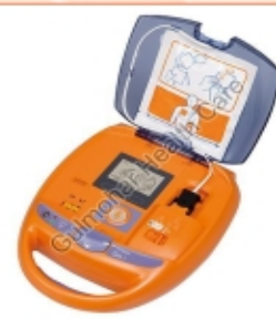
AED-2152K AUTOMATED EXTERNAL DEFIBRILLATOR