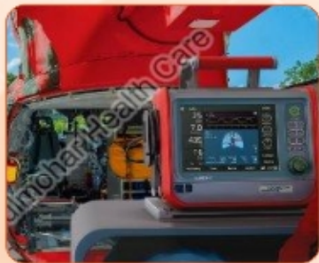
HAMILTON-T1 ICU VENTILATOR