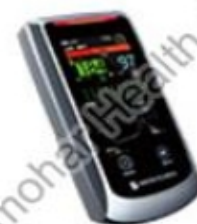
GZ-130P VITAL SIGN TELEMETER