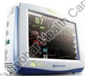
PVM-2703 BEDSIDE MONITOR