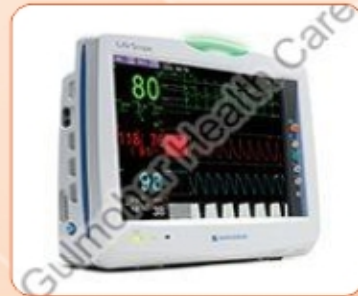
VS BSM-3000 BEDSIDE MONITOR