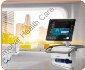
HAMILTON-C6 ICU VENTILATOR