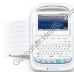
ECG-2350 ECG MACHINE