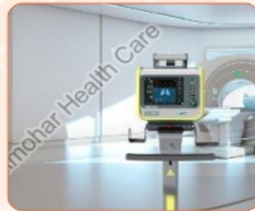
HAMILTON-MR1 ICU VENTILATOR