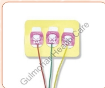
VITRODE N DISPOSABLE ELECTRODE