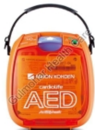
AED-3100K AUTOMATED EXTERNAL DEFIBRILLATOR