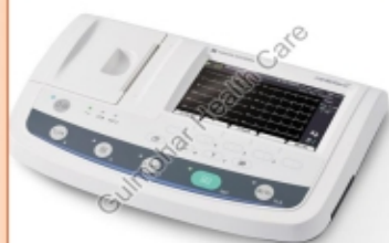
ECG-3150 ECG MACHINE