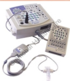
POLYSMITH SLEEP SYSTEM