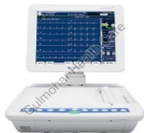
ECG-2550 ECG MACHINE