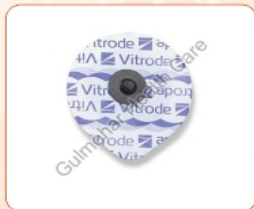
VITRODE DISPOSABLE ELECTRODE