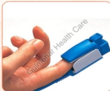
REUSABLE SpO2 PROBE