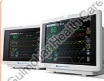
SVM-7500/7600 SERIES BEDSIDE MONITOR