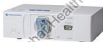
GF-210R/220R BEDSIDE MONITOR