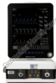
NKV-550 MECHANICAL VENTILATOR