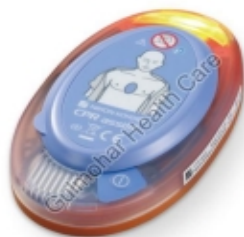
CARDIAC RESUSCITATION DEVICE