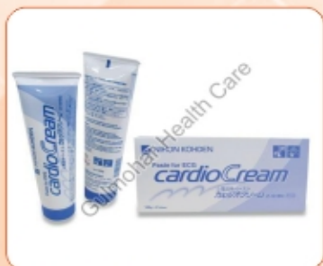
CARDIO CREAM PASTE