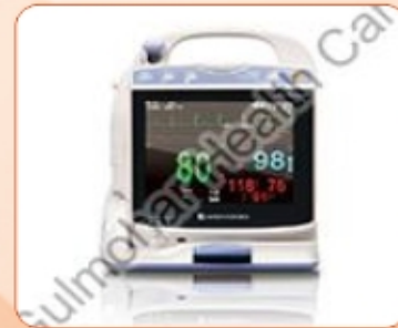
PT BSM-1700 BEDSIDE MONITOR