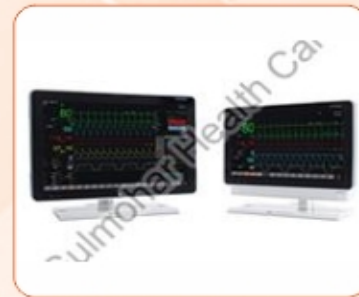
G7 CSM-1700 BEDSIDE MONITOR