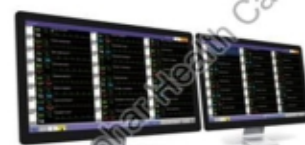
CNS-9101 CENTRAL MONITOR