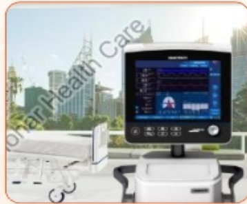
HAMILTON-S1 ICU VENTILATOR