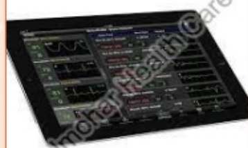
QP-983P CENTRAL MONITOR