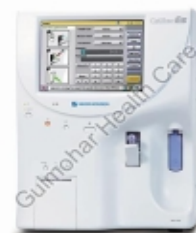
MEK-7300 HEMATOLOGY ANALYZER