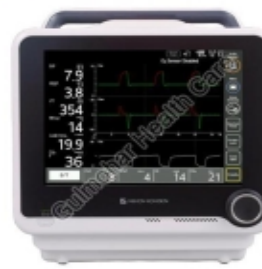
NKV-330 MECHANICAL VENTILATOR