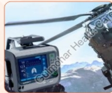
HAMILTON-T1 MILITARY ICU VENTILATOR