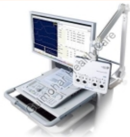
S3 MEB-9600 EVOKED POTENTIAL EMG