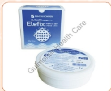
NEUROLOGY PASTE AND GEL