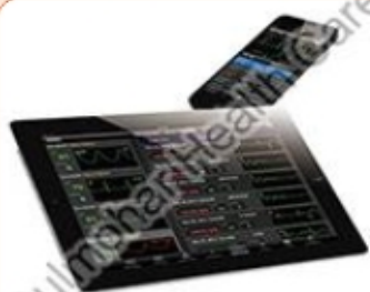
QP-988P/989P CENTRAL MONITOR