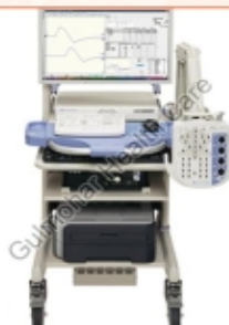
X1 MEB-2300 EVOKED POTENTIAL EMG