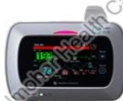
GZ-140P VITAL SIGN TELEMETER