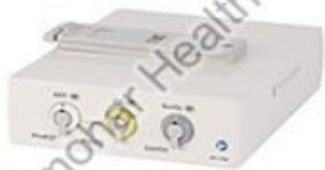
AP-170P BEDSIDE MONITOR