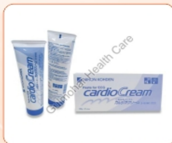
CARDIO CREAM PASTE