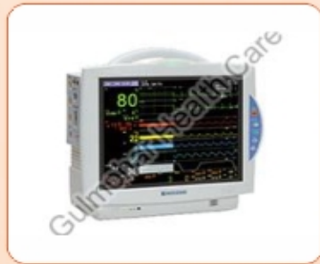
TR BSM-6000 BEDSIDE MONITOR