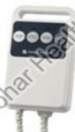
AF-101P BEDSIDE MONITOR