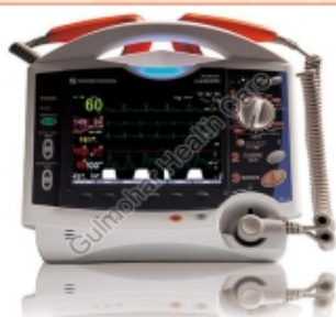
TEC-8300 SERIES MEDICAL DEFIBRILLATOR