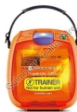
TRN-3100 AUTOMATED EXTERNAL DEFIBRILLATOR