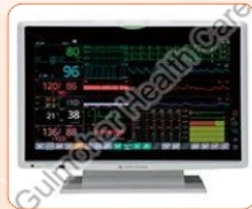
G9 CSM-1901 BEDSIDE MONITOR