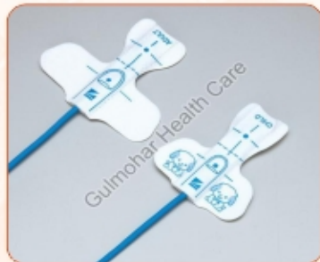
DISPOSABLE SpO2 SENSOR