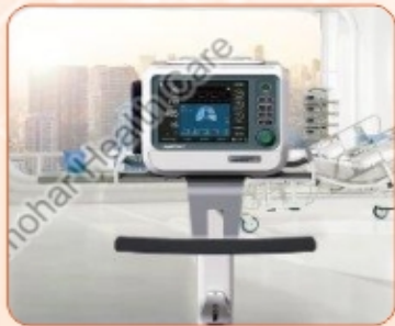
HAMILTON-C1 ICU VENTILATOR