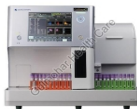
MEK-9100 HEMATOLOGY ANALYZER