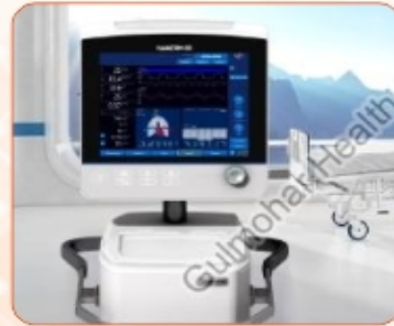
HAMILTON-G5 ICU VENTILATOR