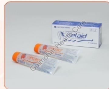
DEFIBRILLATOR PASTE AND GEL