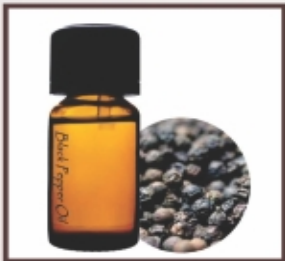
Black Pepper Oil