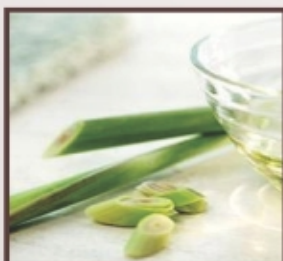
Ginger Grass Oil