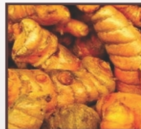
Wild Turmeric Oil