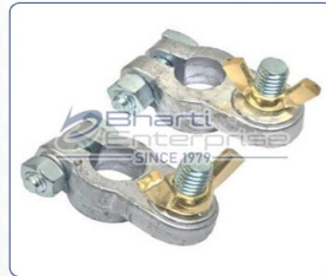
Marine Type Battery Terminal