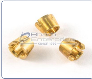
Brass Transmission Fittings