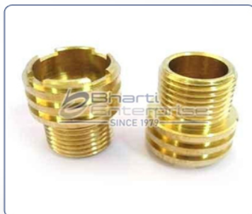
Brass PPR Inserts