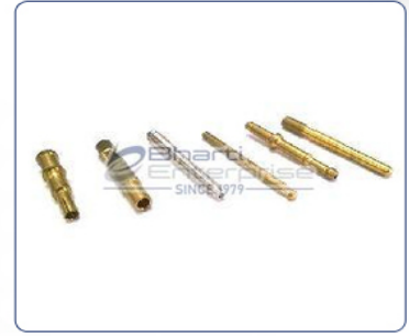
Brass Contact Pins