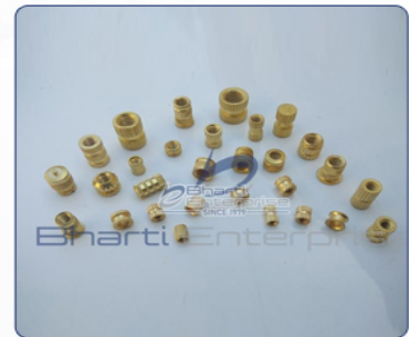
Blind Threaded Inserts