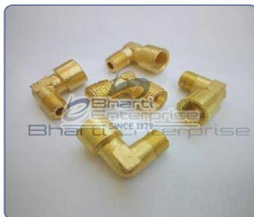
Brass Hose Fittings