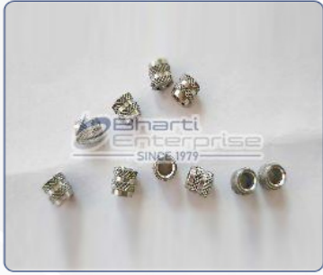
Steel Ultrasonic Inserts