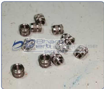
Steel Expansion Inserts