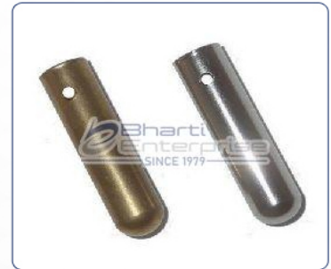
Brass Power Cord Pins