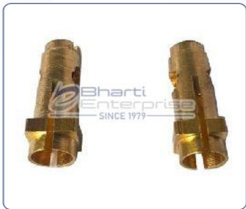
Brass Socket Pins