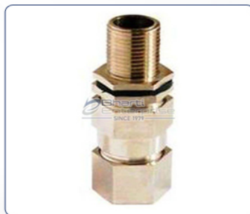
Double Compression Cable Gland