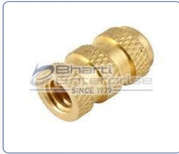
Diamond Knurling Inserts