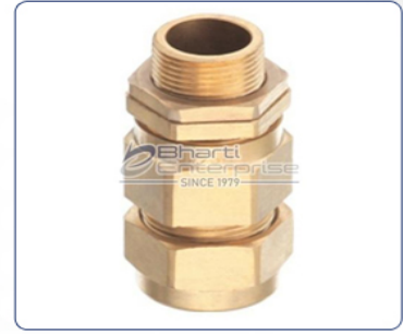
Single Compression Cable Gland