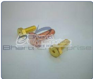
Forged Brass Screws