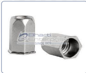
Steel Hexagonal Inserts