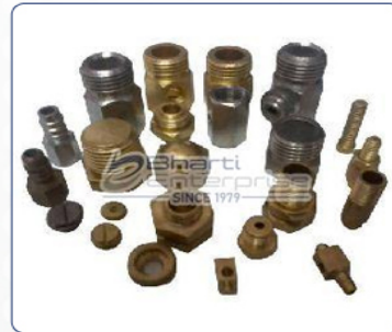
Brass Geyser Parts