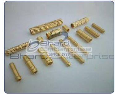
Brass Knurled Pipe