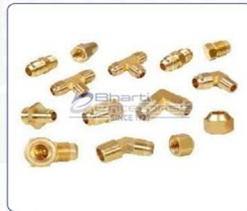
Brass Flare Fittings