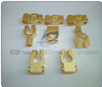
Solder Type Battery Terminal