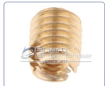
Brass Self Tapping Insert