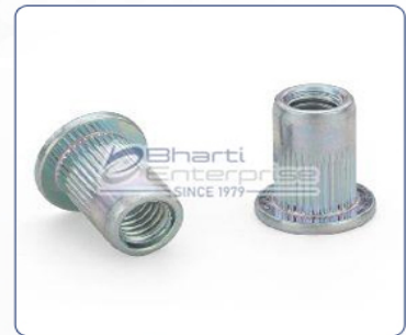
Steel Knurled Inserts