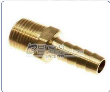
Brass Nipple Pipe