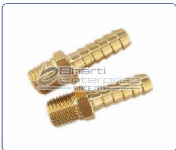
Brass Hose Barb Fittings