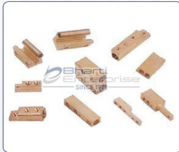
Brass Potential Terminal