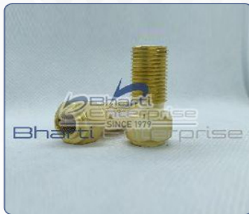
Automobile Brass Switch Parts