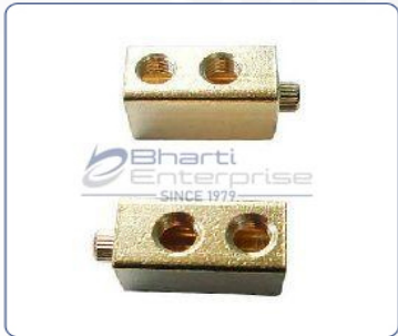
Brass Current Terminal