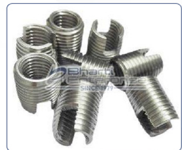
Steel Threaded Inserts