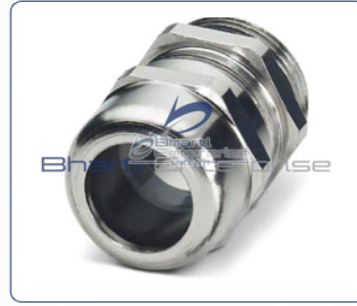
PG Cable Gland