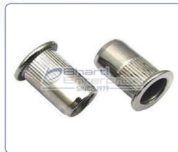
Steel Stand Inserts