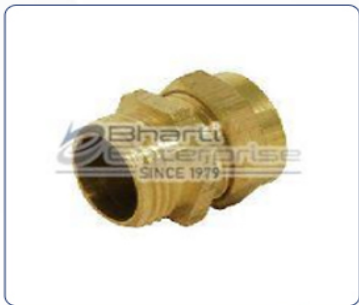
Brass TRS Cable Gland