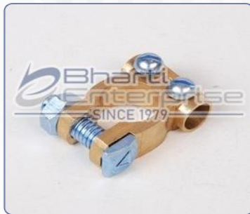
Solderless Battery Terminal