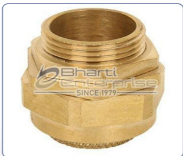
CX/CZ Cable Gland