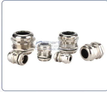
NPT Type Cable Gland