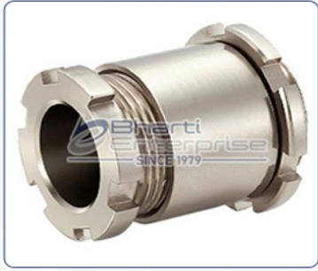
Marine Type Cable Gland