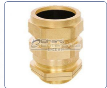
A1/A2 Industrial Cable Gland