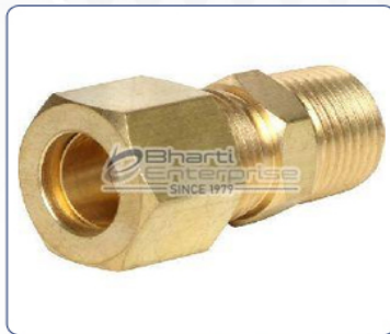
Brass Compression Fittings