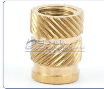
Ultrasonic Brass Insert