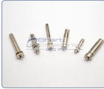
Brass Automotive Pins