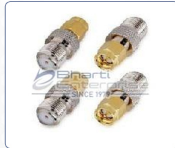
Brass RF Connector