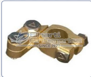
Lucas Type Battery Terminal