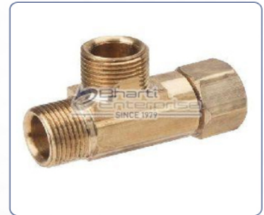
Brass Plumbing Parts