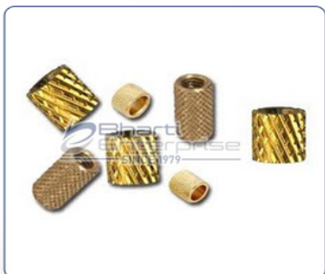
Brass Helical Knurled Inserts