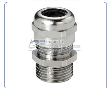
IP68 Cable Gland