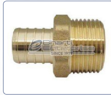
Brass Vibra-Lok Fittings