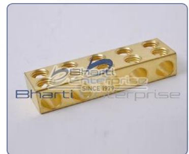
Brass Neutral Links