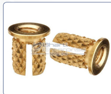
Brass Press-in Insert