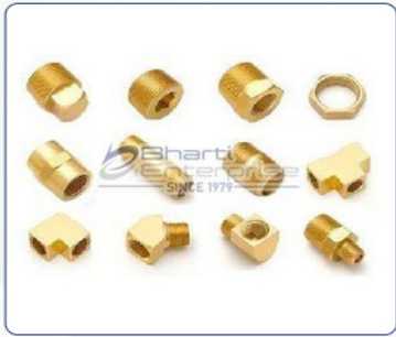
Brass Sanitary Fittings