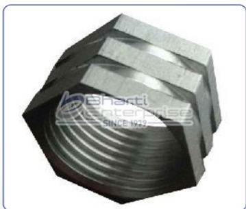
Steel Moulding Inserts