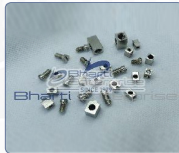
Brass Electrical Switch Parts