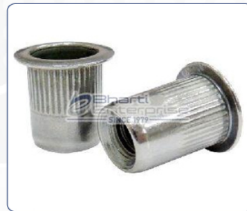
Steel Insert Nuts