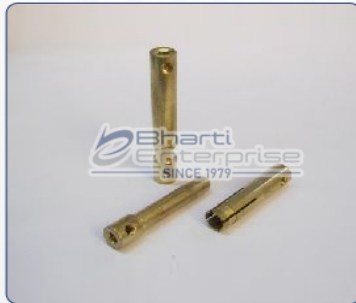
Brass Earth Pins