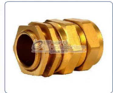
CW Cable Gland