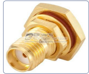
Brass Bulkhead Jack