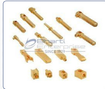
Brass Electrical Plug Pins