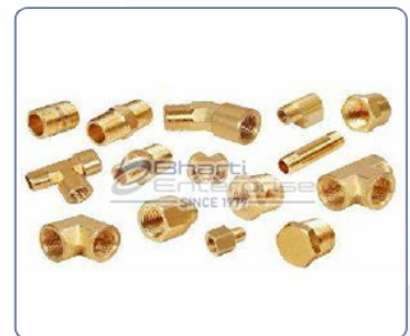
Brass Pneumatic Fittings