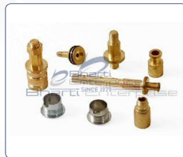
Brass Machined Component