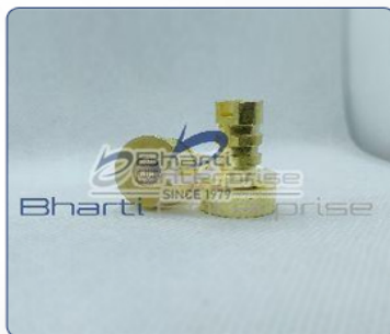
Brass CNC Turned Parts