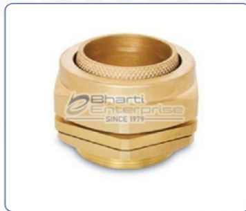
BW Cable Gland