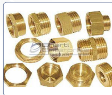
Brass Pipe Fittings