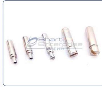
Brass Charger Pins