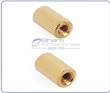
Brass Straight Knurling Insert