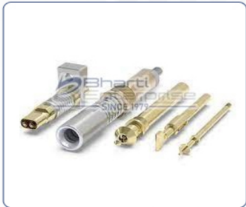
Brass Contact Probes