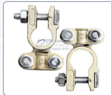
Universal Battery Terminal