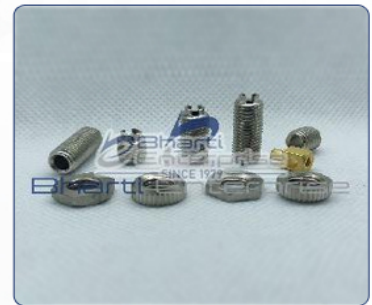
Mechanical Brass Switch Parts