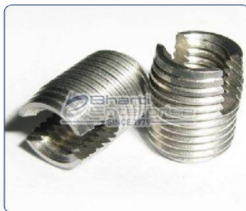
Steel Self Tapping Inserts