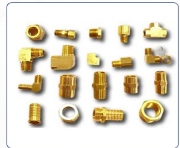
Brass Garden Hose Fittings