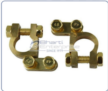
Angle Type Battery Terminal