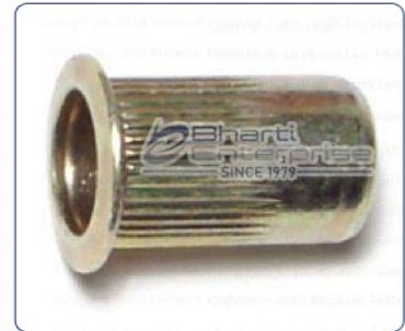
Steel Blind Inserts