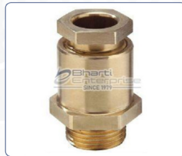
BWL Cable Gland