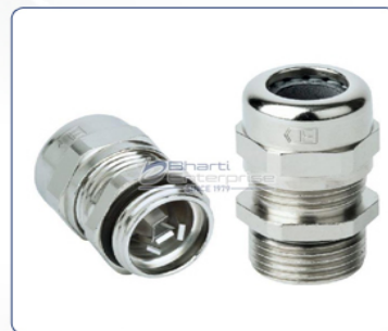
EMC Cable Gland