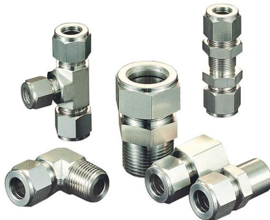
FITTINGS FOR THE BEST CONNECTIONS