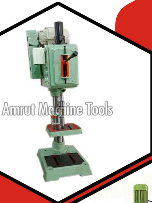
Amrut Machine Tools