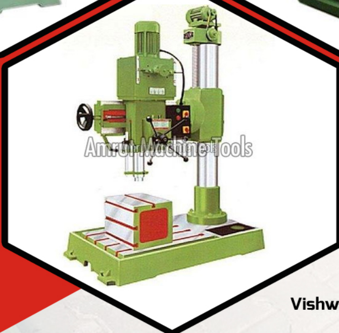
Amrut Machine Tools