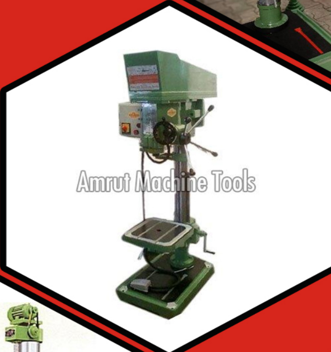
Amrut Machine Tools