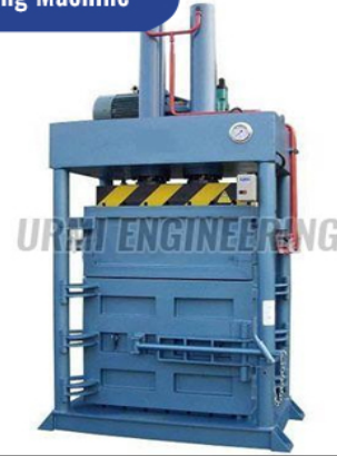
Double Cylinder Baling Machine