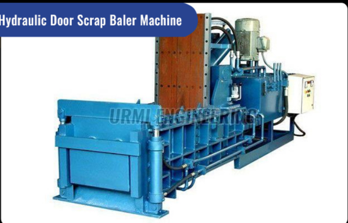
Hydraulic Door Scrap Baler Machine