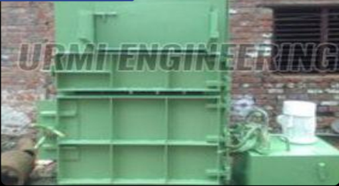
Hydraulic Baling Machine