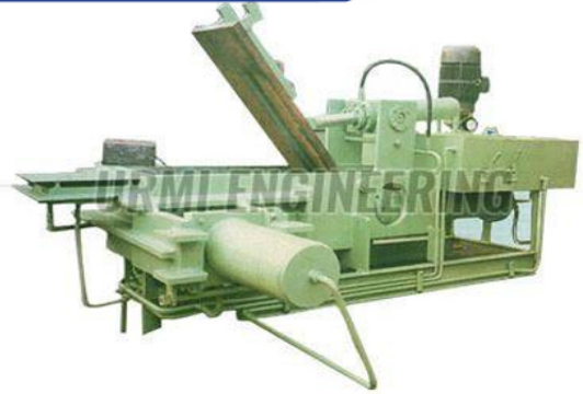
Semi Auto Scrap Baling Press Machine