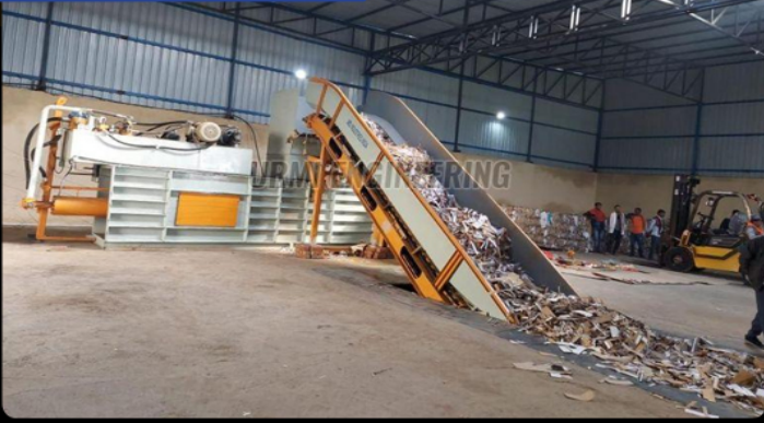
Fully Automatic Baling Machine