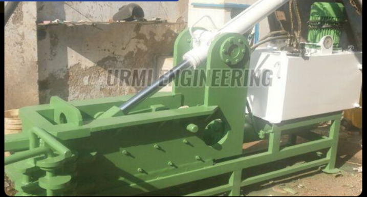
Hydraulic Metal Baling Machine