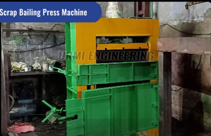
Scrap Bailing Press Machine