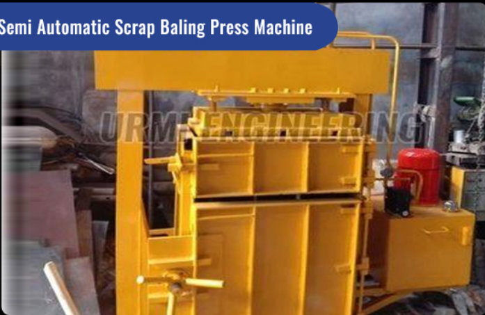
Semi Automatic Scrap Baling Press Machine