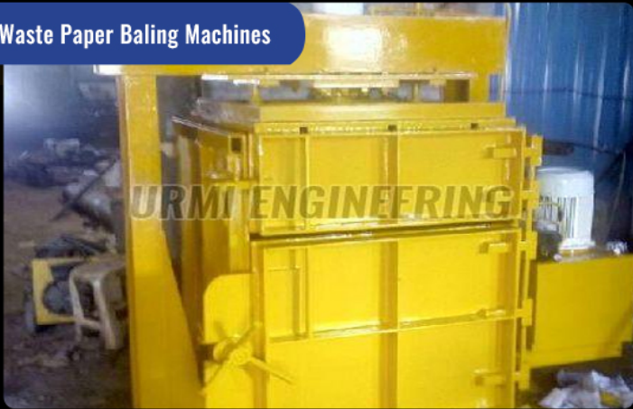
Waste Paper Baling Machines