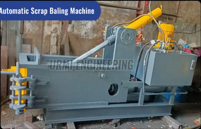
Automatic Scrap Baling Machine