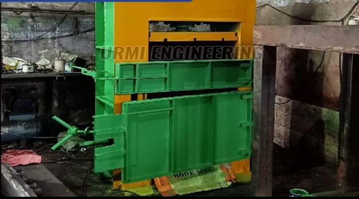
Mild Steel Vertical Baling Machine