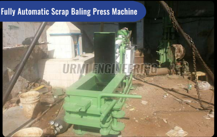
Fully Automatic Scrap Baling Press Machine