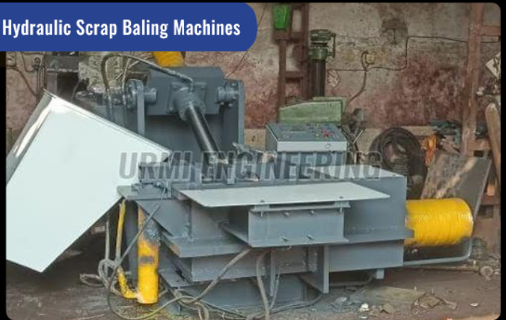
Hydraulic Scrap Baling Machines