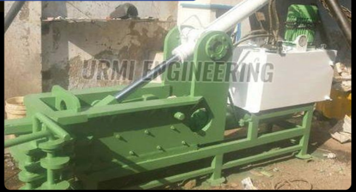
Horizontal PET Bottle Baling Machine