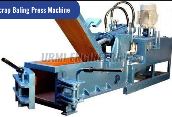
Scrap Baling Press Machine