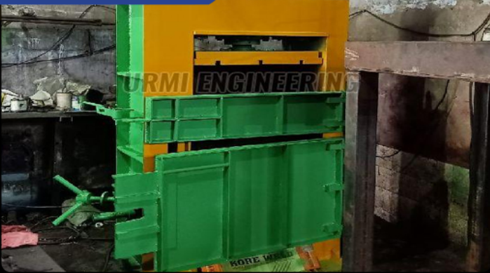
PET Bottle Baling Machines