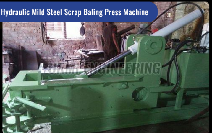
Hydraulic Mild Steel Scrap Baling Press Machine