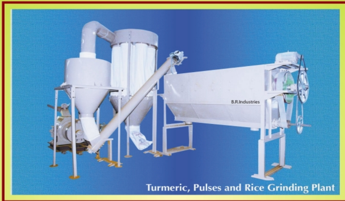
Turmeric, Pulses and Rice Grinding Plant

Consists of 1 No. of Cone Type Pulveriser (Grinder) Grinding all Non abrasive materials upto 300 Mesh. 1Nos Of Screw Conveyor (material lifting from machine to Dresser) and Dresser designed to suit Nylon and steel sieves of different Mesh. Thorough sieving and excellent grading. Plant is Suitable for Turmeric, Urad Dhall, Besan, Dry Ginger, Saw Dust, Coconut Shell, Pharmaceuticals, Chemicals, minerals.