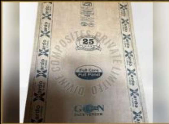
CALIBRATED PLYWOOD HIGH DENSITY MARINE IS 710

"Xhardo Plywood – Where performance meets precision."