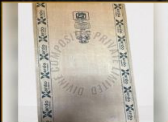
CALIBRATED PLYWOOD MR GRADE IS 303