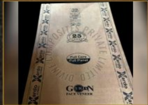
CALIBRATED PLYWOOD MARINE IS 710