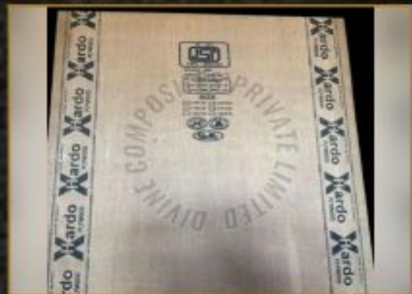
CALIBRATED PLYWOOD OEM SPECIAL MR IS 303