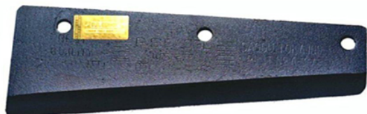
ROTARY SLASHER BLADE