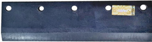
CHAFF CUTTER BLADE