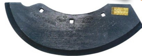
TOKA BLADE KUTTI MACHINE