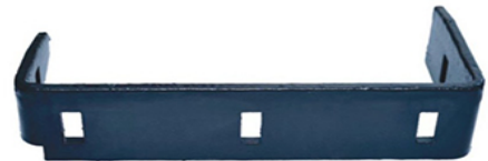
SHAKTIMAN MAKKA CHAFF CUTTER MACHINE HEAD