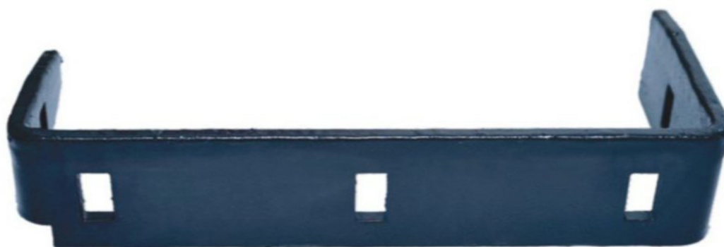
SHAKTIMAN MAKKA CHAFF CUTTER MACHINE HEAD