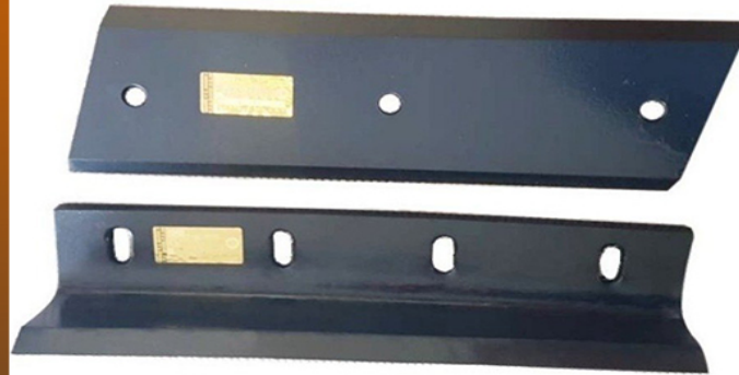
CHOKRYA MACHINE BEALR BLADE