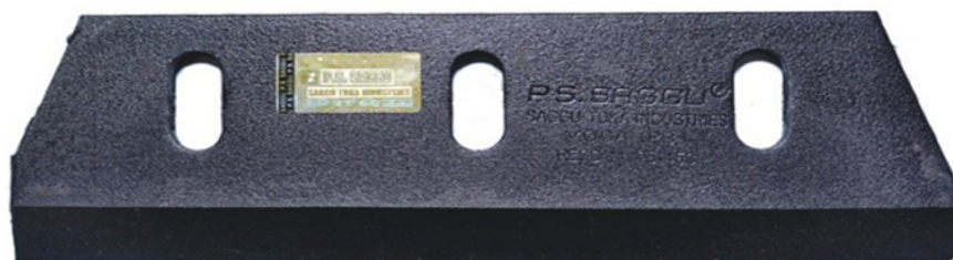
MAKKA CHAFF CUTTER BLADE