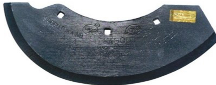
TOKA BLADE KUTTI MACHINE