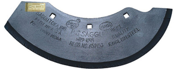
TOKA BLADE HARAMBA THRESHER