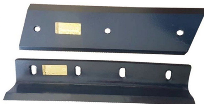
CHOKRYA MACHINE BEALR BLADE