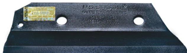
MAKKA CHAFF CUTTER BLADE