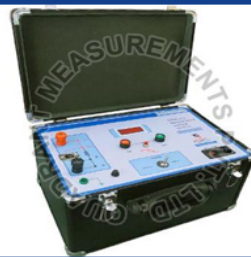
Contact Resistance Meter without Printer