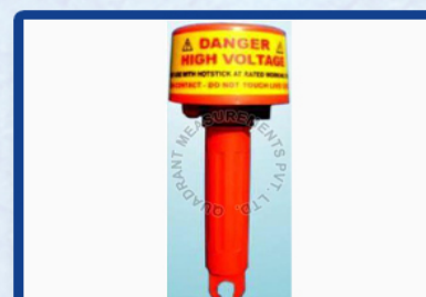
Non Contact HV Detector