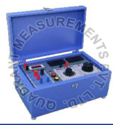
20 Amp Relay Test Kit