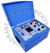
3 Phase Relay Test Kit