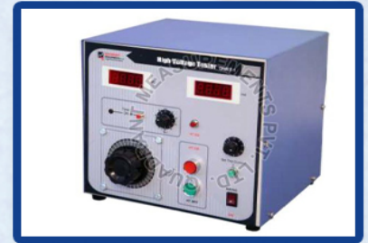
QHBT High Voltage Tester