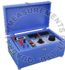
QRTK1 Relay Test Kit