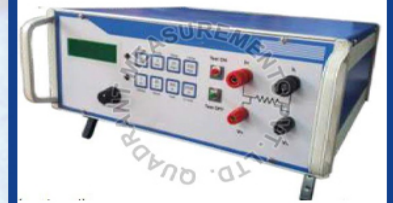
QTWRM-10 Transformer Winding Resistance Meter