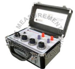
QTRS-1 Transformer Turn Ratio Meter