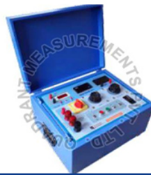
100 Amp Relay Test Kit