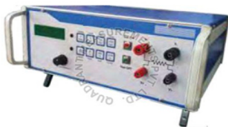
QTWRM-10D Transformer Winding Resistance Meter