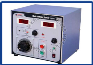
QHBT-1 High Voltage Tester