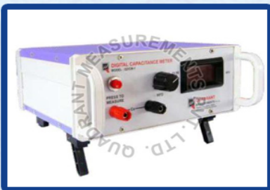
QDCM1 Capacitance Meter