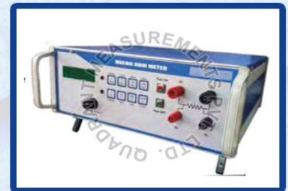
QRM-10 Micro Ohm Meter