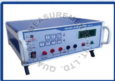
QRM-1S 1 Amp. Micro Ohm Meter