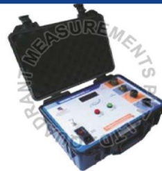
QTRM-3 Transformer Turn Ratio Meter