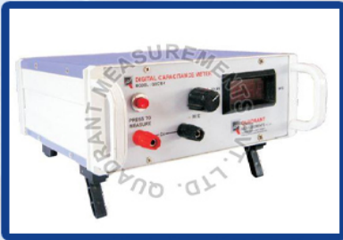
Digital Capacitance Meter