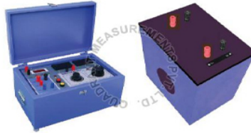
QPIK1 Primary Injection Kit