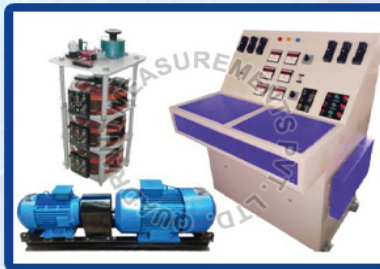
Double Voltage & Frequency Test Bench