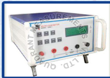
QRM-1 2 Amp. Micro Ohm Meter