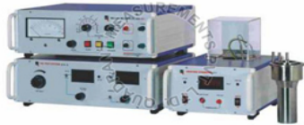
QOTS-M Oil Test System