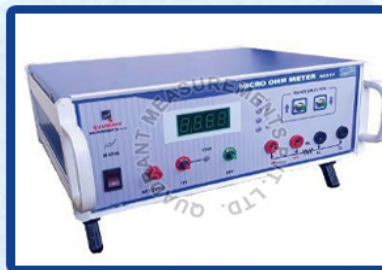
53-C Plus 1 Amp. Micro Ohm Meter