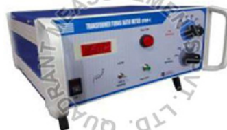
QTTR-3 Transformer Turn Ratio Meter