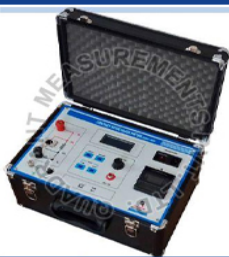
Contact Resistance Meter with Printer