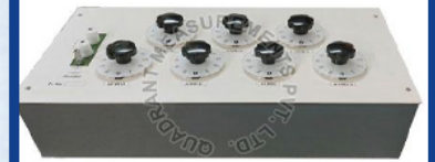
Insulation Resistance Meter