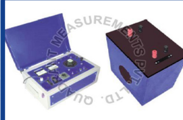
CT Type Primary Injection Kit