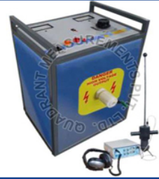
16KV Cable Fault Locator