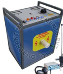
4KV Cable Fault Locator