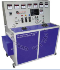
QDPIK1 Primary Injection Kit