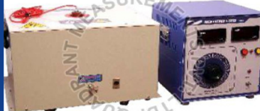
30kv 30mA High Voltage Tester