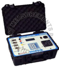
QCBT-1 Circuit Breaker Timer Kit