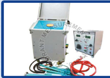
AC-DC High Voltage Tester