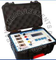
QCBT-2 Circuit Breaker Timer Kit