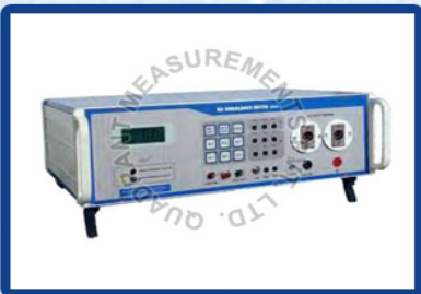
RC Unbalance Meter