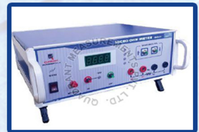
53-C Plus 3 Amp. Micro Ohm Meter