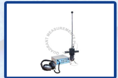
Surge Wave Receiver