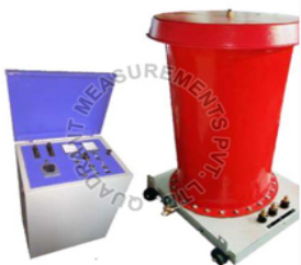
100kv 10mA High Voltage Tester