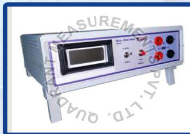
QRM-1S 2 Amp. Micro Ohm Meter