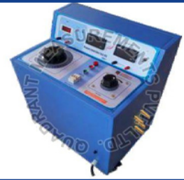
Single Unit Primary Injection Kit