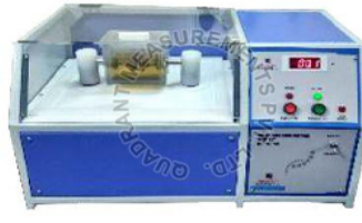
Manual Oil Insulation Test Set