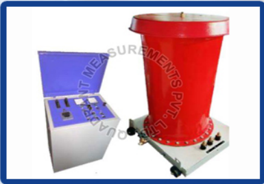
70kv 40mA High Voltage Tester

QUADRANT MEASUREMENTS Pvt. Ltd. Simplified Measurements Solutions