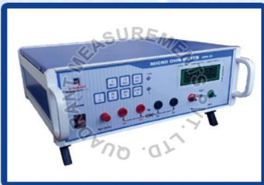
QRM-1 1 Amp. Micro Ohm Meter