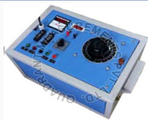
1500 Amp. Primary Injection Kit