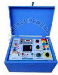
QRTK3 Relay Test Kit