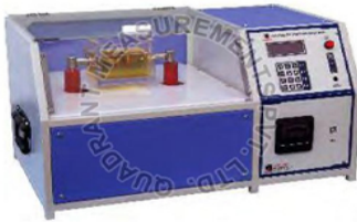
Automatic Oil Insulation Test Set