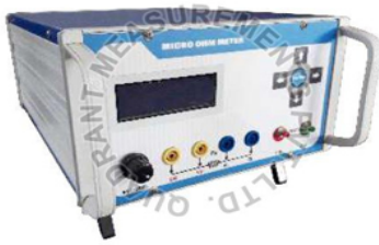
QRM1T Micro Ohm Meter

QUADRANT MEASUREMENTS Pvt. Ltd. Simplified Measurements Solutions