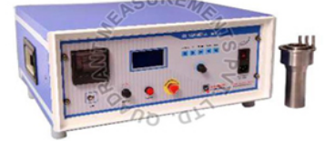
QOTS-A Oil Test System