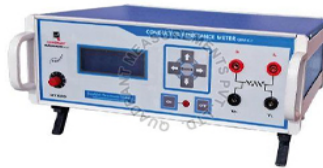
Conductor Resistance Meter