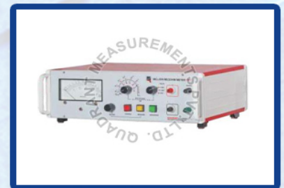
Million Megohm Meter