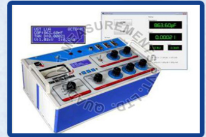
QCTDM Capacitance Meter