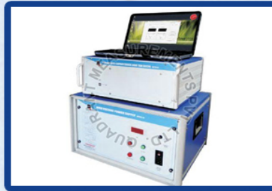
QCTD-A Capacitance Meter