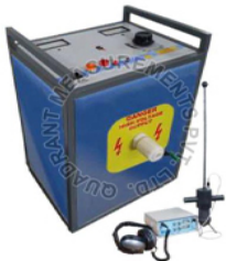
32KV Cable Fault Locator