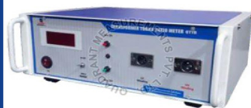
QTTR-1 Transformer Turn Ratio Meter