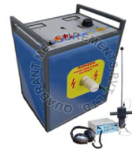
8KV Cable Fault Locator