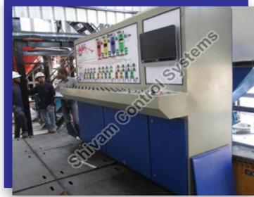
Automatic Batching System