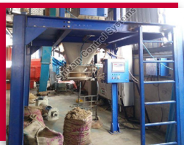
Poultry Feed Packing Machine