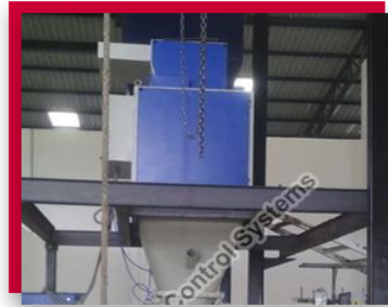
Bag Filling Machine