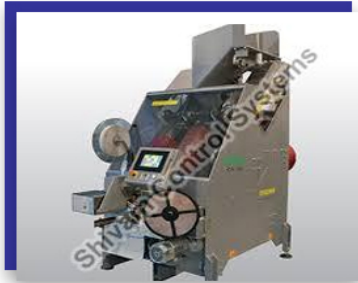
Automatic Net Bagging Machine