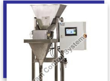
Electronic Automatic Weighing Machine