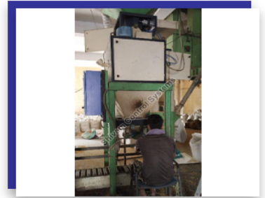
Powder Filling Machine