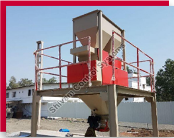
Rice Packing Machine