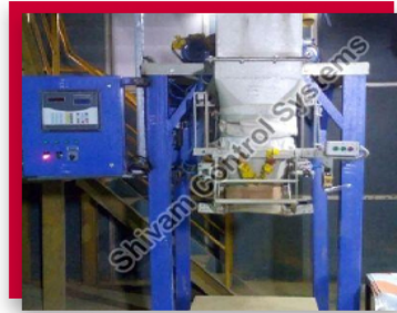
Screw Feeder Gross Bag Filling Machine