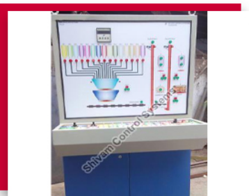
Semi Auto Batching System