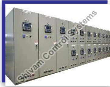
HV & LV Panel