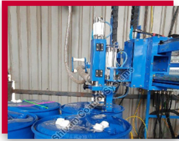
500 Lt Drum Filling Machine