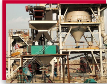
High Speed Bagging Machine