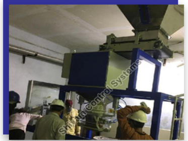
Belt Feeder Bag Filling Machine