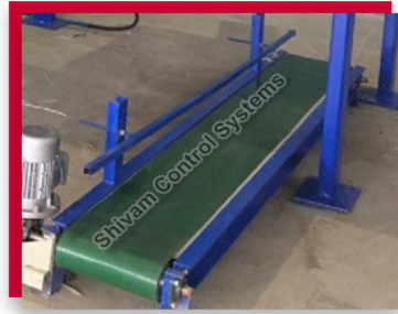
Belt Conveyors And Truck Loaders