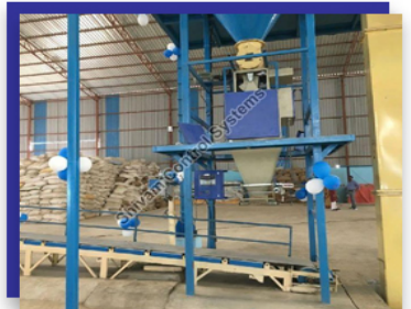
Net Type Gravity Feeder Bag Filling Machine