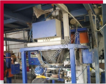
Automatic Bag Filling Machine