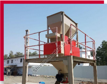
Chemical Bag Filling Machine