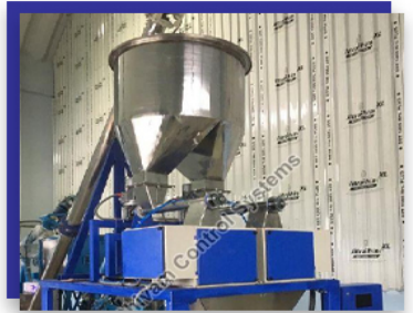
Screw Feeder Net Bag Filling Machine