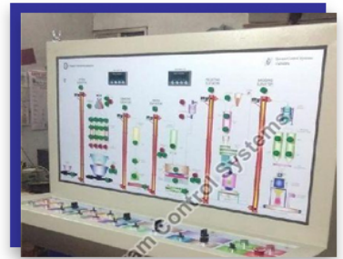
Cattle Feed Plant Automation