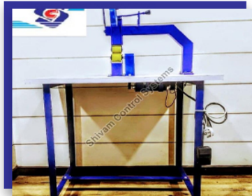
PPE KIT Sealing Machine