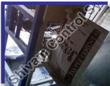
Semi Automatic Gross Bagging Machine