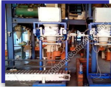
Gross Bagging Machine