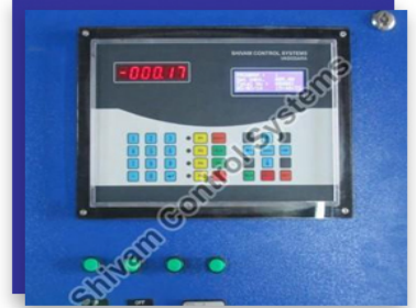
Bag Filling Machine Controller