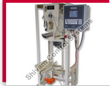
Valve Bagging Machine