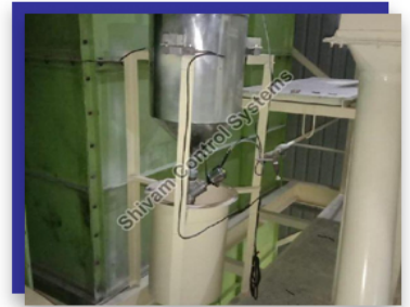
20 to 50 Lt Drum Filling