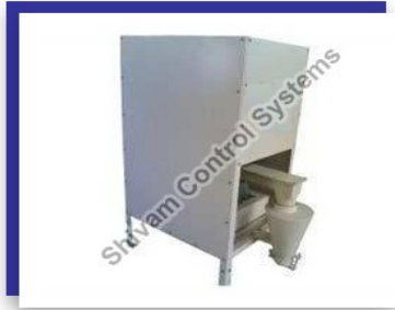
Loss In Weight Feeder