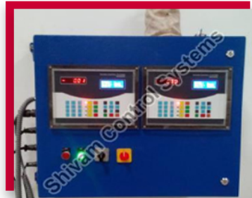
Dual Bagging Controller