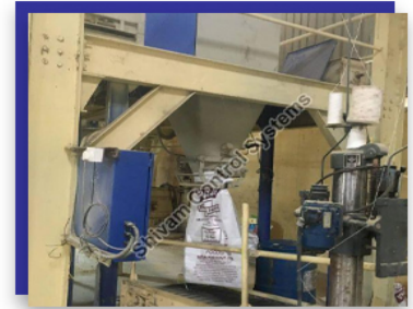
Industrial Bagging Machine