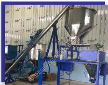
Screw Feeder Conveyors