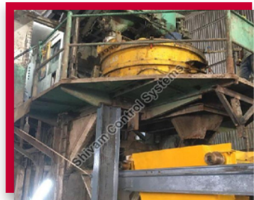
Railway Sleeper Concrete Batching Plant