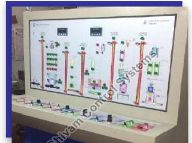
Fish Feed Plant Automation