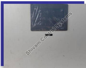
Steam Cycle Control System