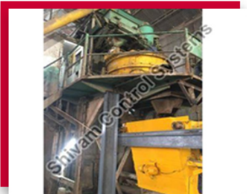
Concrete Batching Plant Automation