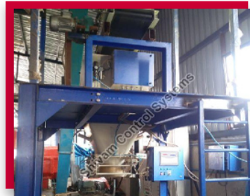
Fertilizer Packing Machine