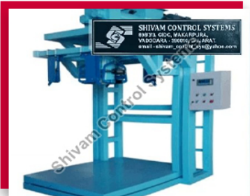
Bulk Bagging Machine