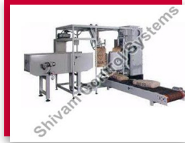
Bag Placer Machine