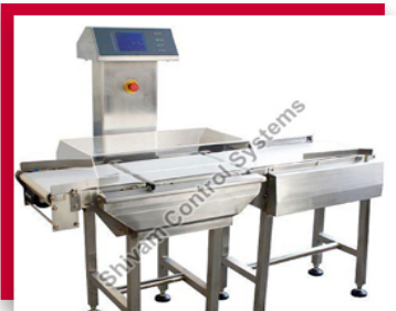
Online Check Weigher