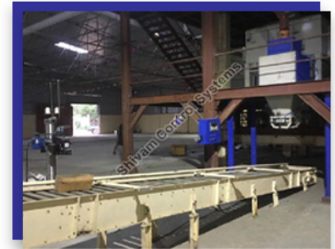
Fully Automatic Pulses Packing Machine