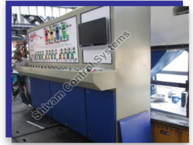
PLC Automation Panel