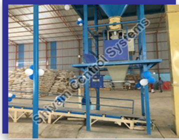
Sugar Packing Machine