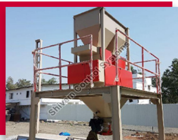
Sugar Filling Machine