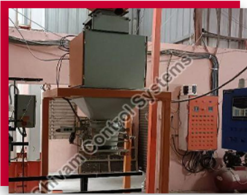
Grain Packing Machine