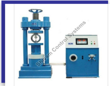
Cube Testing Machine