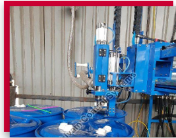
100 to 250 Lt Drum Filling