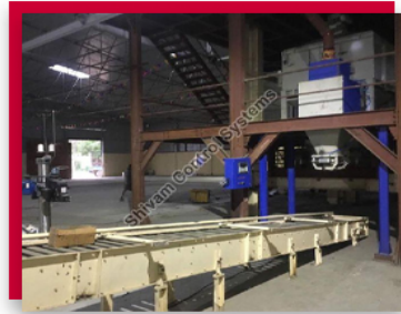
Readymix Packing Machine