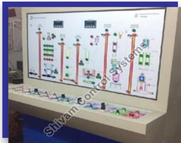
Poultry Feed Plant Automation