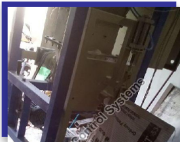
Valve Type Bag Filling Machine