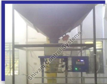
Gross Type Gravity Feeder Bag Filling Machine