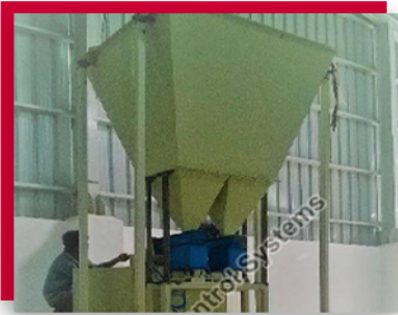
Net Vibrator Feeder Bagging Machine