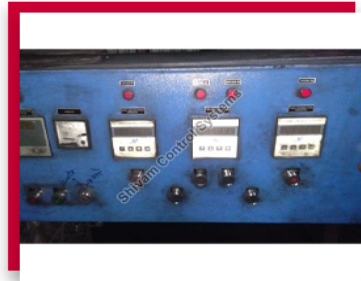
Temperature Based Systems