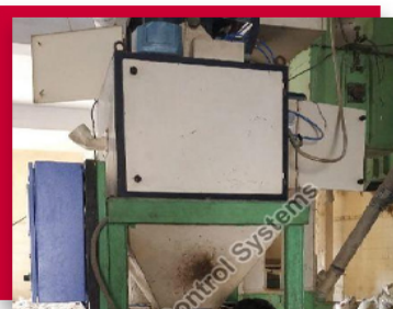
Rice Filling Machine