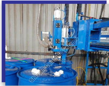
1 to 20 Lt Drum Filling