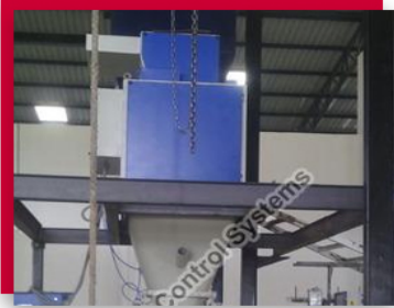
Semi Automatic Net Bagging Machine