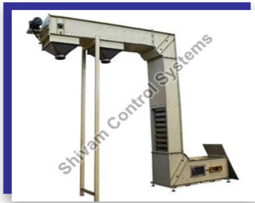
Z Type Conveyors