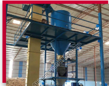
Net Type Dual Feeder Bag Filling Machines