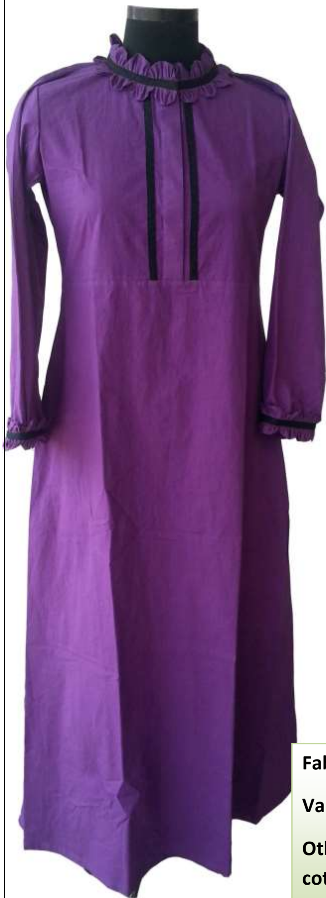
HDA-415-06-purple abaya with concealed front button with gather sleeves and neck