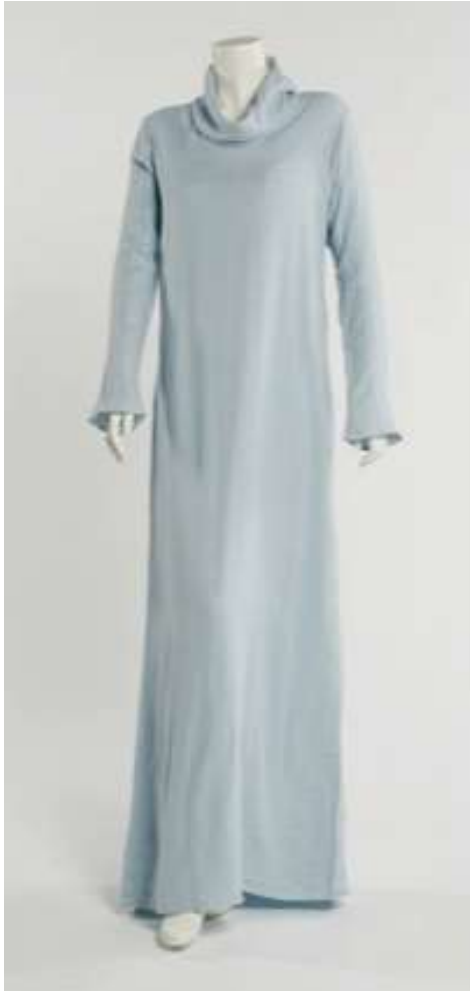
Cowl Neck Abaya HDD-AB227