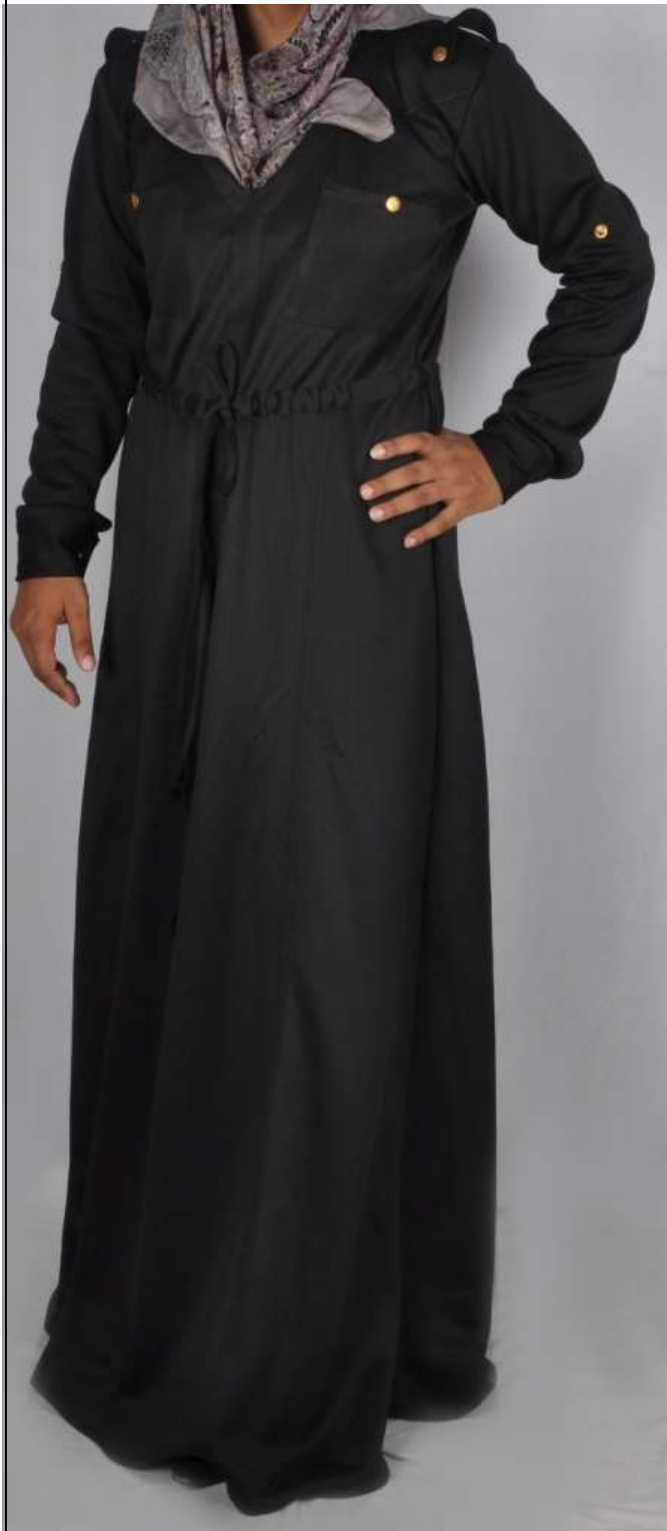
HDA-715-02- Epaulette with drawstring abaya