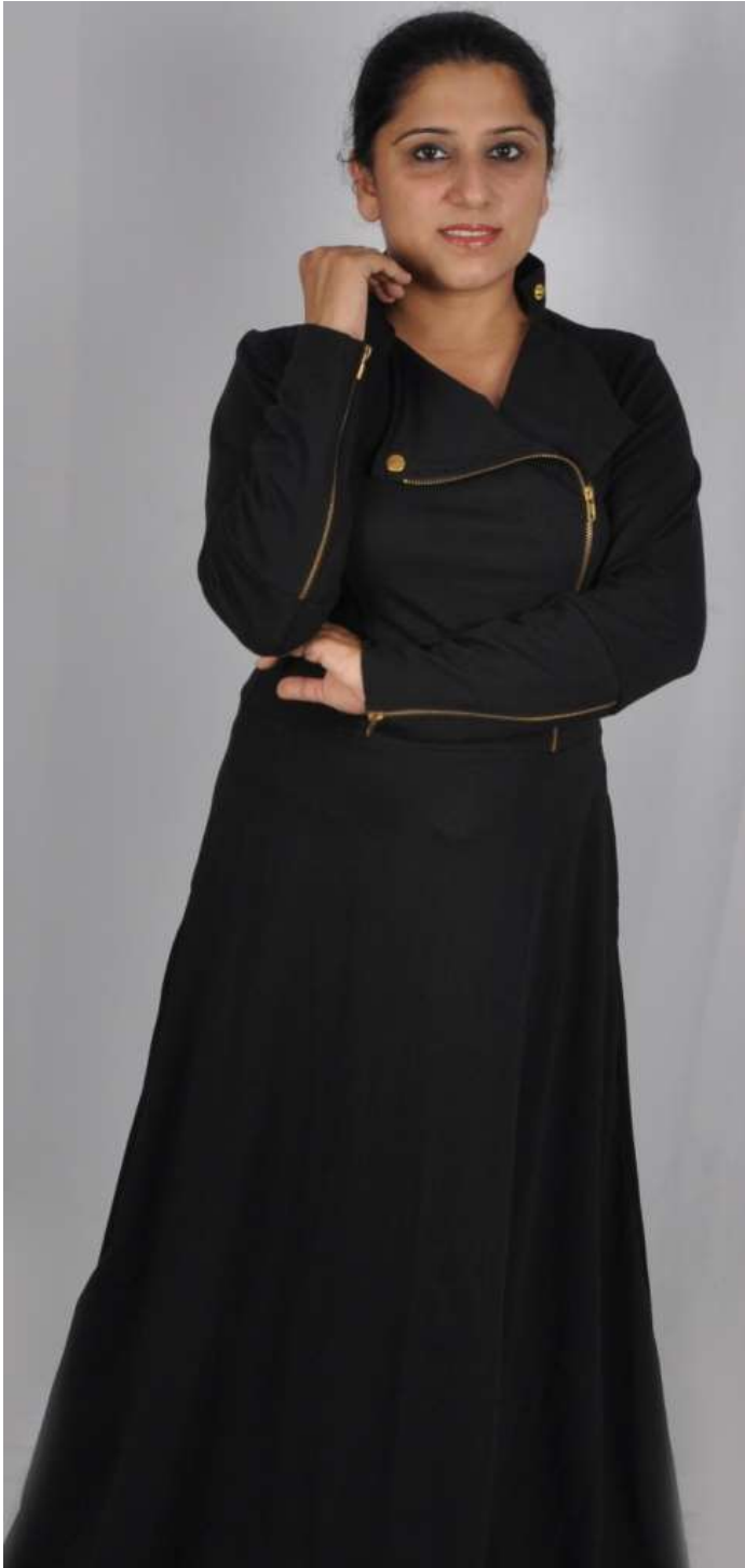
HDA-715-04- Zipper Abaya