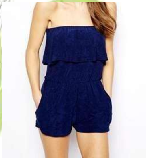
HDD BW 237