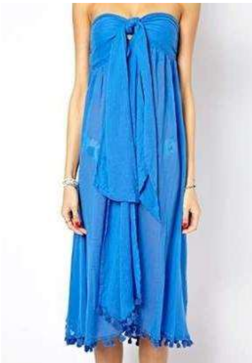
HDD BW 238