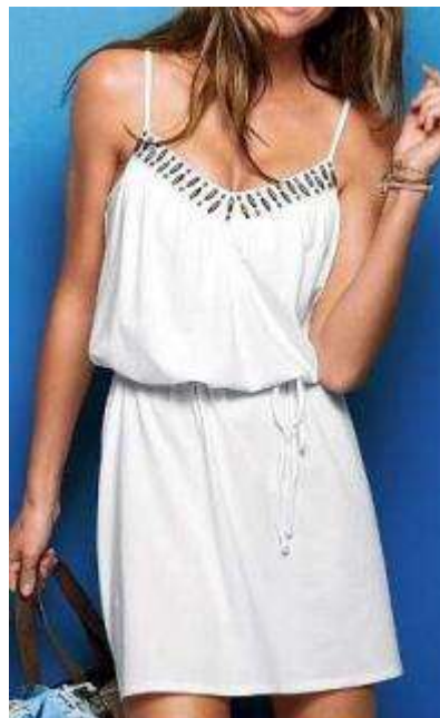
Code: HDD BW231