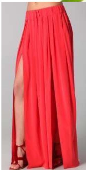
Code: HSkirt-Side-double slit