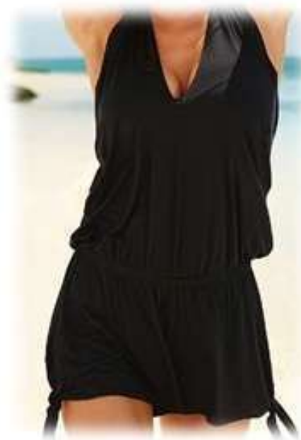
Code: HDD BW207