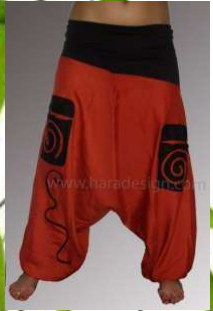
Code: POCKET- PANTS-TERACOTA

Description: Harem Pants have the ease of movement, pull on style.