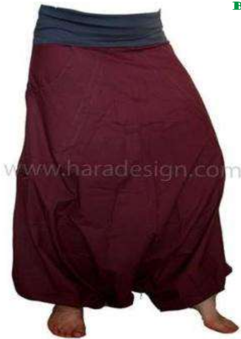
Code: HDS-16 Pocket Harem