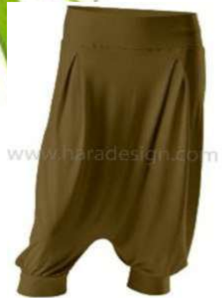
Code: HDA26 Pleated Harem