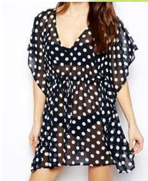
HDD BW 236