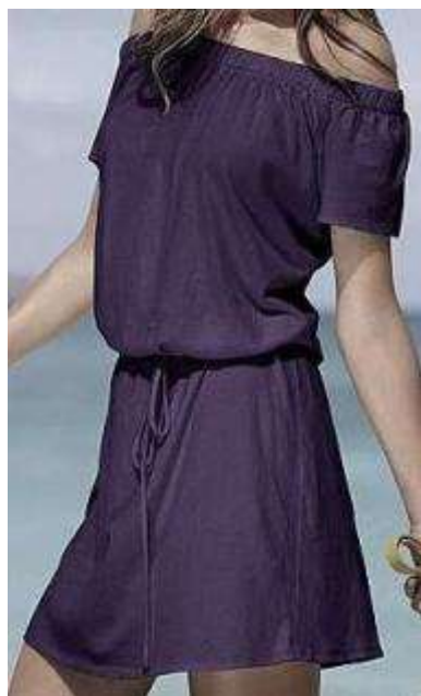
Code: HDD BW206