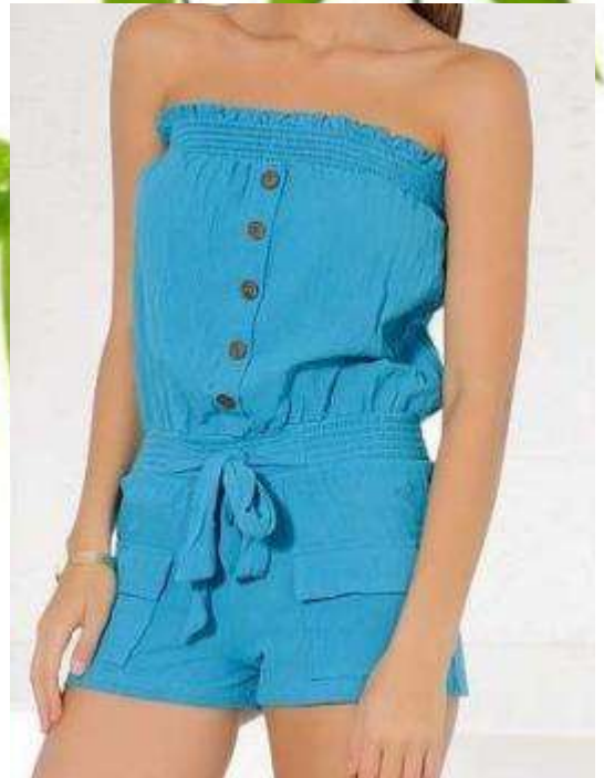
HDD BW 235