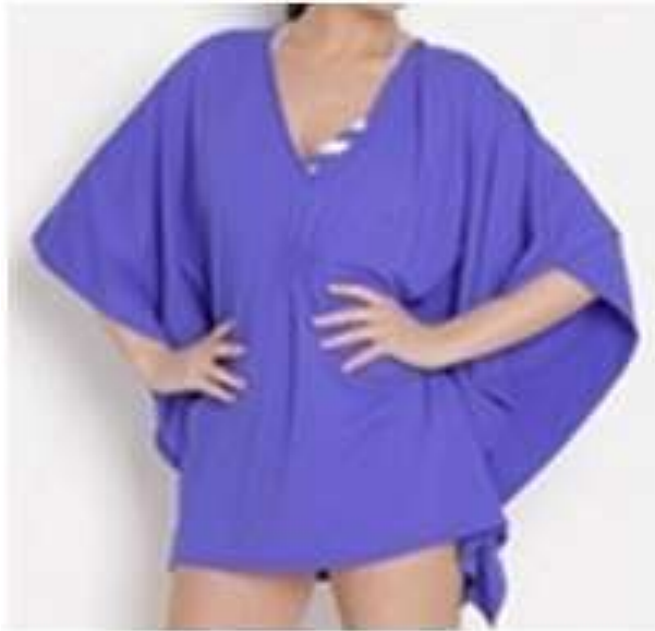
HDD BW 232