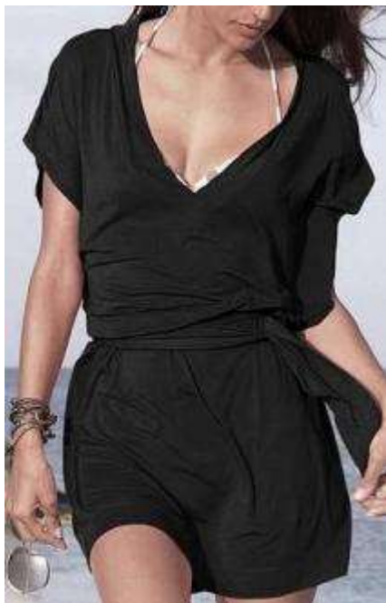
Code: HDD BW230