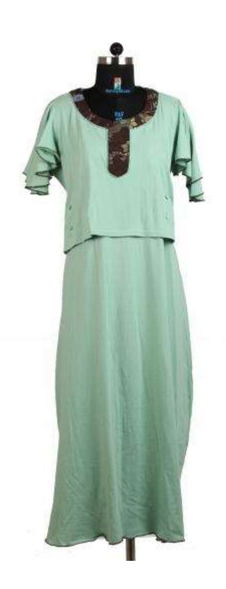
HDMW-619-16 Maxi maternity nursing dress with pull up top for nursing