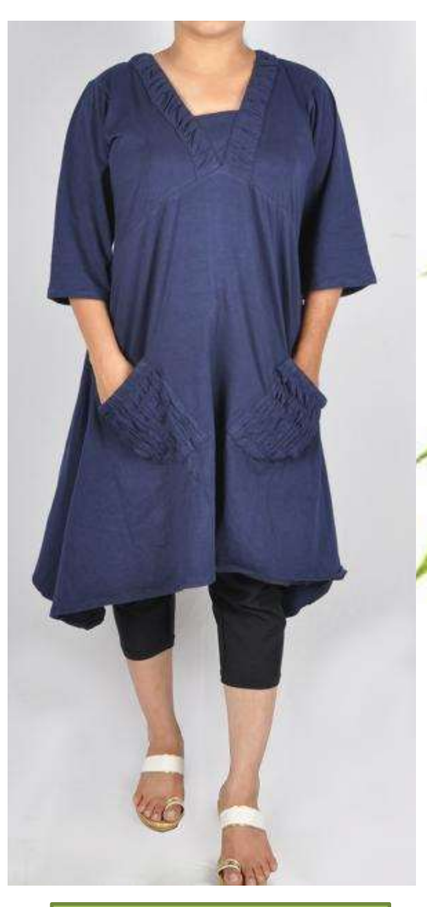
HDD-715-11 Made in cotton knit lycra asymmetrical dress with designer front pocket and 3/4<sup>th</sup> Sleeves