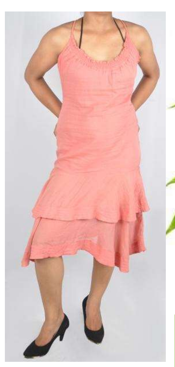
HDD-715-24 Stylish dress with round neck with spaghetti strap with neck gather dress