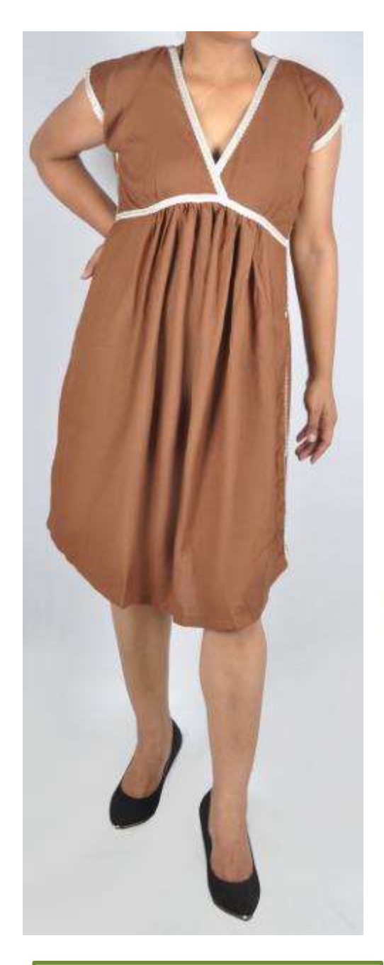
HDD-715-20 Made bamboo a V neck dress with lace piping and front gather