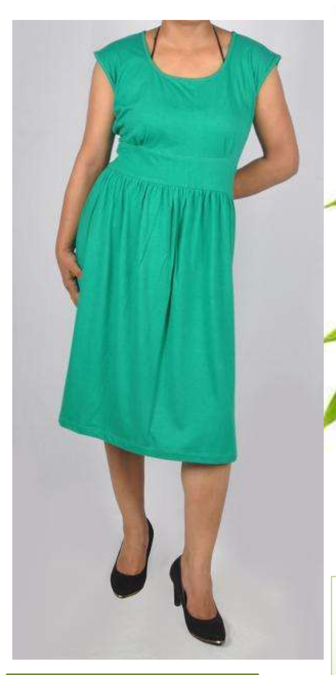
HDD-715-07 Made in organic cotton knit fabric with lycra a knee length tunic dress with waist band