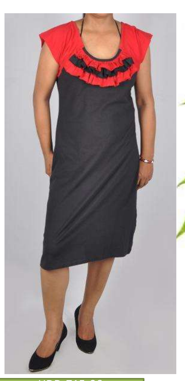
HDD-715-06 Made in organic cotton knit fabric with lycra a knee length dress with designer frill neck in dual color and cap sleeves