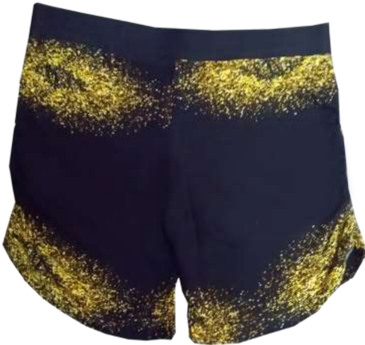
HDSH-0518-04 Black shorts with glitter print in stretchable fabric