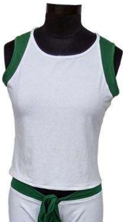
HYT 915-03 Twin color sleeveless yoga top