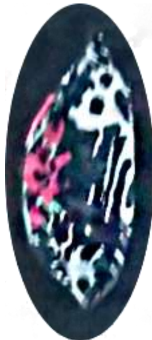
Print of the pocket - closeup

Fabric: Cotton Knit/ Organic Cotton/Bamboo lycra