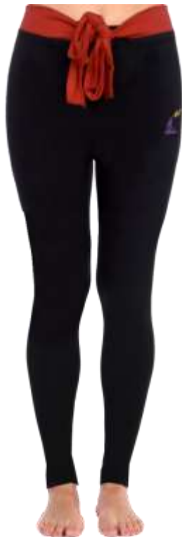
HYT 915-06 Twin color yoga leggings with tied ribbon knot in front