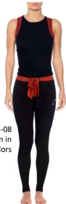
HYT 915-08 Combination of top and bottom in two colors