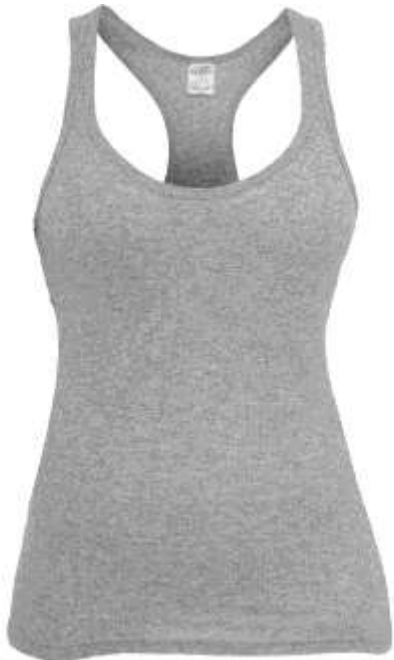
HDY 915-14 Yoga Vest Top with racer back

Fabric: Cotton Knit/ Organic Cotton/Bamboo lycra