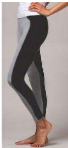
HDY – 915-01 Twin Tone yoga leggings with side panel