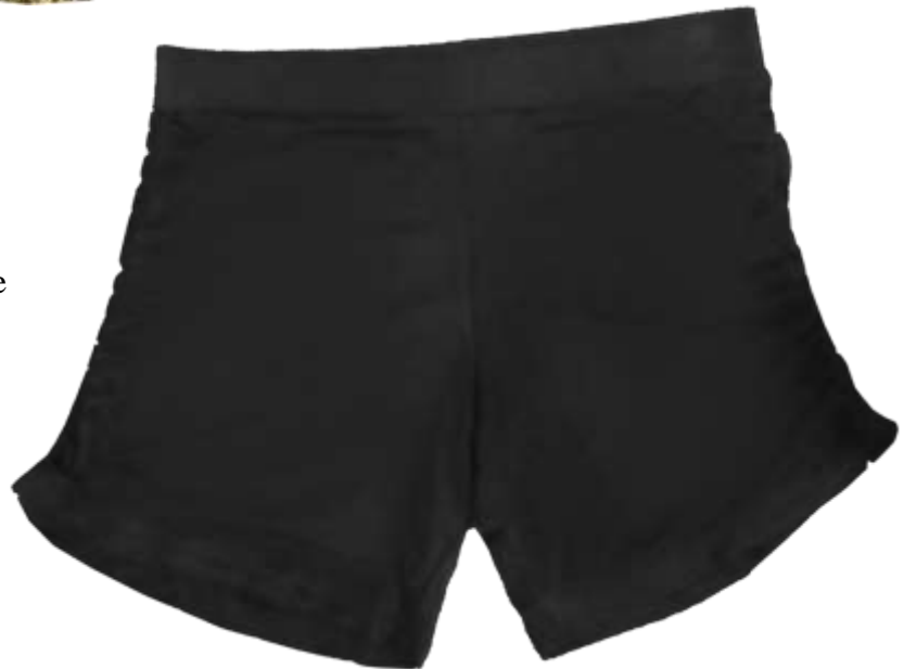
HDSH-0518-02 Plain black shorts in stretchable organic fabric

Fabric: Cotton Knit/ Organic Cotton/Bamboo lycra