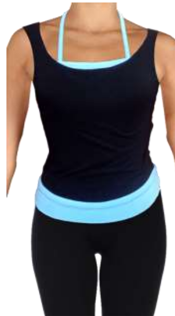
HYT 116-01 Black and light blue half sleeves top

Black Sleeveless yoga top in two colors with a cool back design, Wear it for yoga or daily exercise routine or just wear it with your jeans for a nice stroll on a hot summer day