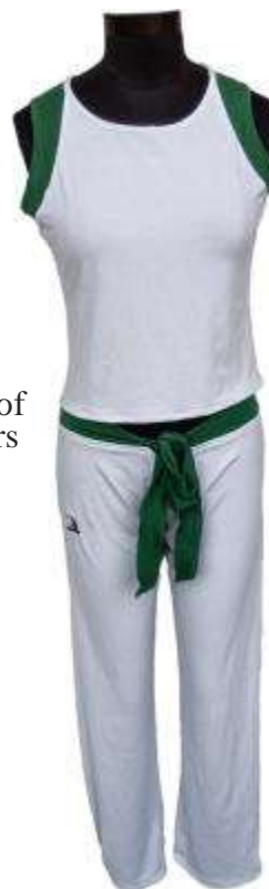
HYT 915-05 Combination of top and bottom in two colors

Fabric: Cotton Knit/ Organic Cotton/Bamboo lycra