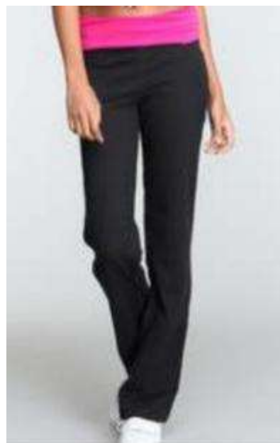
HDY – 915-02 Yoga pants with contrast waistband