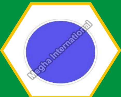
Blue P3R- Reactive Dyes