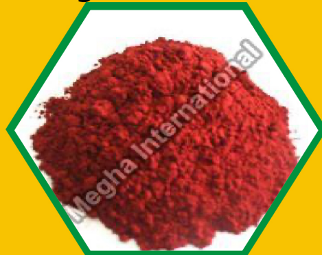
Organic Pigment Powder