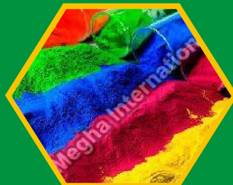
Blue P2RN Dyes