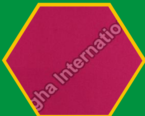
Red 6B - Direct Dyes