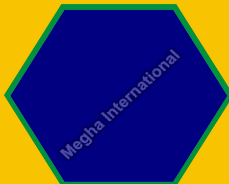
Blue 2G-Acid Dyes