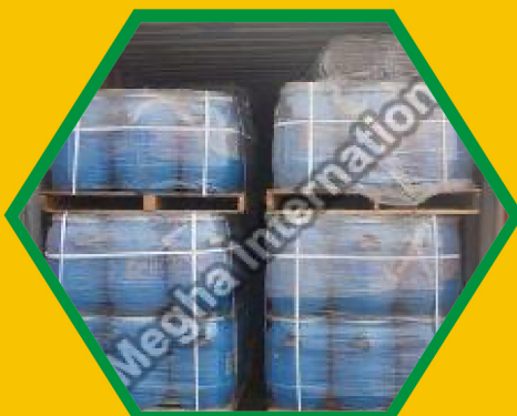
Blue 9 Acid Dyes