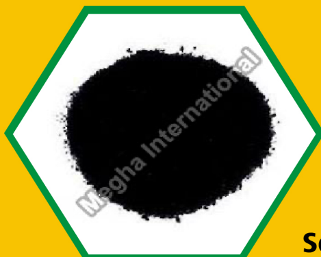
Black 27 Solvent Dyes