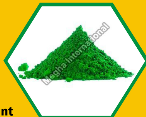
Solvent Green Dye