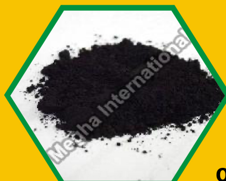
Black Pigment Powder