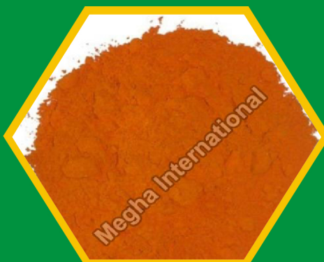
Direct Orange 39 Dyes