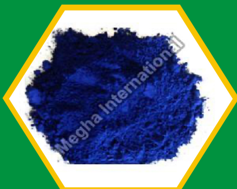
Brilliant Blue Food Color