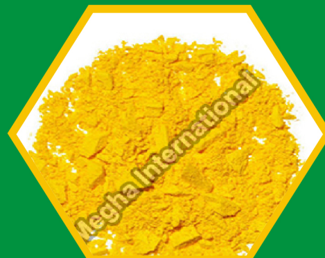
Yellow Liquid Dyes