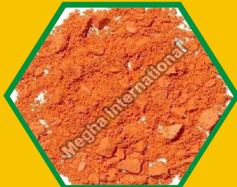
Solvent Orange 3 Dye