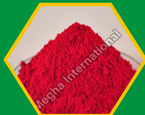
Fast Red 5B - Direct Dyes