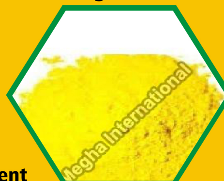
Lemon Chrome Pigment