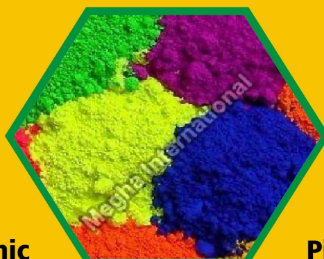
Fluorescent Pigment Powder