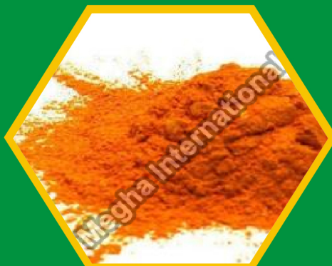
Orange Liquid Dyes