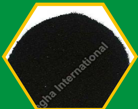
Black Vsf 22 Direct Dyes