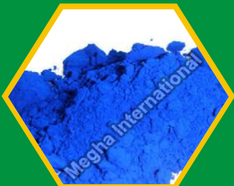
Blue Liquid Dyes