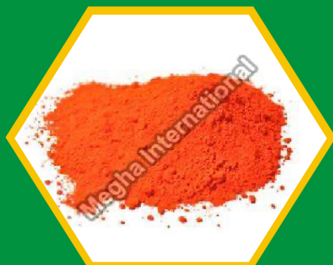
Methyl Orange Powder