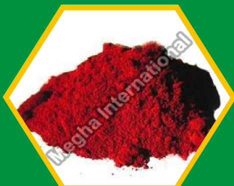
Red Liquid Dyes