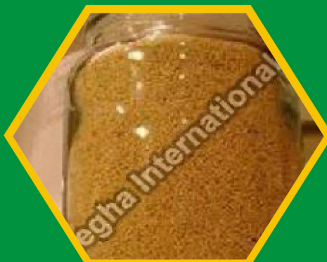
Amaranth Food Color