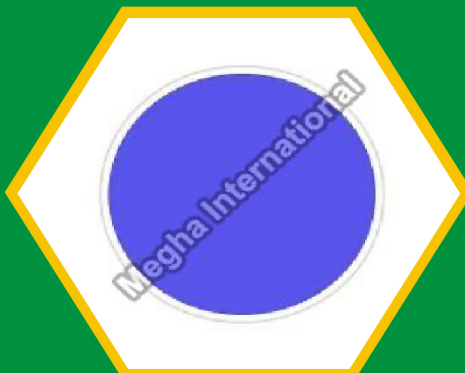
Blue H5r Dyes