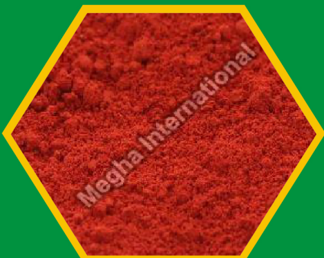
Allura Red Food Color