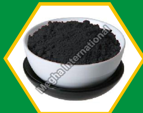
Black PN Food Color