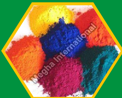
ED Type Reactive Dyes