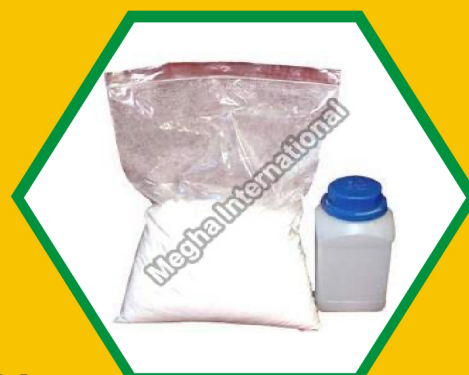
2,5 Dichloro Aniline 4-Sulfonic Acid