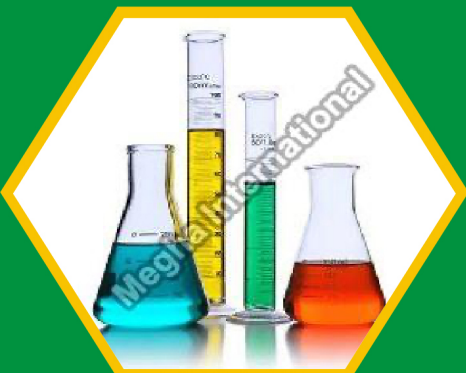
Basic Violet 3 Dyes