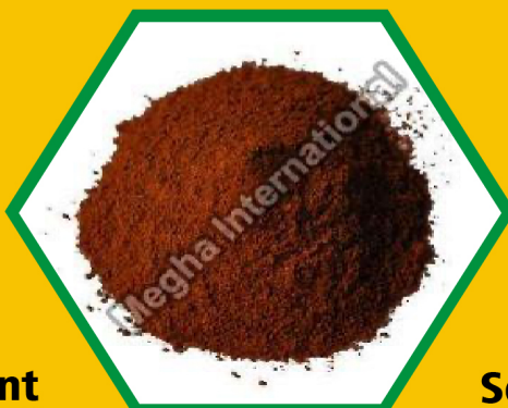
Solvent Brown Dye